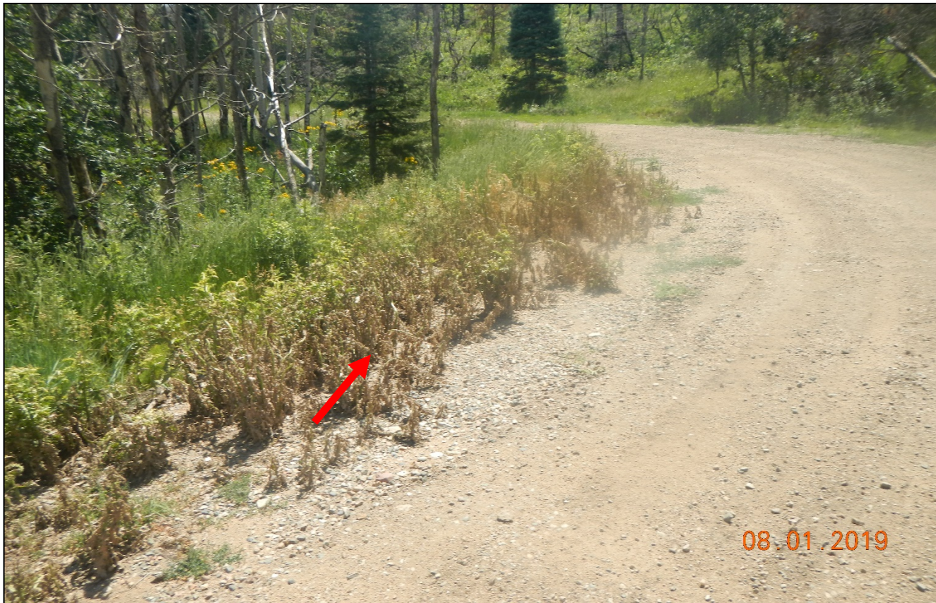
Photo 2. There are some noxious weeds along the road that are wilting.