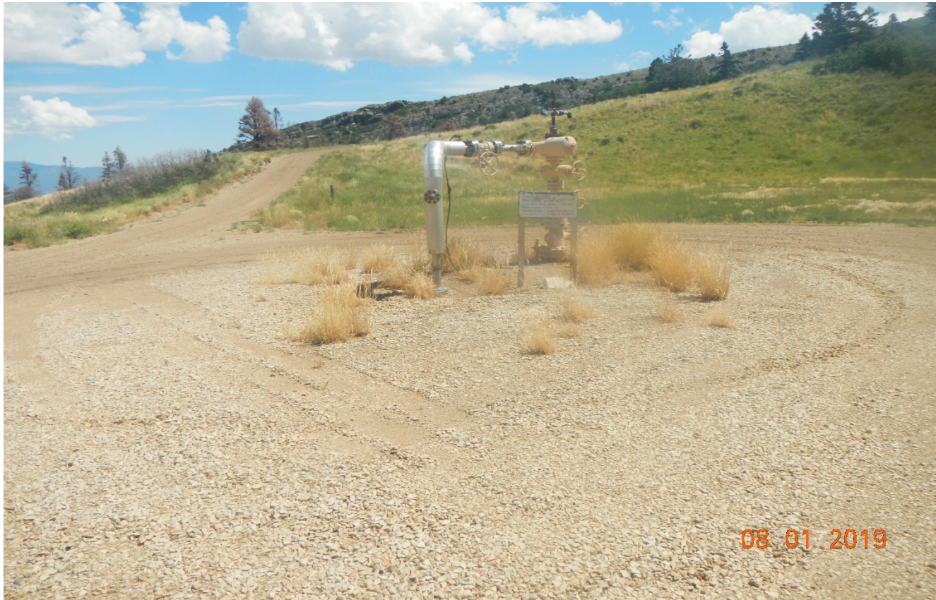
Photo 3. The operator name does not reflect current operator.