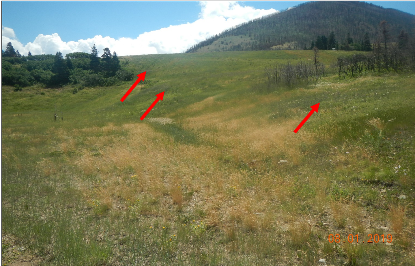
Photo 5. Further back facing south at the location. Red arrows point to noxious weed infestation (Red arrow).