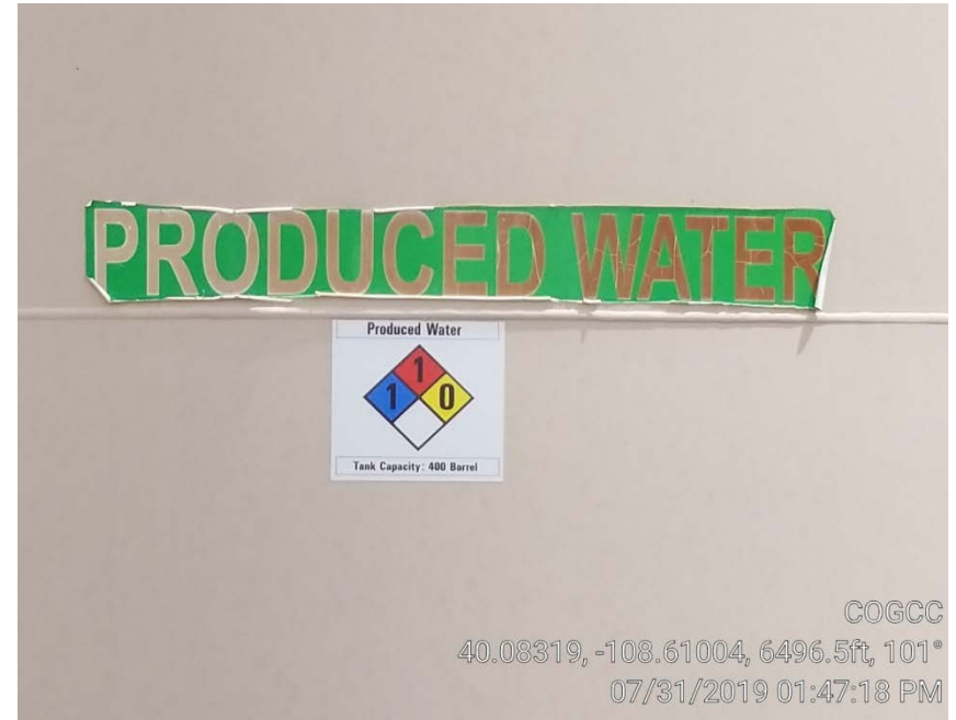
Photo 7. Tank label.