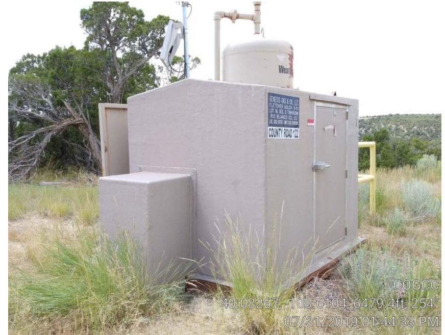
Photo 3. Meter building weeds.