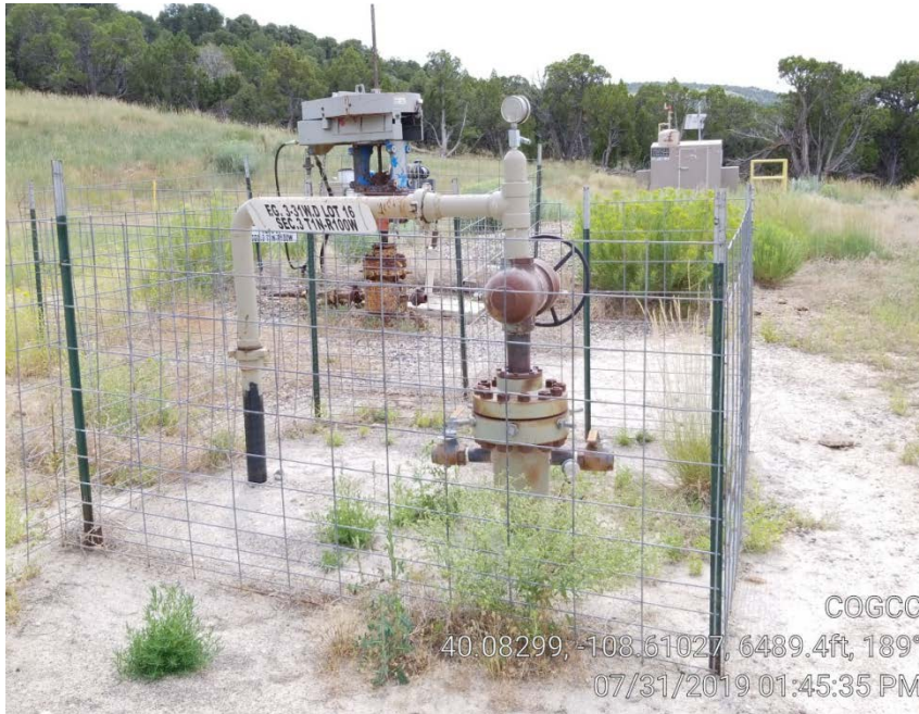
Photo 2. Well head weeds.