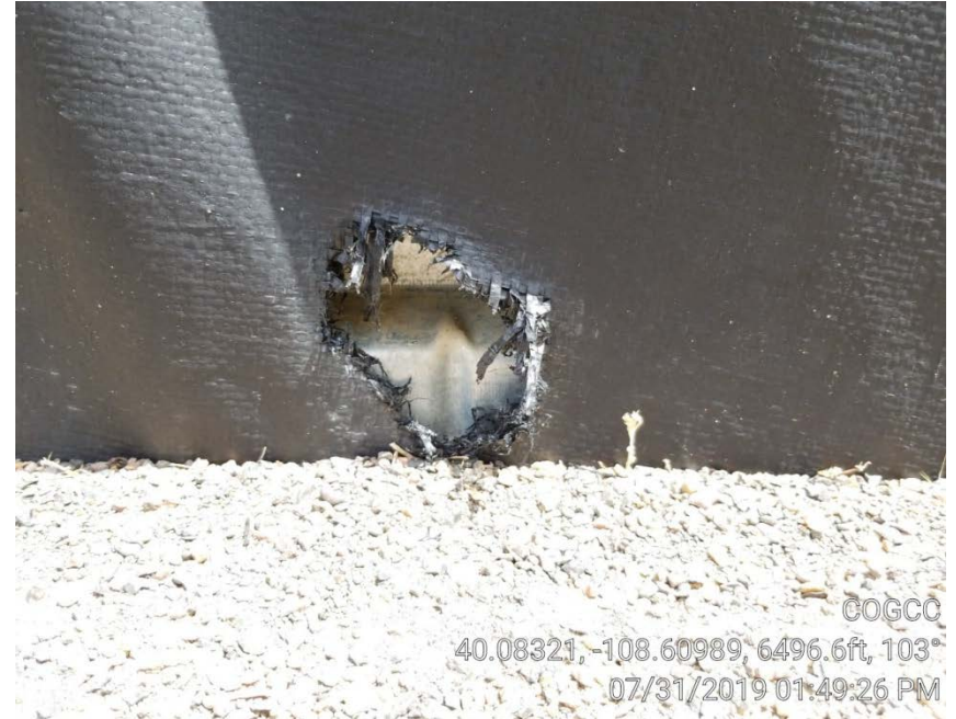
Photo 5. Tank secondary containment liner.