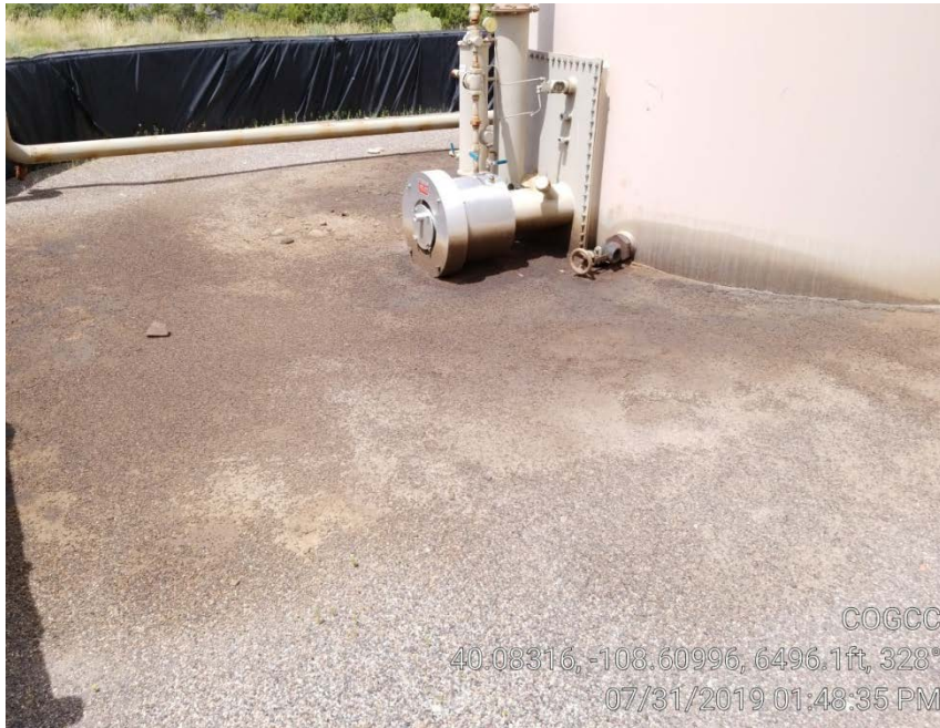
Photo 6. Stained soil.