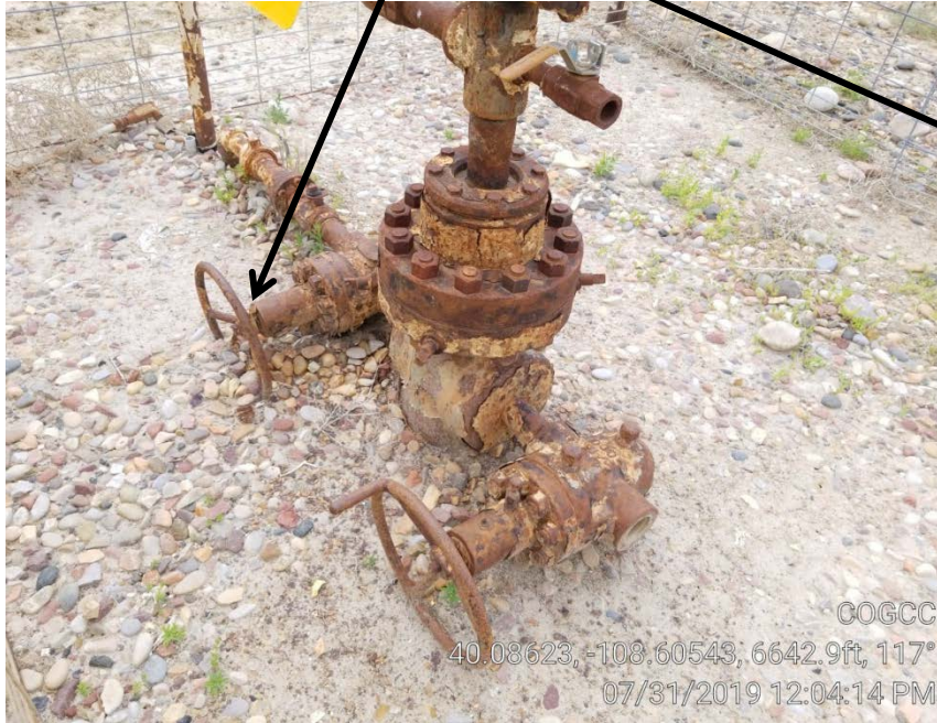
Photo 2. Well head.