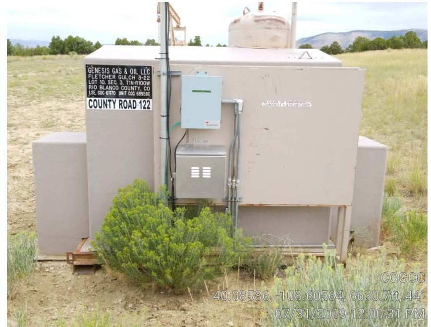
Photo 5. Meter building weeds.