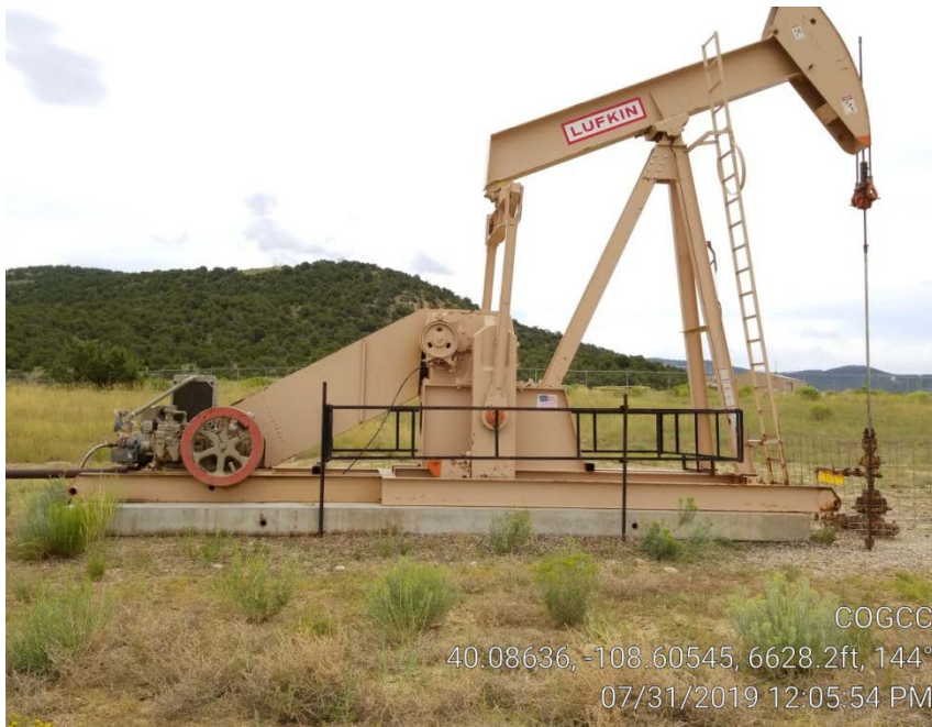
Photo 4. Pump jack weeds.