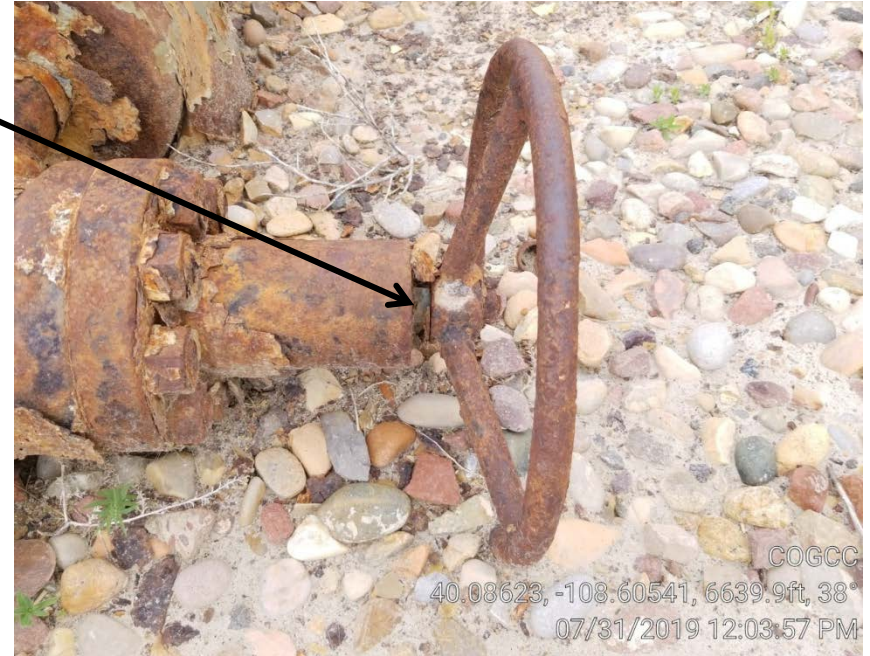
Photo 3. Well head casing valve.