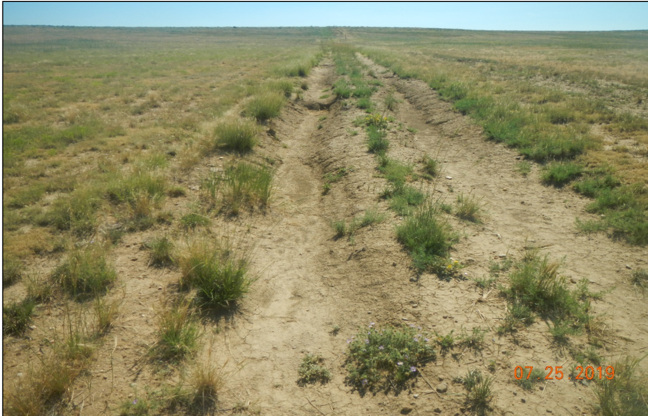
Photo 2. Facing east along the access road which was requested to remain. There are erosion issues along the road that need to be repaired and stabilized.