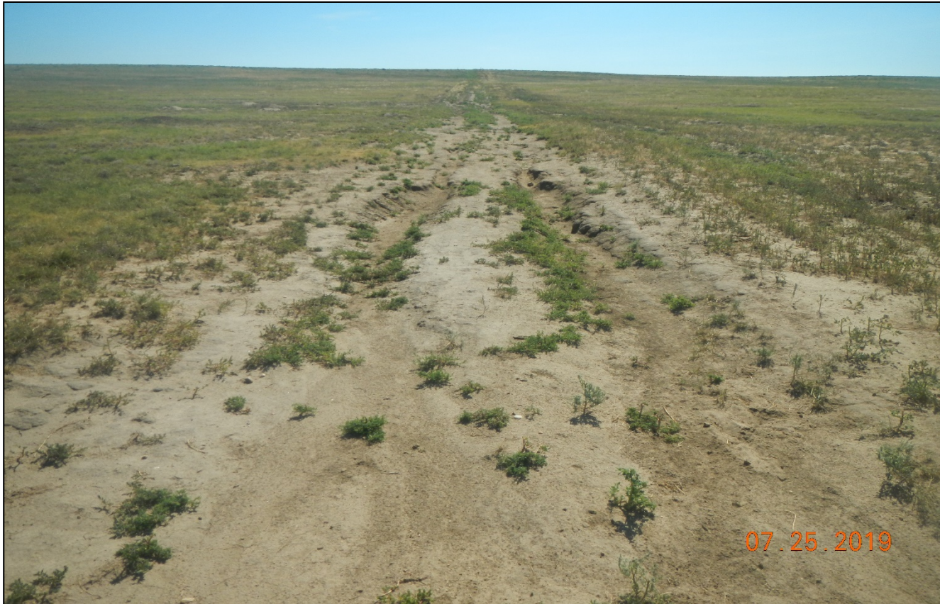
Photo 1. Facing east along the access road which was requested to remain. There are erosion issues along the road that need to be repaired and stabilized.