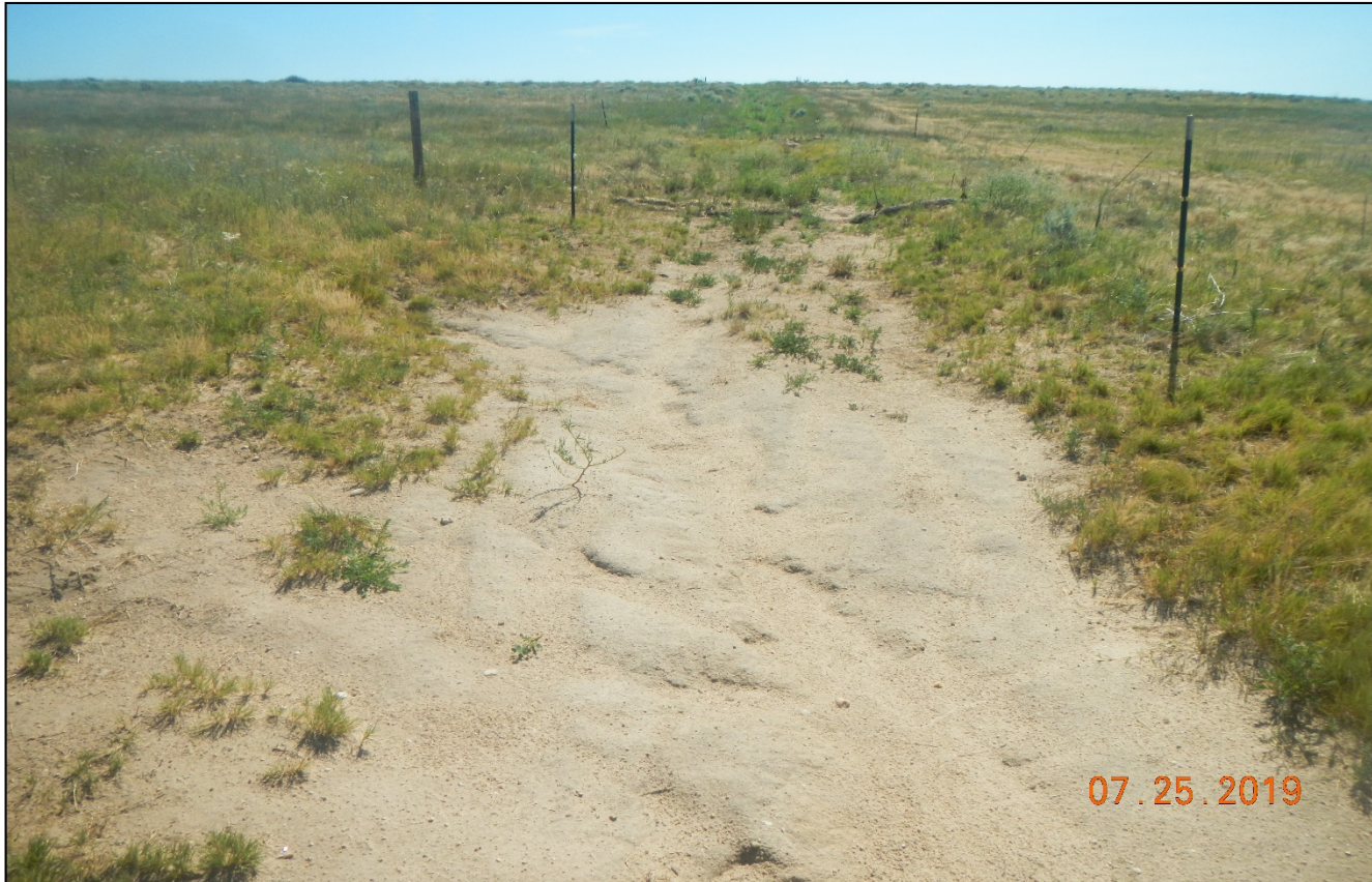
Photo 3. Facing east along the access road closer to the location which was reclaimed. The fence around the road is degraded.