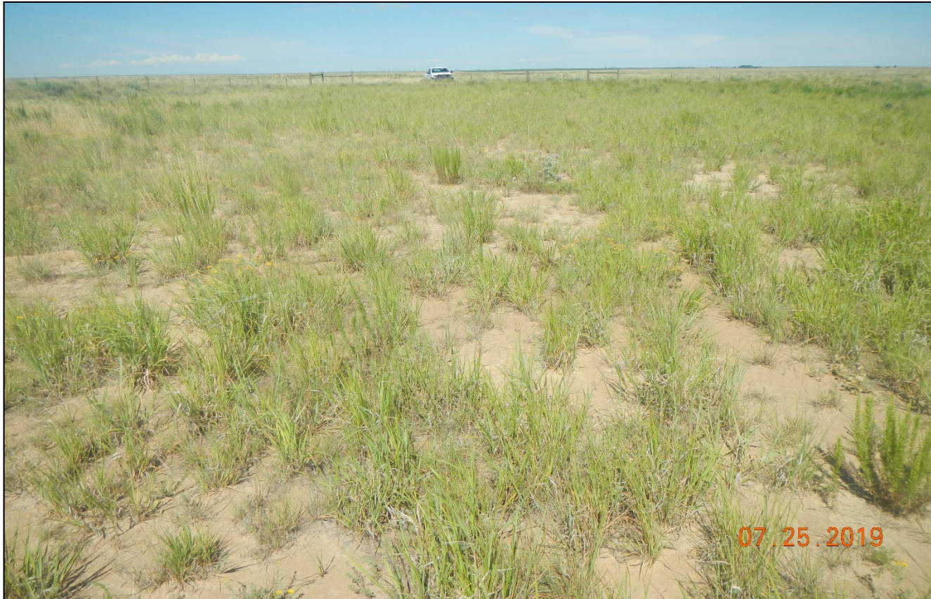
Photo 8. Facing west at the location. Vegetation is well established at this area.