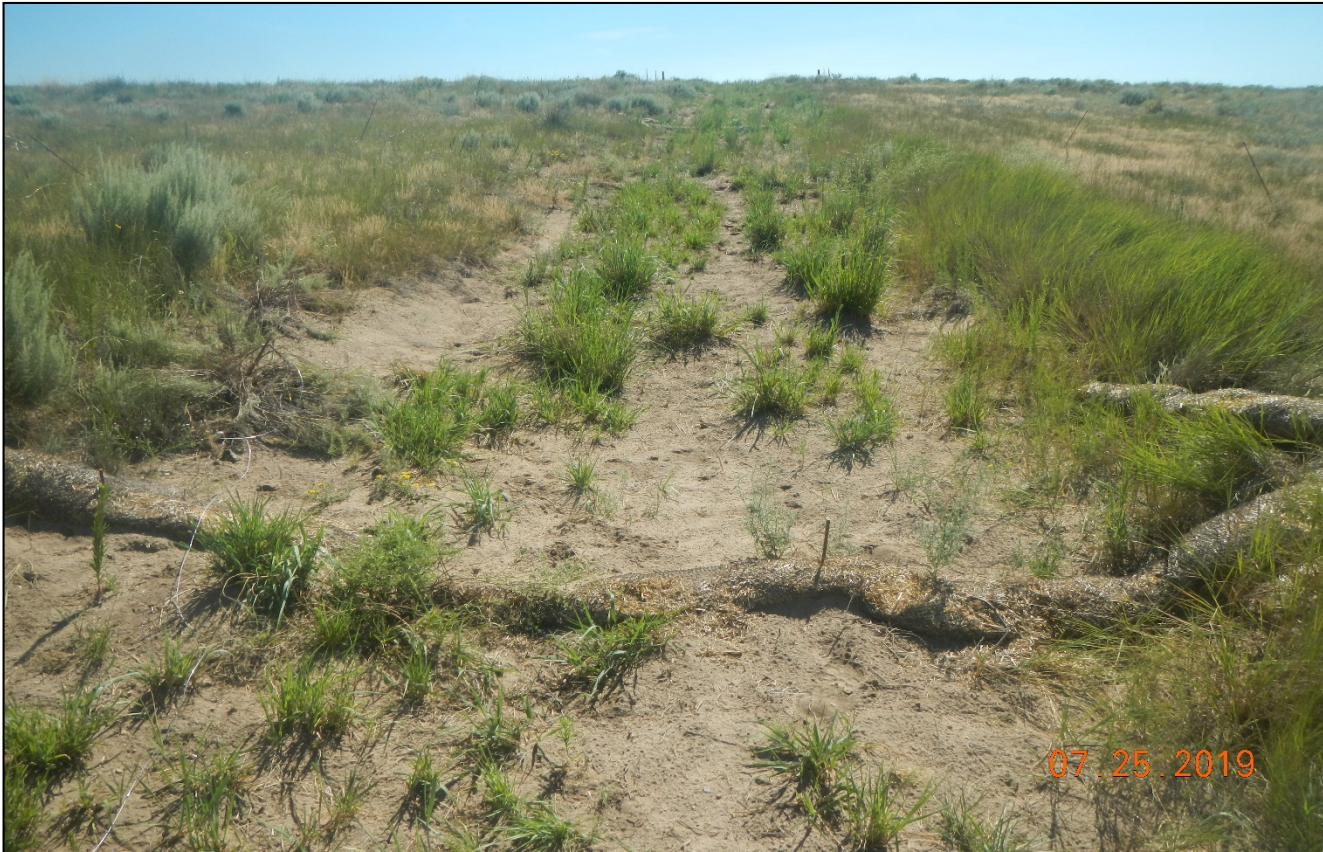
Photo 4. Wattles are degraded along the reclaimed road which has not revegetated.