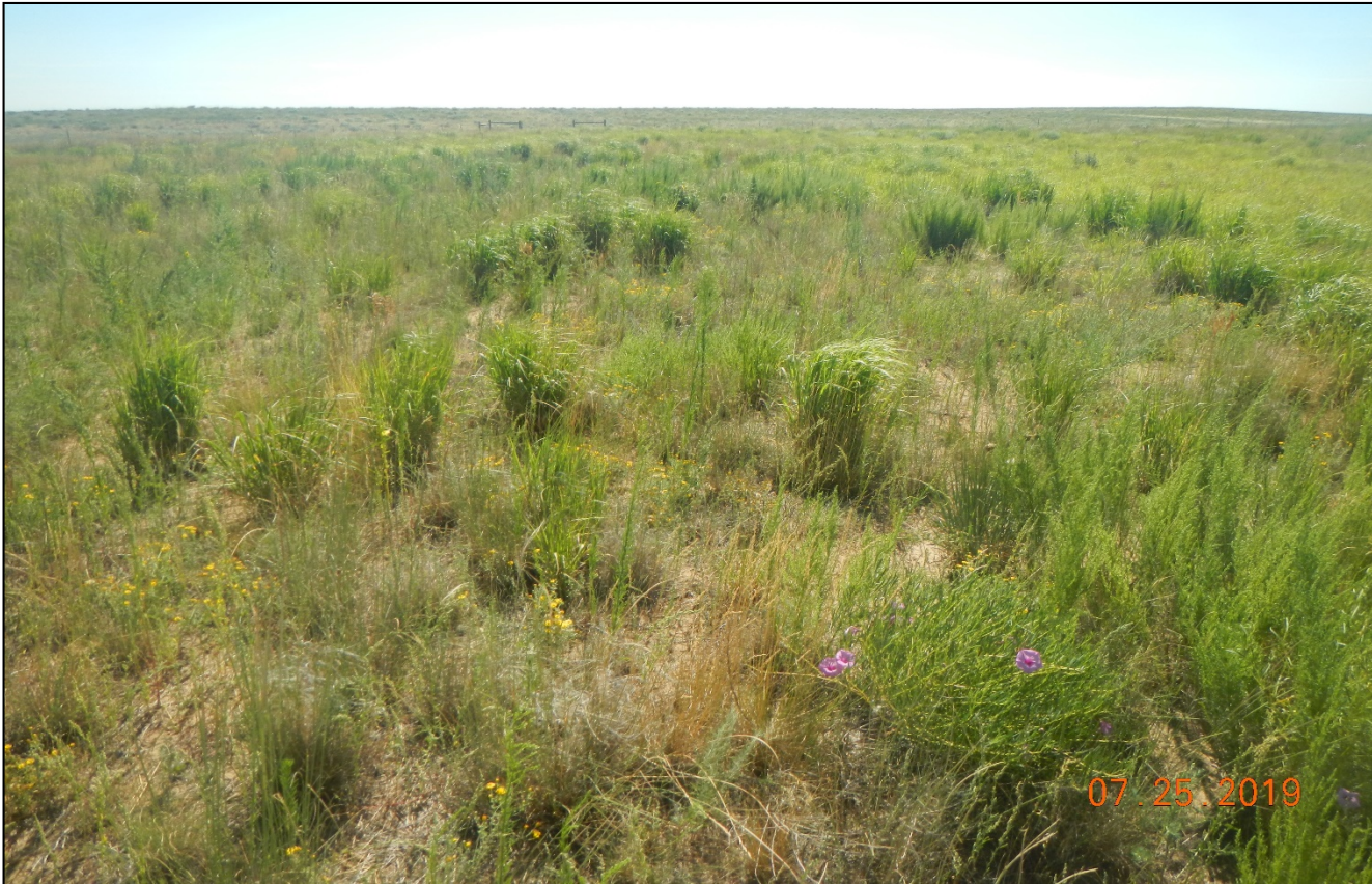
Photo 9. Facing northeast at the location. Vegetation is well established at this area.