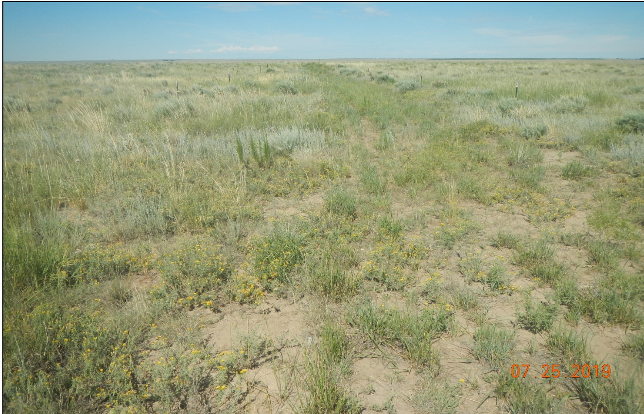
Photo 5. Facing back to the west at the access road near the location.