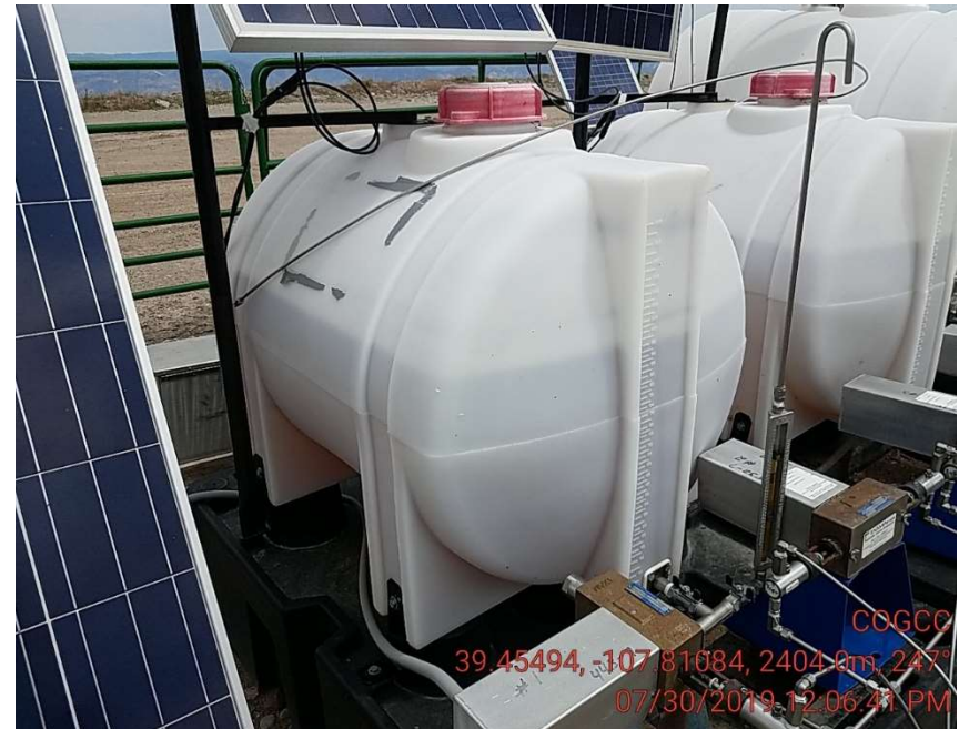
4 unmarked tank