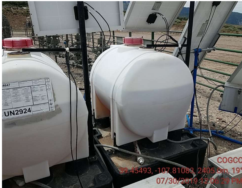
3 unmarked tank