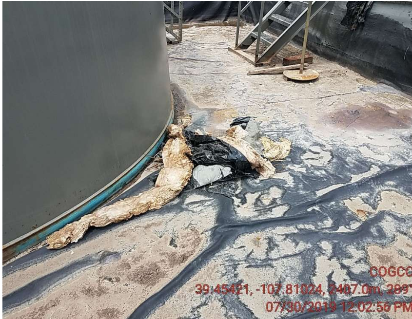
5 Trash in battery