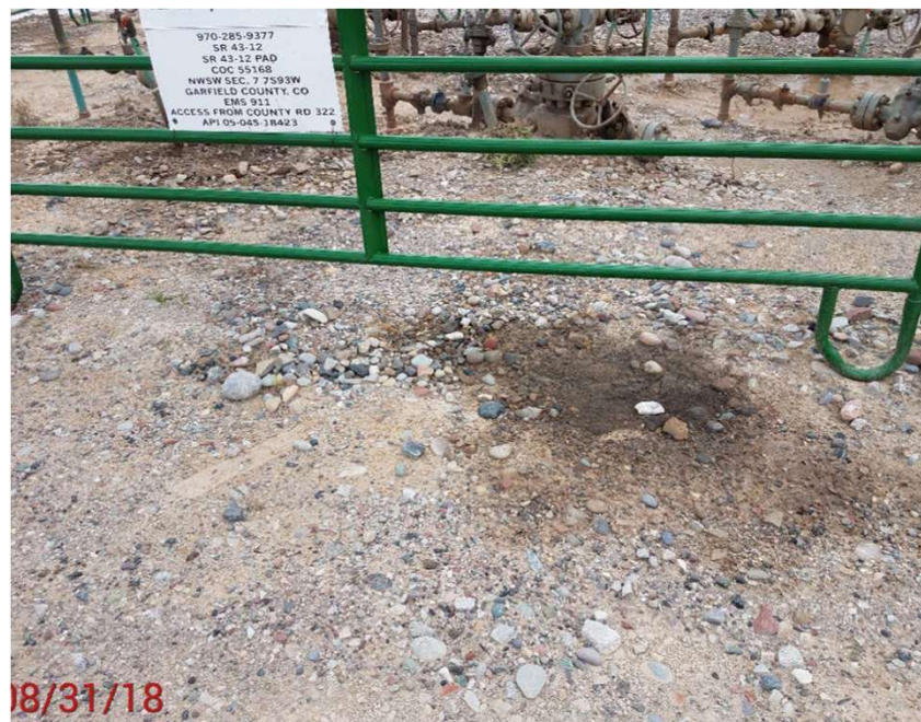
4 staining from previous inspection