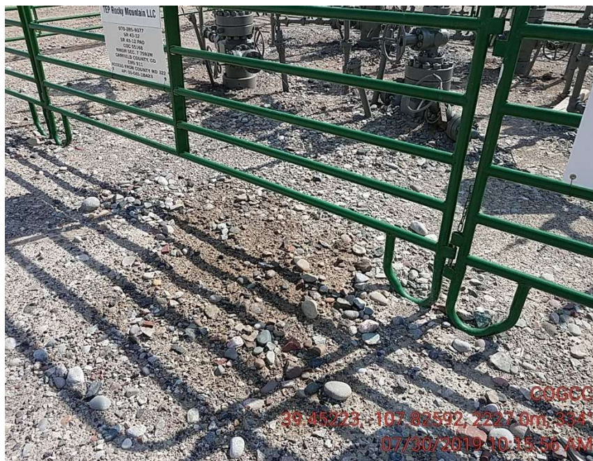
3 Staining still present