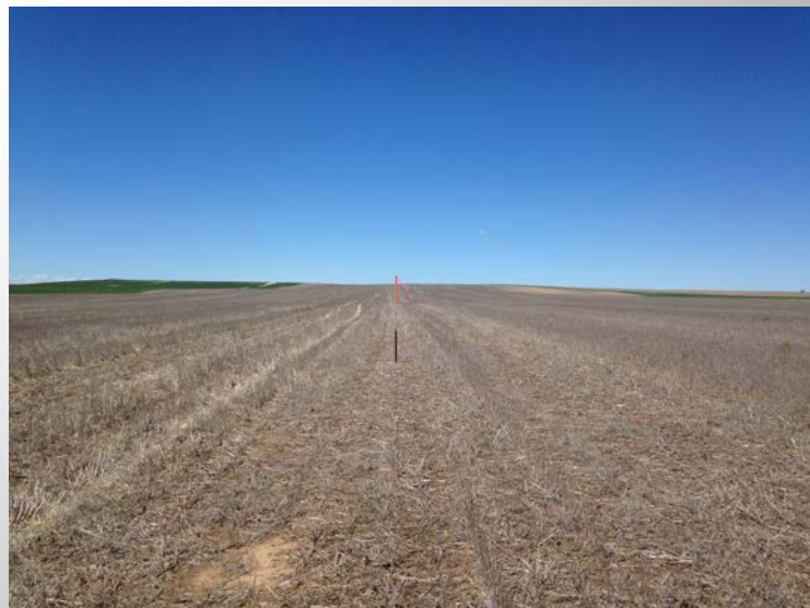
Armstrong #3 • West View