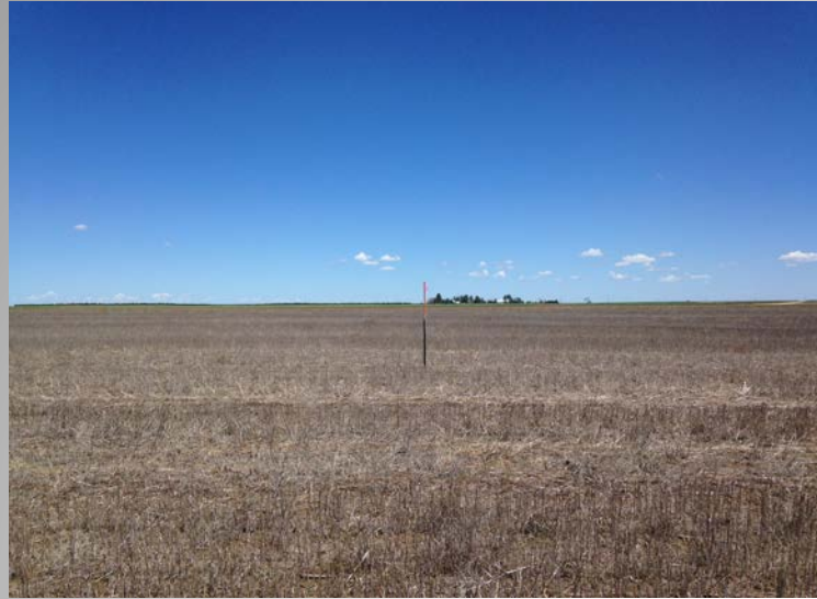
Armstrong #3 • North View

SHL: NE-1/4 of SE-1/4 Section 21-T3S-R51W-6 th PM Washington County, Colorado