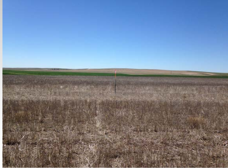
Armstrong #3 • South View