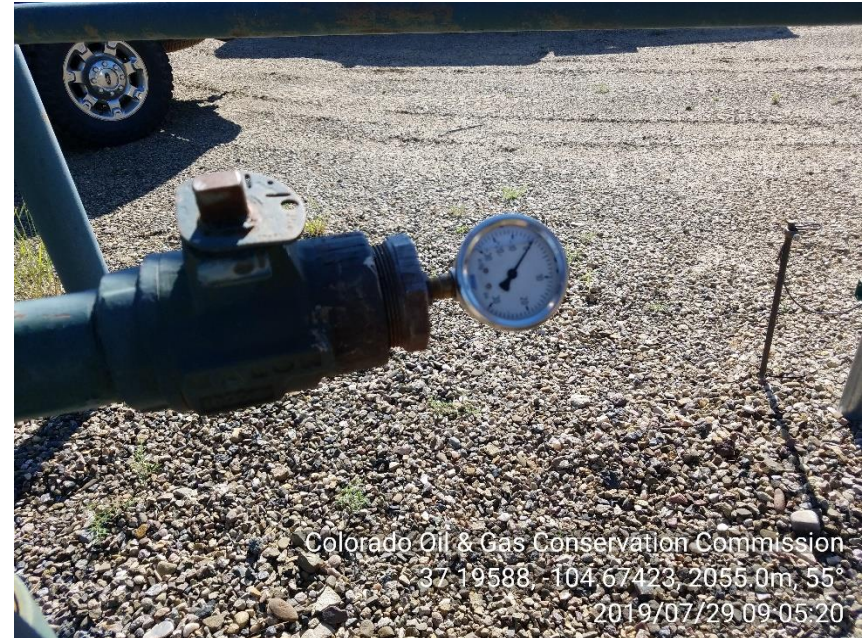
PHOTO 4: BACKSIDE BETWEEN CSG & TBG 0 PSI MONITORED FOR 15 MINUTES NO CHANGE