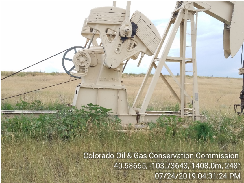
Photo #1 Henderson 2 (05-123-07007) Wellsite Shut-In | SI NO well sign posted No pumpjack safety guard Weeds