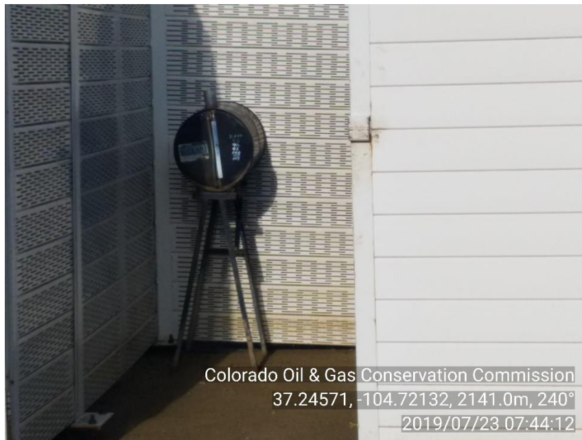
Colorado Oil & Gas Conservation Commission 37.24571, -104.72132, 2141.0m, 240° 2019/07/23 07:44:12