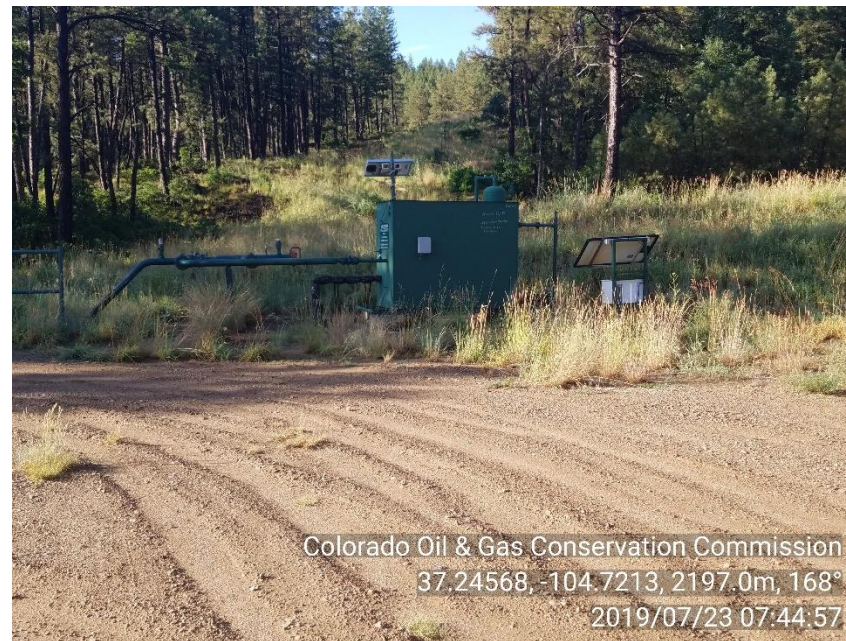
Colorado Oil & Gas Conservation Commission 37.24568, -104.7213, 2197.0m, 168° 2019/07/23 07:44:57

PHOTO 3: UNUSED EQUIPMENT STORED ON LOCATION. REMOVE UNUSED EQUIPMENT. COMPLY WITH RULE 603. CA DATE 8/24/19