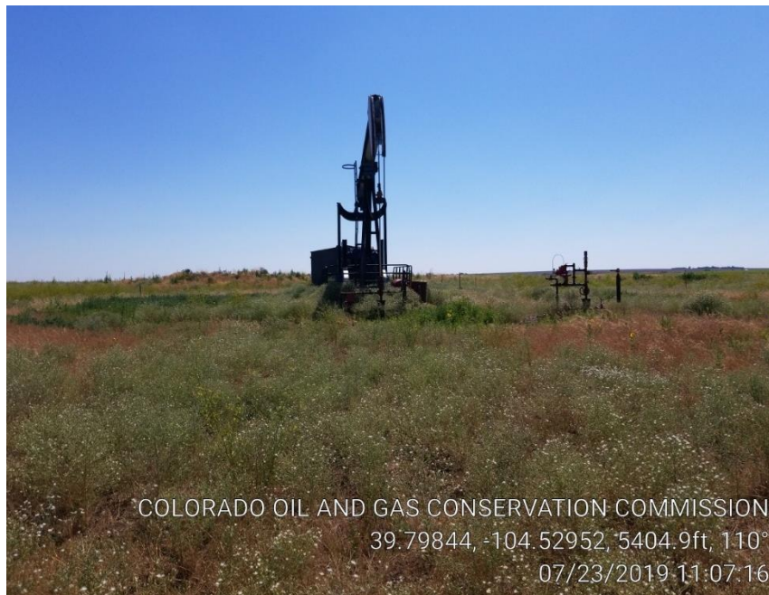
Pic 1 wellheads/weeds