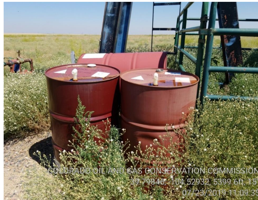
Pic 4 chemical tanks no BMP