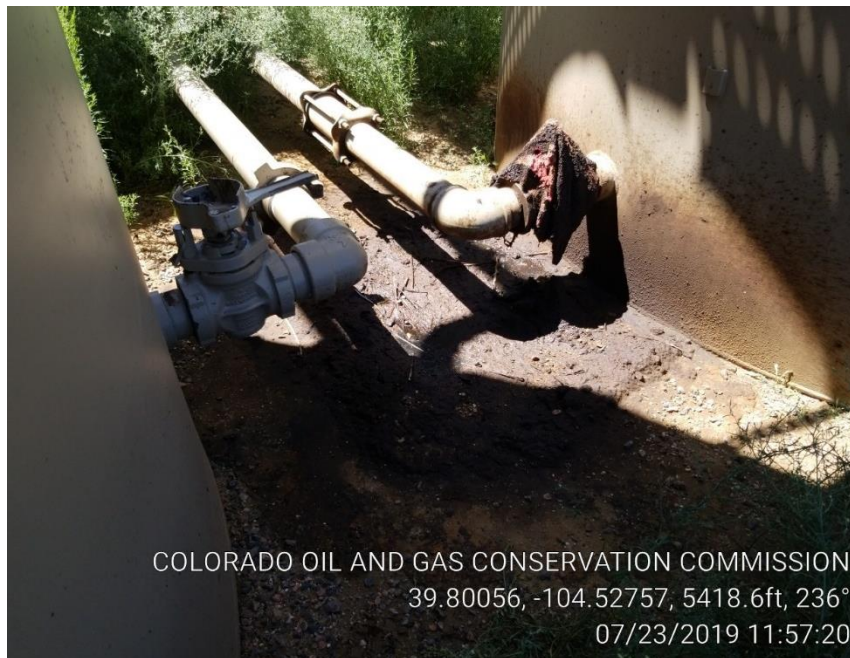
Pic 17 spill/possible leak