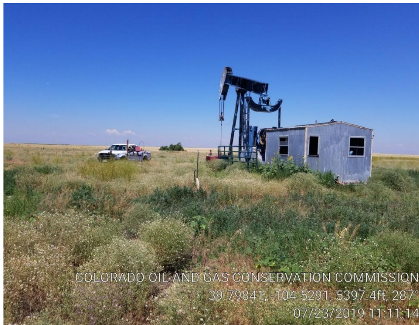
Pic 5 weeds