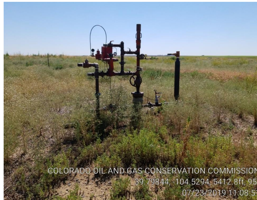
Pic 2 wellhead