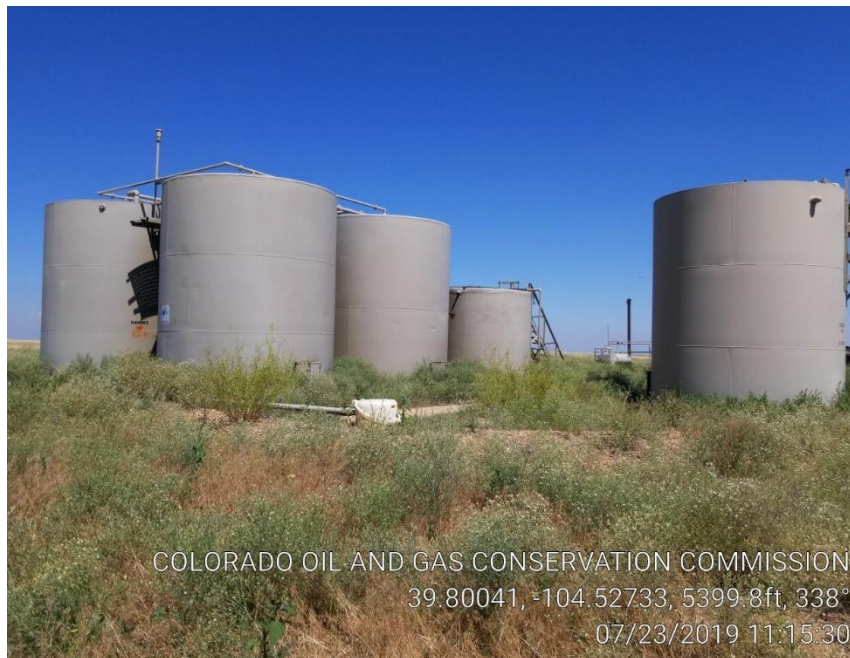
Pic 7 tanks