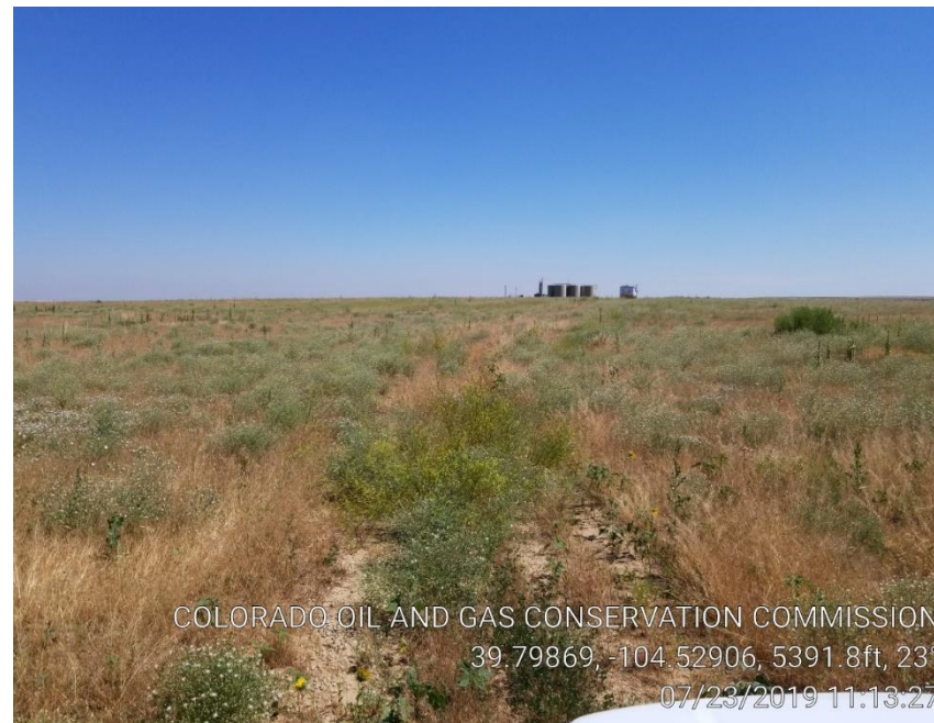
Pic 6 road with weeds