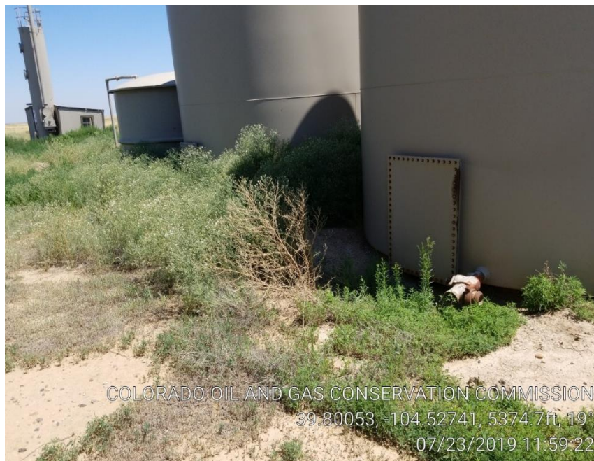
Pic 19 no caps