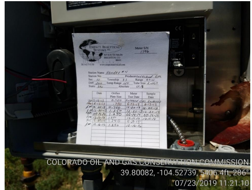
Pic 13 gas meter run not calibrated