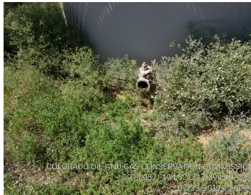
Pic 20 no caps