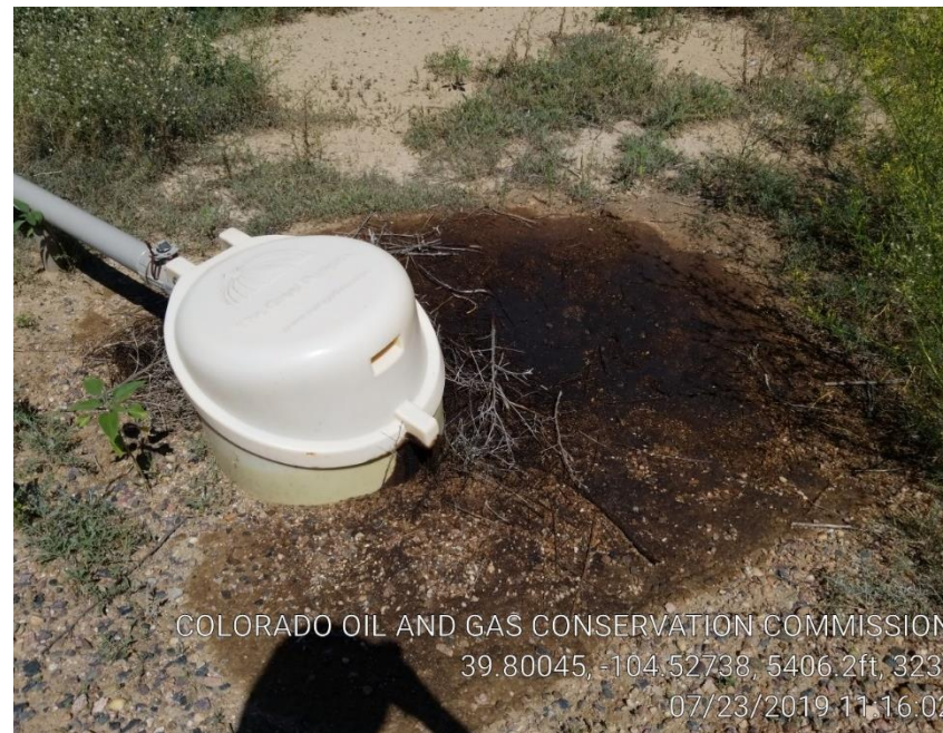
Pic 8 spill/possible leak