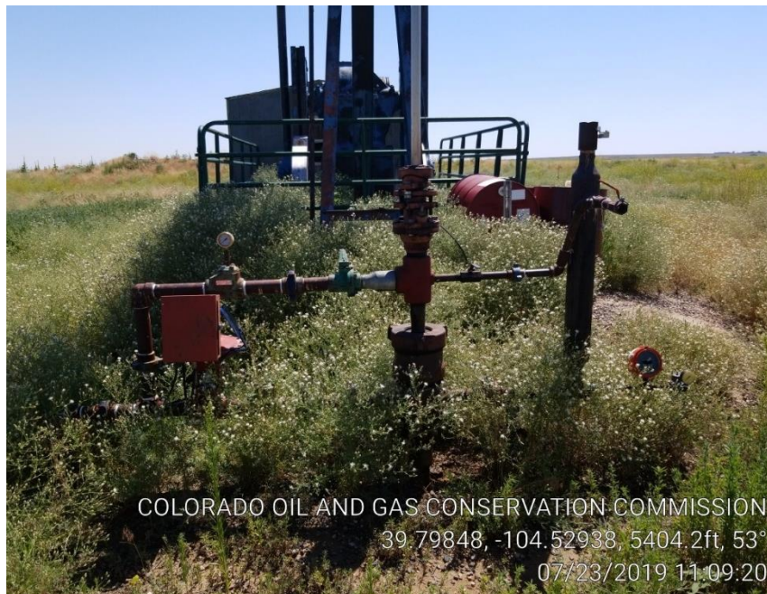
Pic 3 wellhead