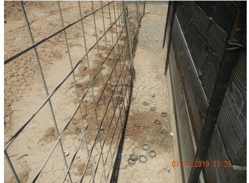
Seals laying behind separators.