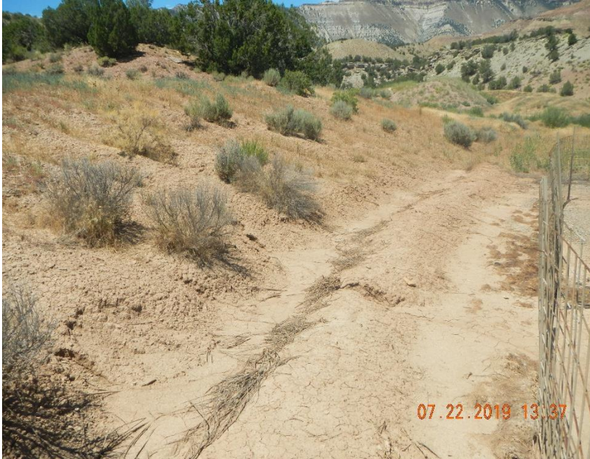
Sediment build up in ditch and wash out of ditch wall.