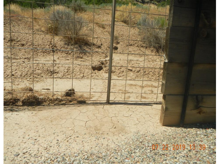
Wash out of ditch wall.