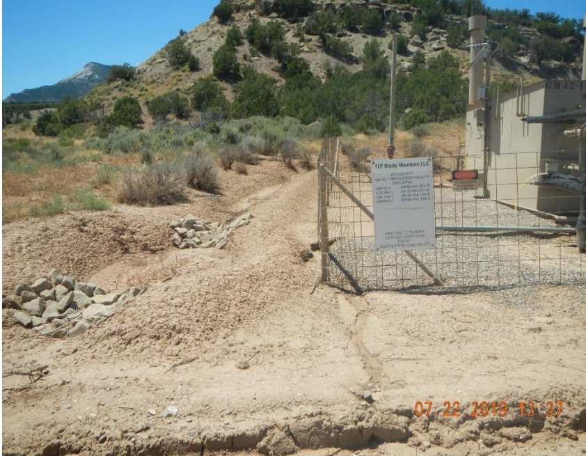
Erosion along outside of checkdam.