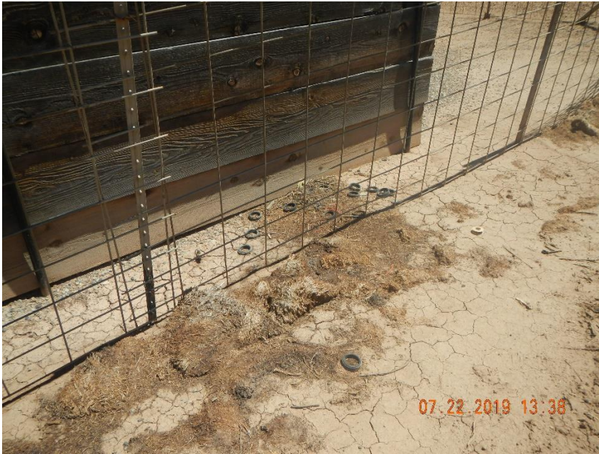
Seals laying behind separators.