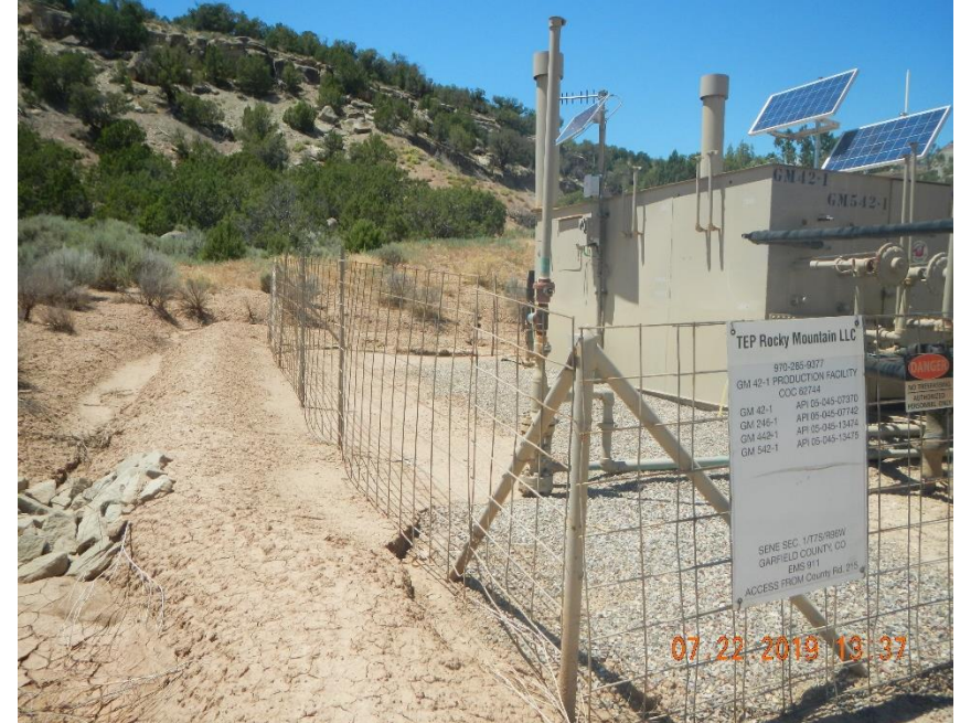
Flow path from washed out ditch wall.