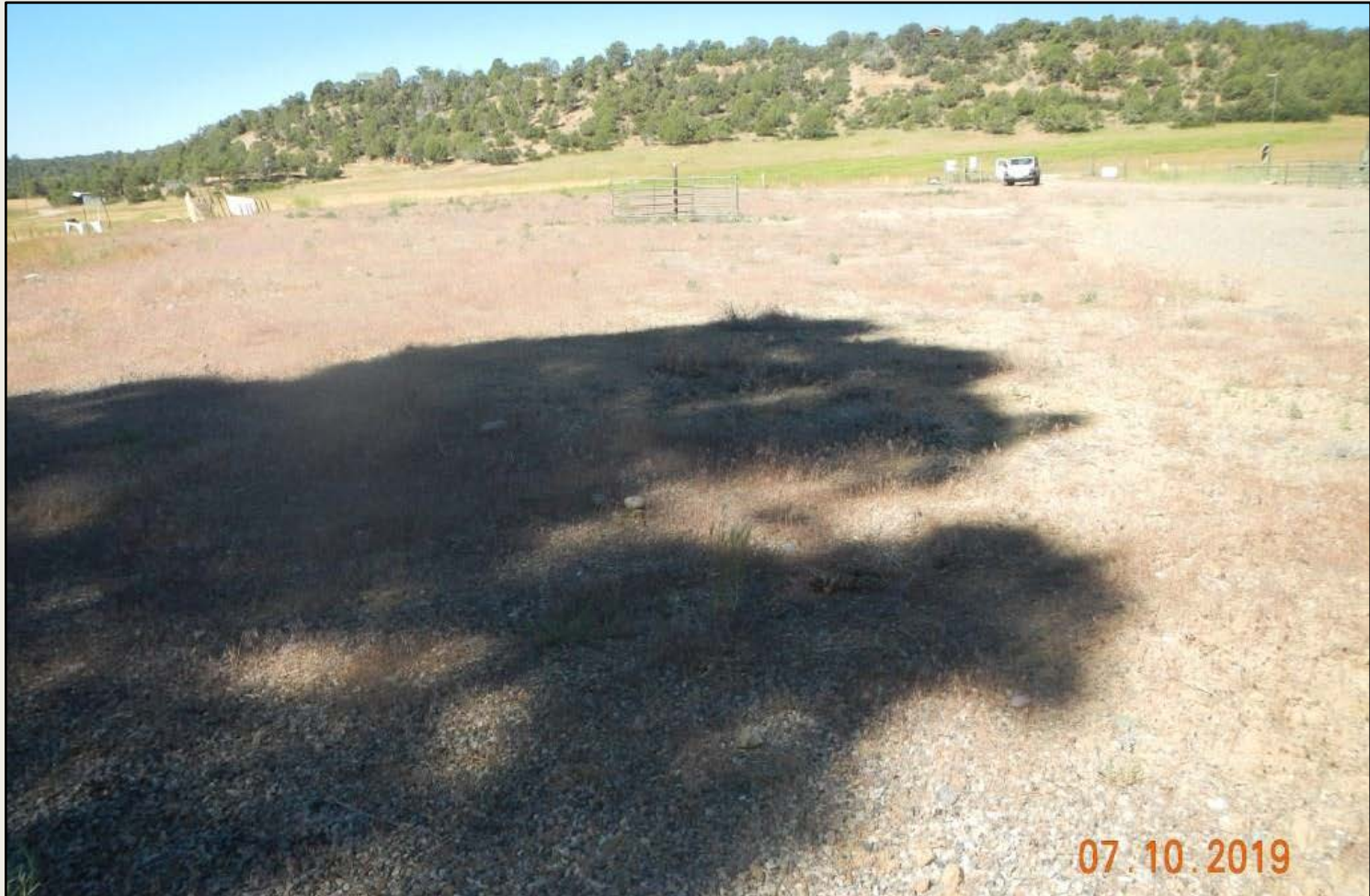
Photo 3. View of the southern project area from the southeastern corner facing westward.