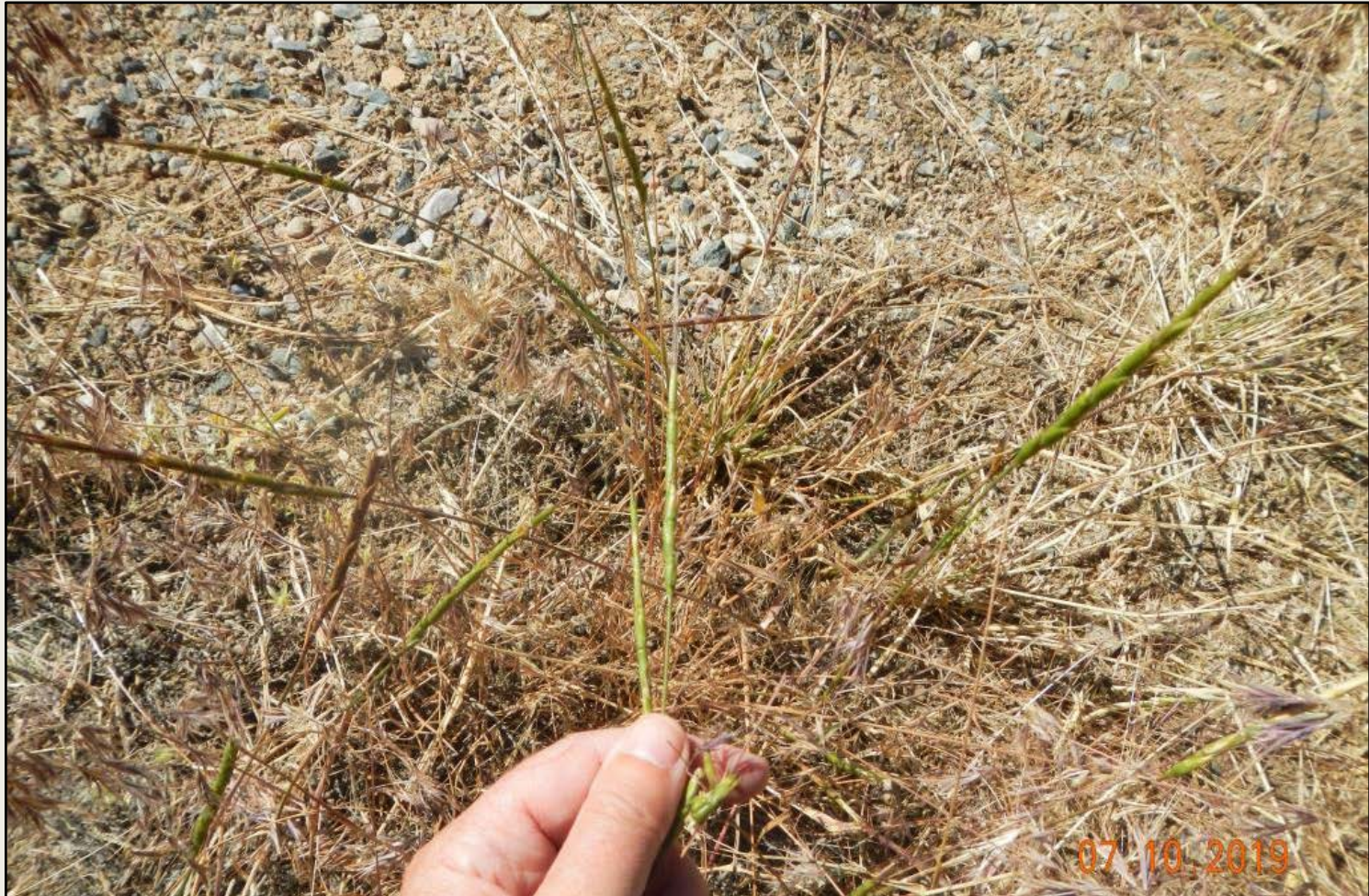
Photo 5. View of jointed goatgrass ( Acroptilon repens ) growing within the southwestern portion of the project area.