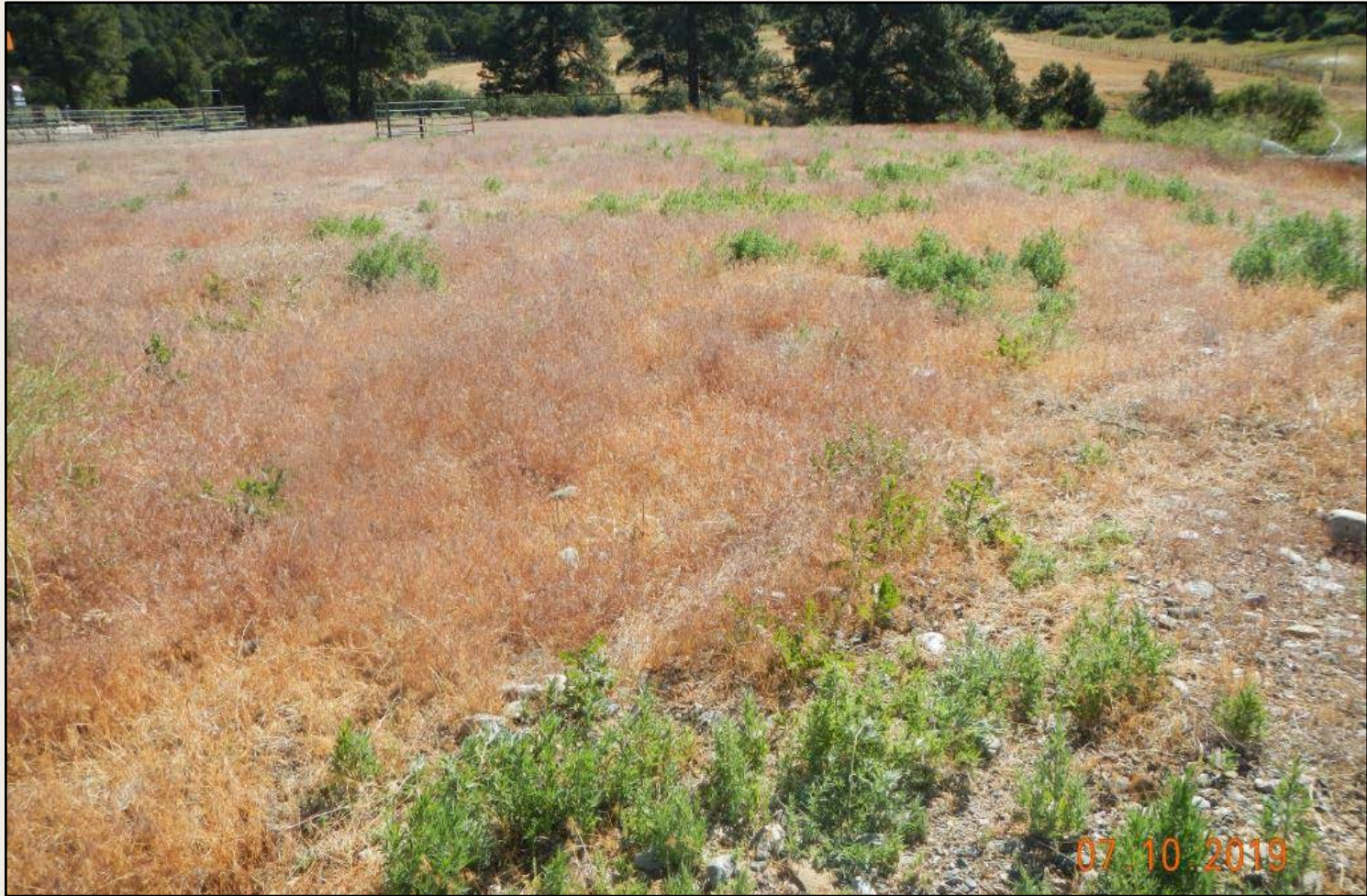
Photo 2. View of the southern project area from the southwestern edge facing eastward. Vegetation is largely weeds such as cheatgrass ( Bromus tectorum ) and kochia ( Kochia scoparia ).