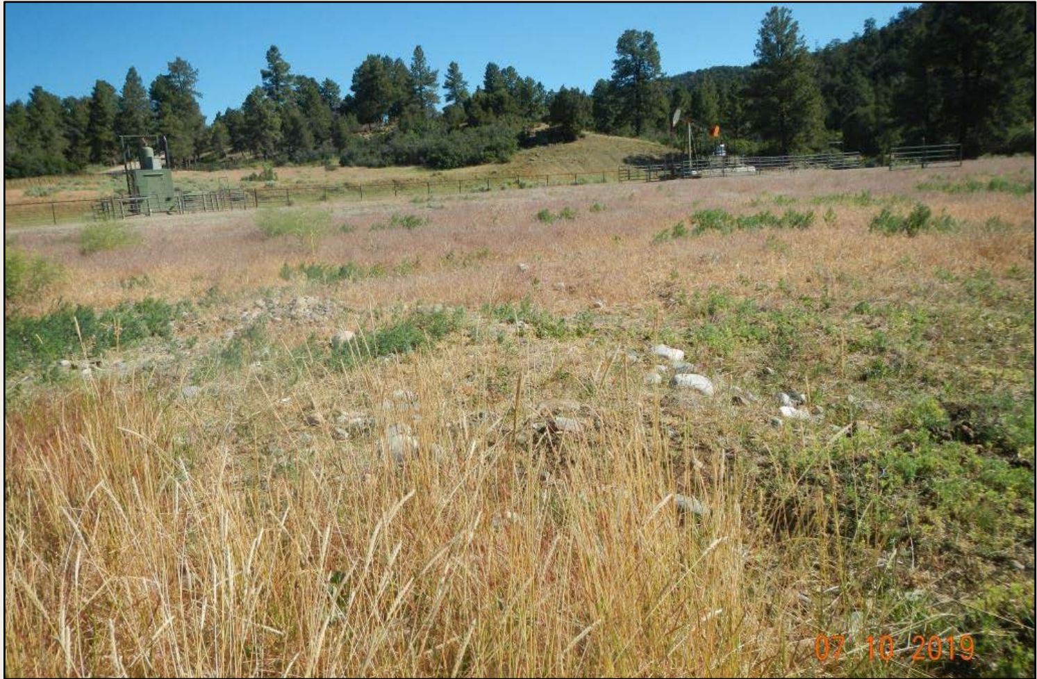
Photo 1. View of the project area from the southwestern corner facing center.