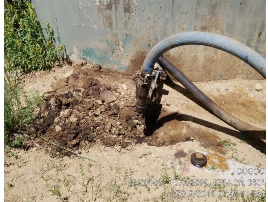
Photo 7. Tank valve with hose.