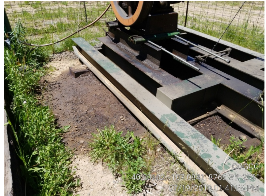
Photo 13. Ground next to pump jack motor.