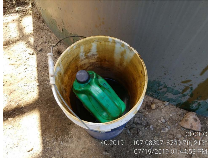
Photo 11. Container with oil next to tank.