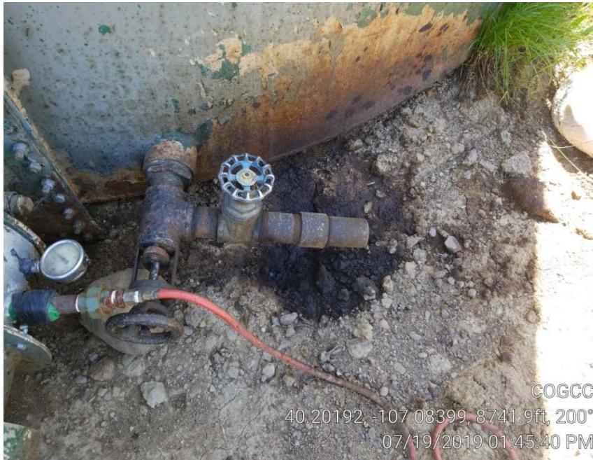
Photo 8. Tank valve.