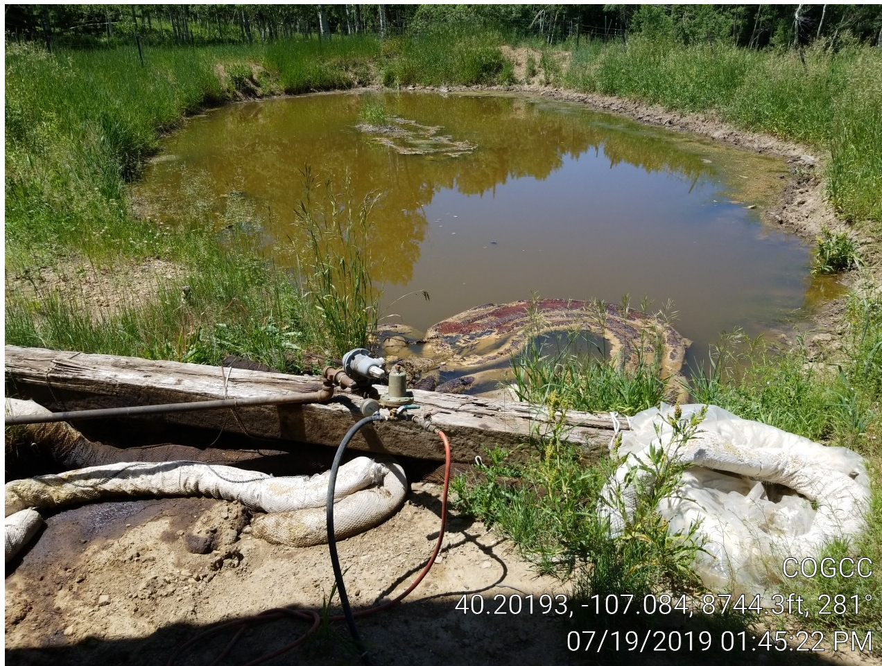
Photo 2. Pit adjacent to tanks.

Pinnacle Unit 10-30 API: 05-103-08459 Inspection: 679704804