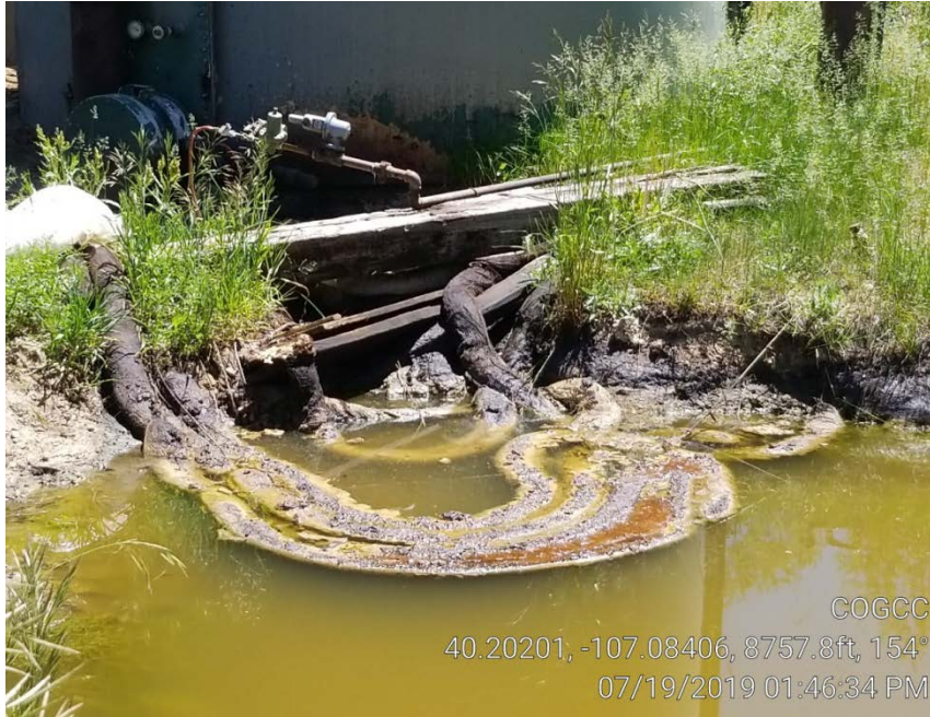
Photo 6. Oil saturated booms.