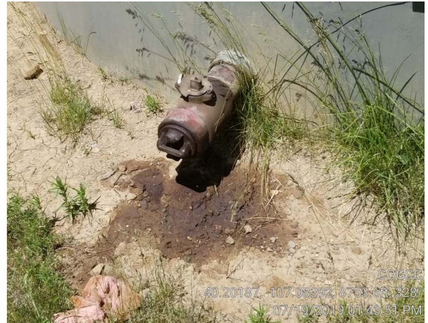
Photo 9. Tank valve.