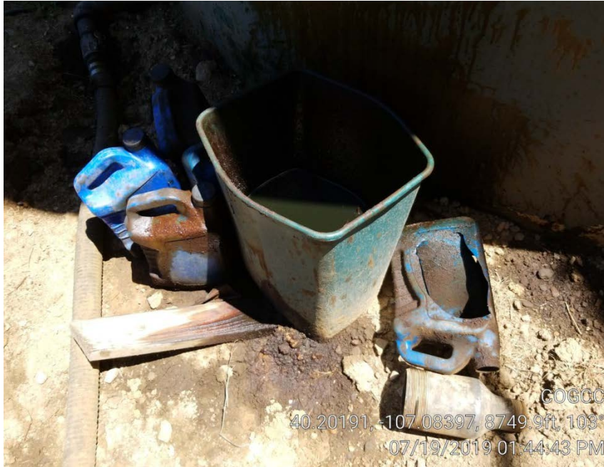
Photo 10. Containers with oil next to tank.