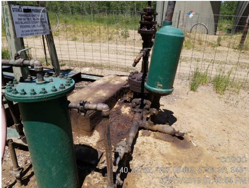
Photo 12. Well head