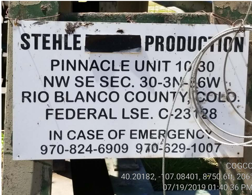
Photo 4. Sign at pump jack.

Pinnacle Unit 10-30 API: 05-103-08459 Inspection: 679704804