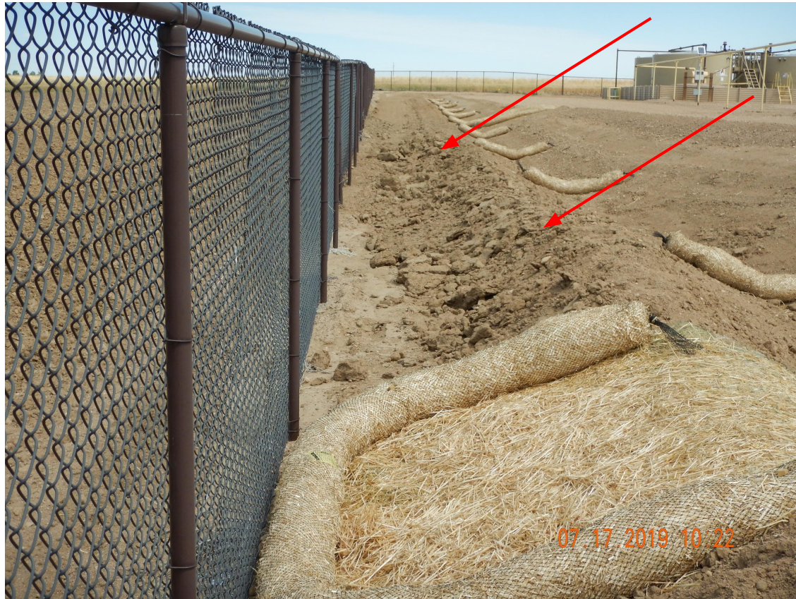
Photo 4. Photo taken from the southwestern location, facing North. Photo illustrates the Operator has not installed the berm BMP per good engineering practices. The berm BMP is unconsolidated and not stabilized. Also, the spillway material installed is not intended as a long-term stormwater BMP, only temporary. Operator was required to install long-term stormwater BMPs.