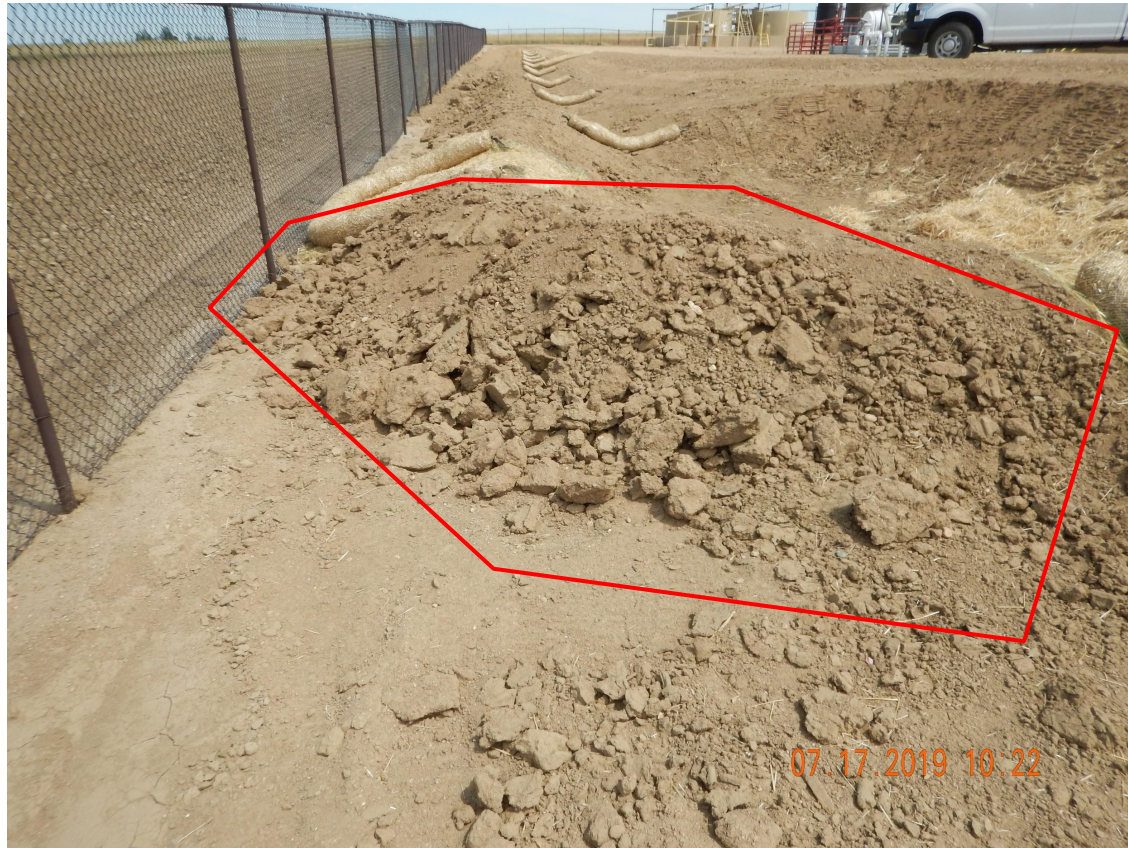
Photo 3. Photo taken of the southern sediment trap, facing North. Photo illustrates the Operator has not installed the sediment trap per good engineering practices. The embankment berm is unconsolidated and not stabilized.