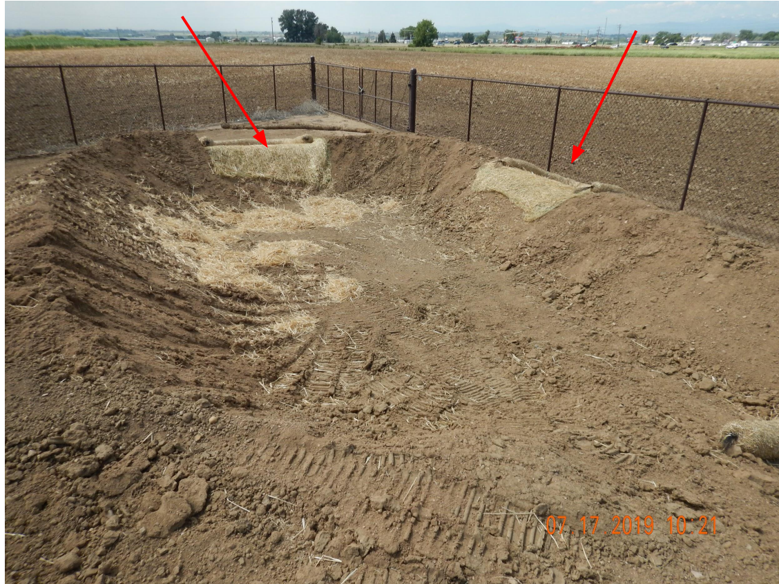
Photo 5. Photo taken from the southwestern location, facing South. Photo illustrates the spillway material used is not intended as a long-term stormwater BMP, only temporary. Operator was required to install long-term stormwater BMPs.