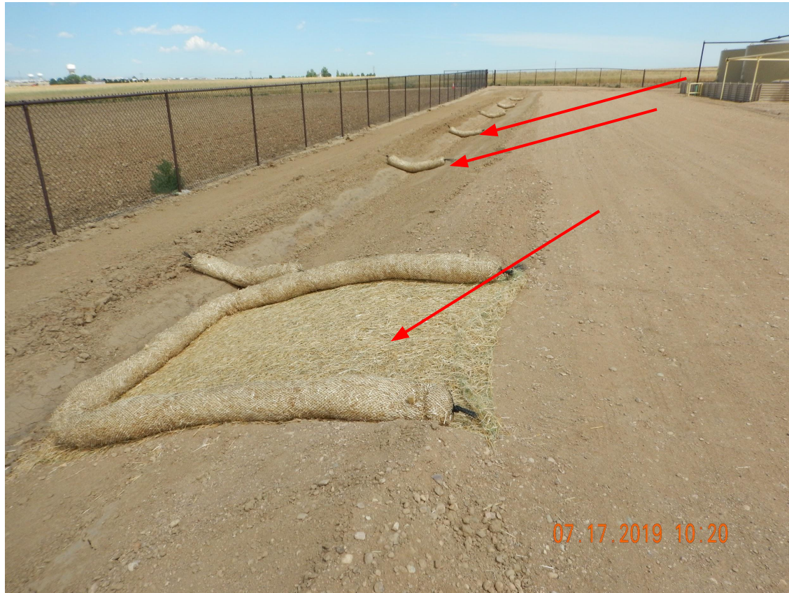
Photo 2. Photo taken from the western location, facing North. See comments under Photo 1. In addition, the type of erosion control blanket and wattles are not intended as a long-term stormwater BMP, only temporary. Operator was required to install long-term stormwater BMPs.