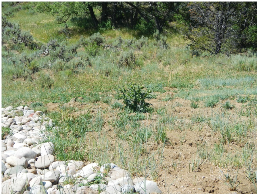
Noxious weed on interim rec area