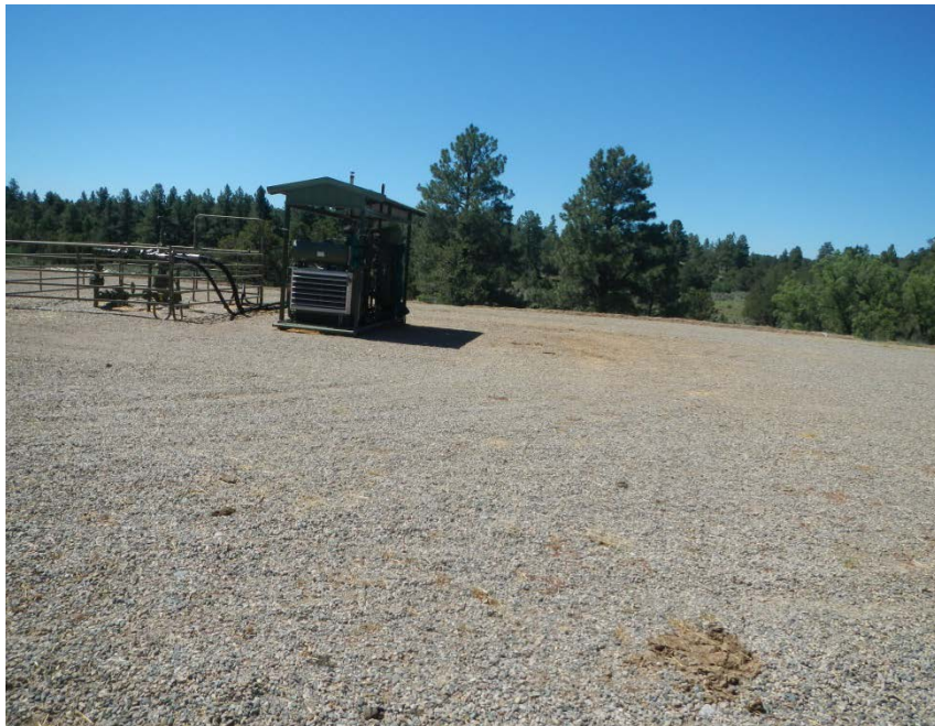
Wellhead and compressor