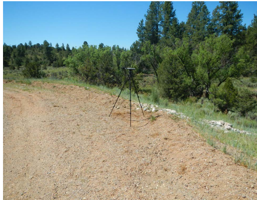
Sound meter 100' from compressor in direction of complaint