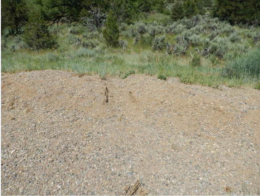
Erosion on west side of location