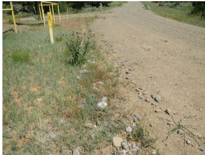
Noxious weed on edge of access road