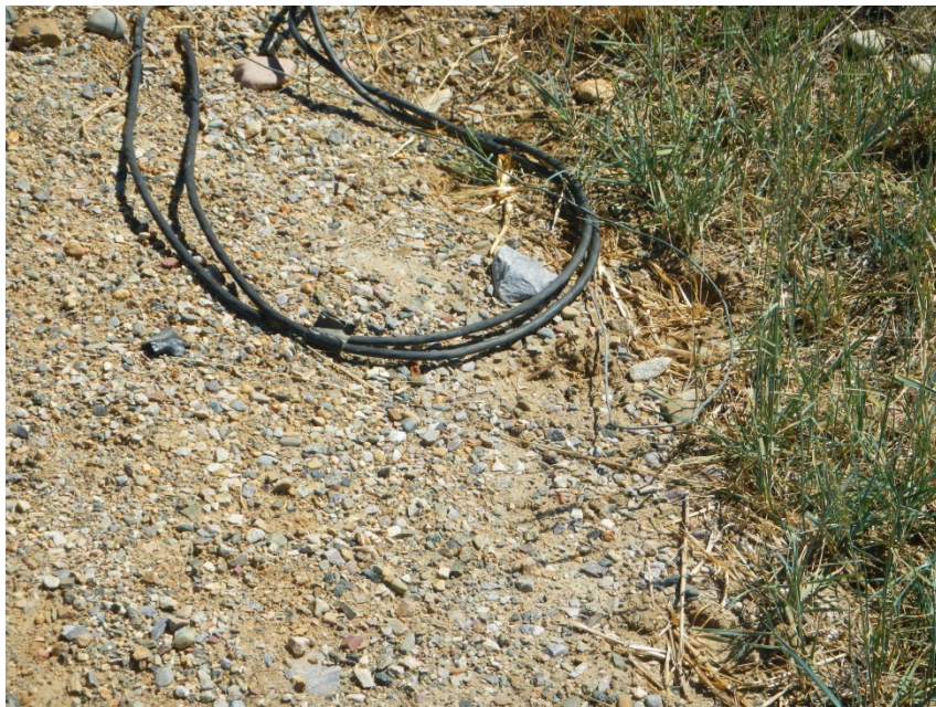
Loose unused insulated wire east side of location