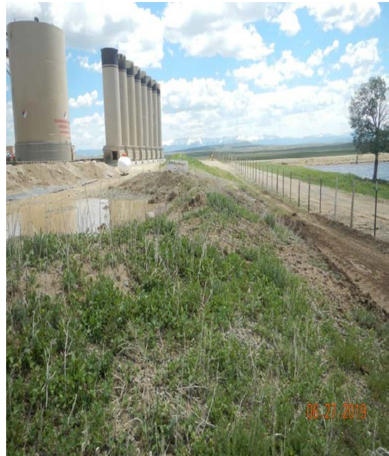
Photo#16: Berms are weedy & would benefit from Interim Reclamation.