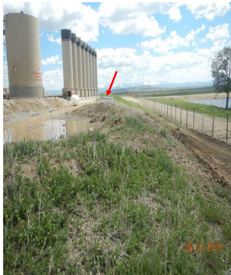
Photo#14: Stormwater ponding shown in Photo #13, weir(Photo#11) position indicated with arrow.