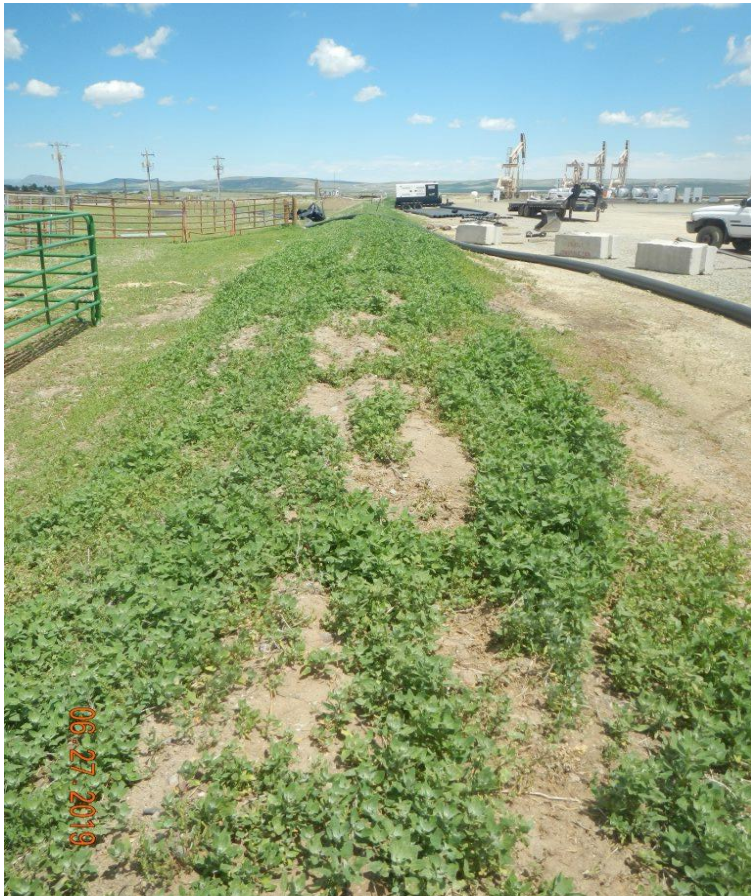
Photo#15: Berms are weedy & would benefit from Interim Reclamation.