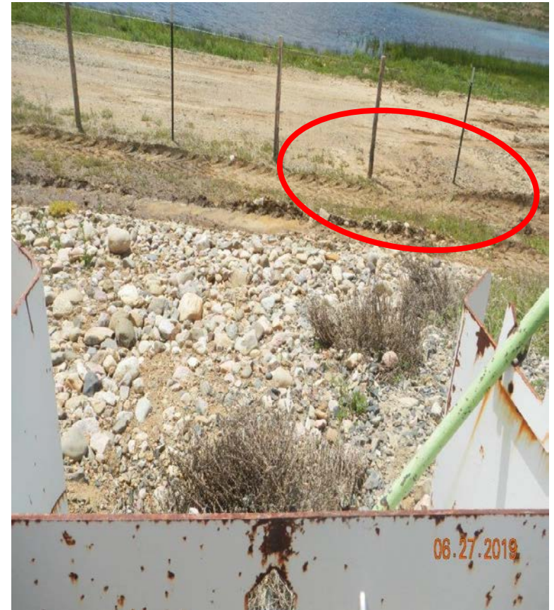
Photo#12: View to discharge area of South weir. Note no perimeter control, sediment run-off.