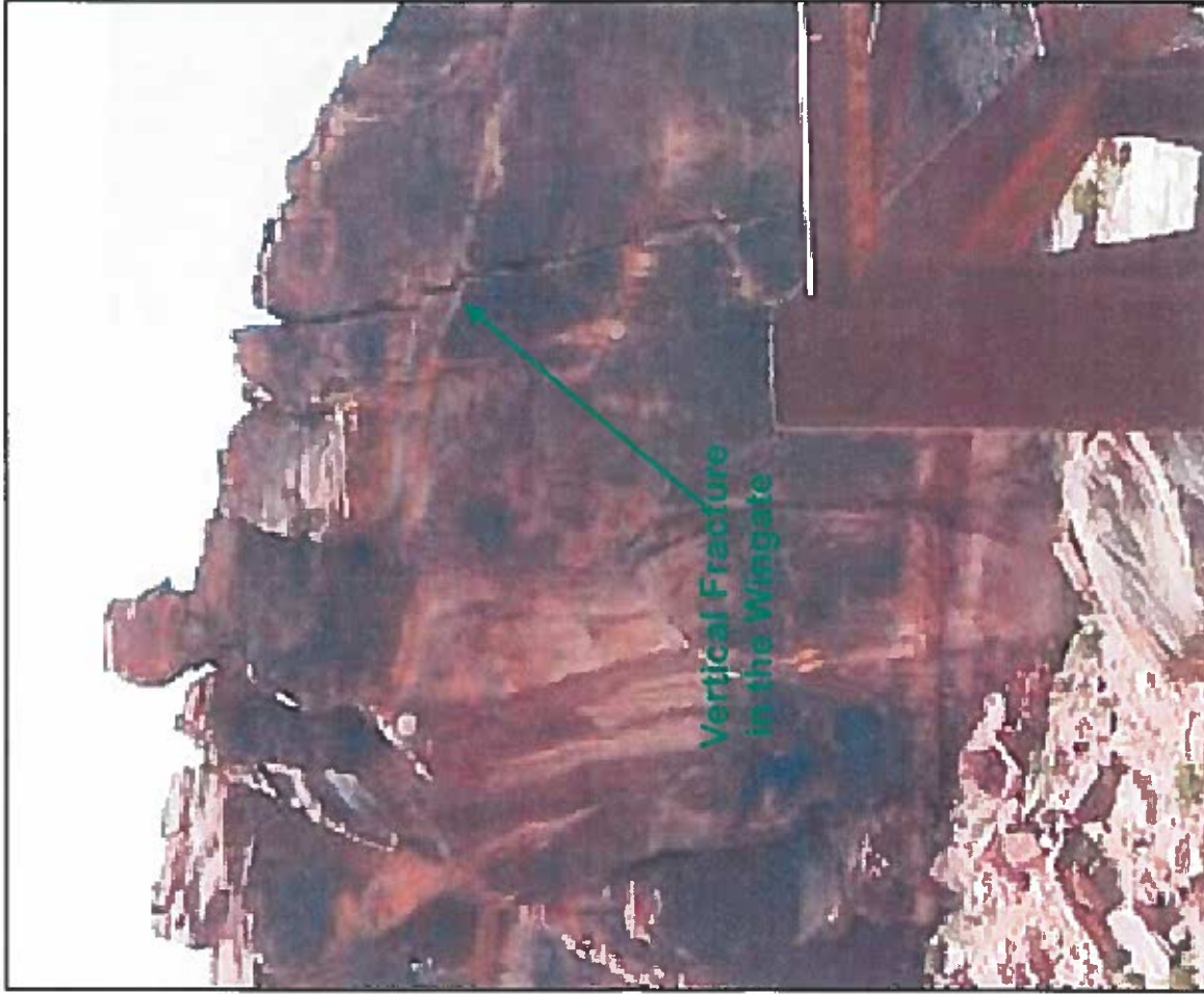
Figure 2a. Wingate Sandstone Outcrop Adjacent to the Gunnison River Near Bridgeport