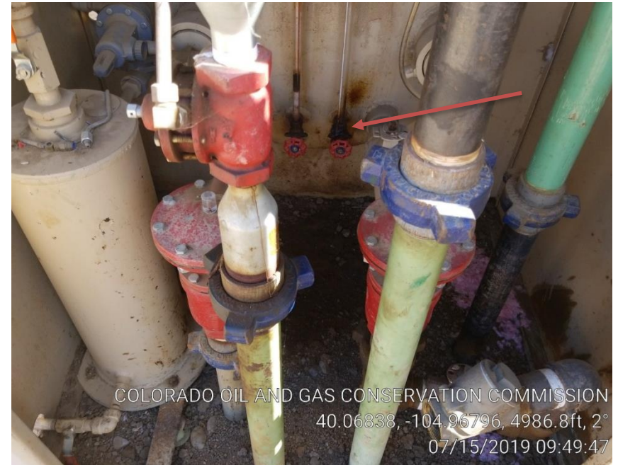
Pic 11 stained soil in separator house/possible leak