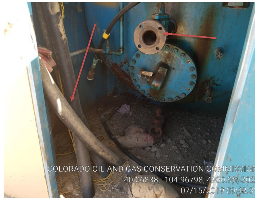
Pic 9 stained soil and open fitting on separator house/trash in separator house