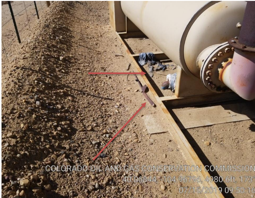
Pic 11 trash under separator