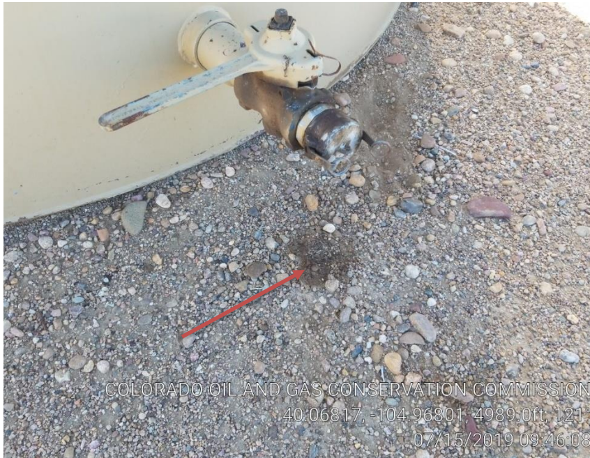
Pic 6 stained soil under load line