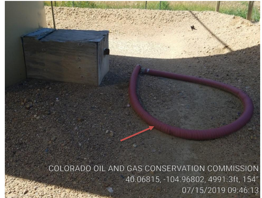
Pic 7 unused hose near tank battery.