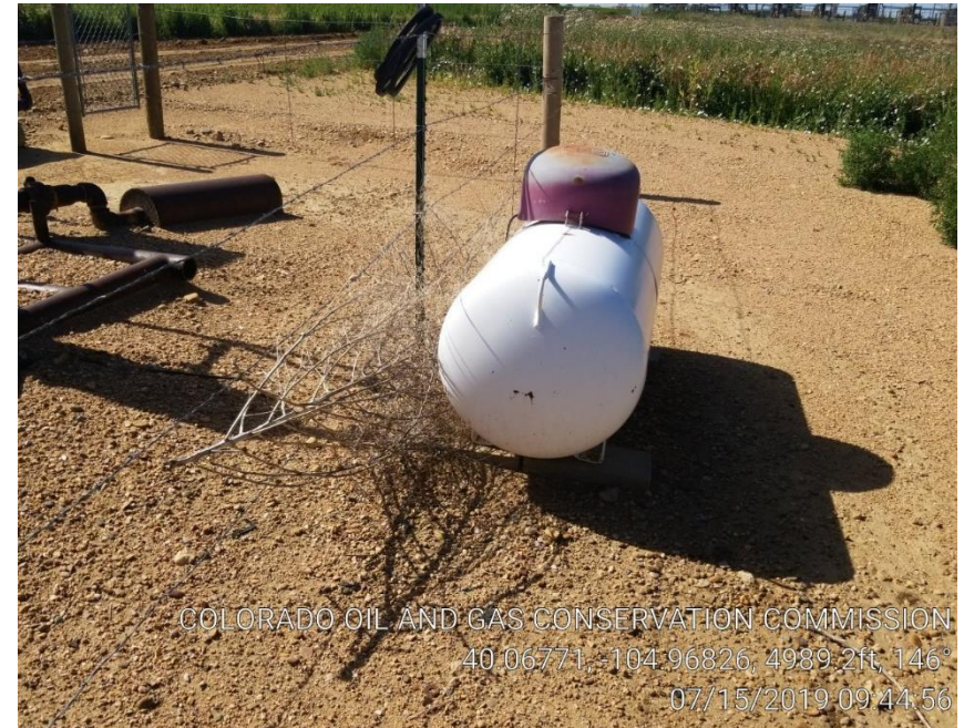
Pic 5 unused propane tank/closed