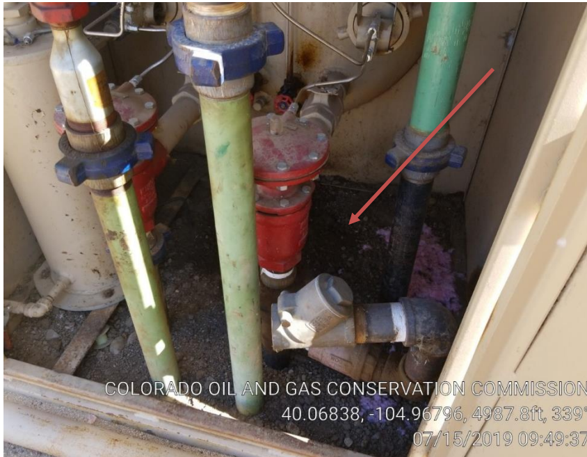
Pic 10 stained soil in separator house, possible leak