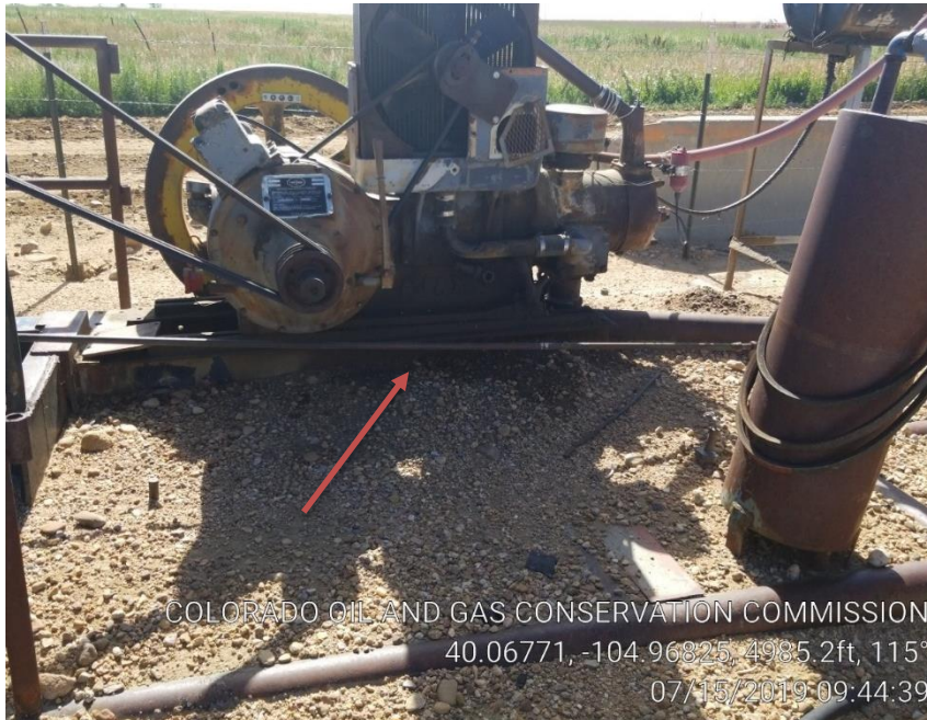
Pic 4 stained soil