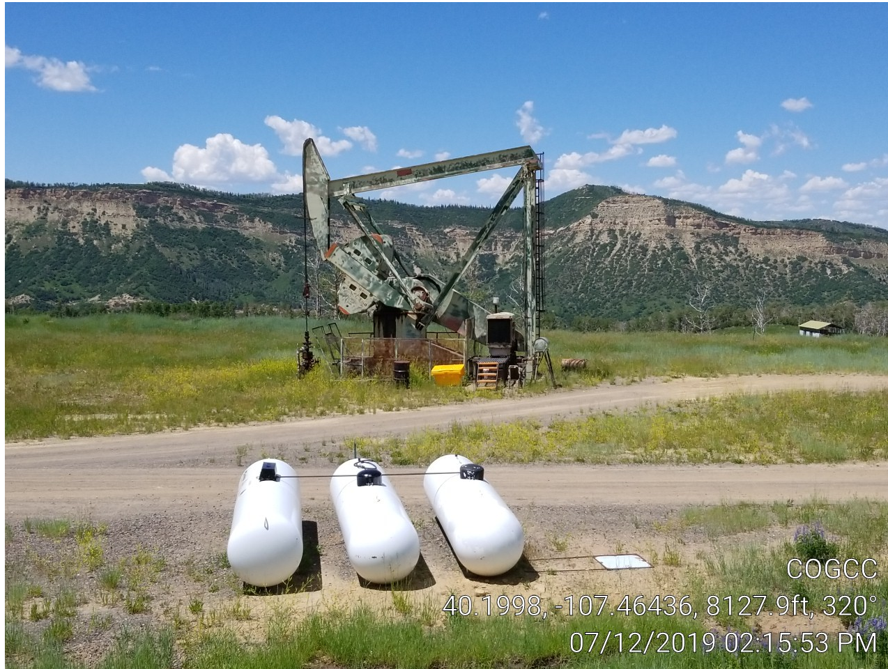
Photo 1. Pump jack & propane tanks.