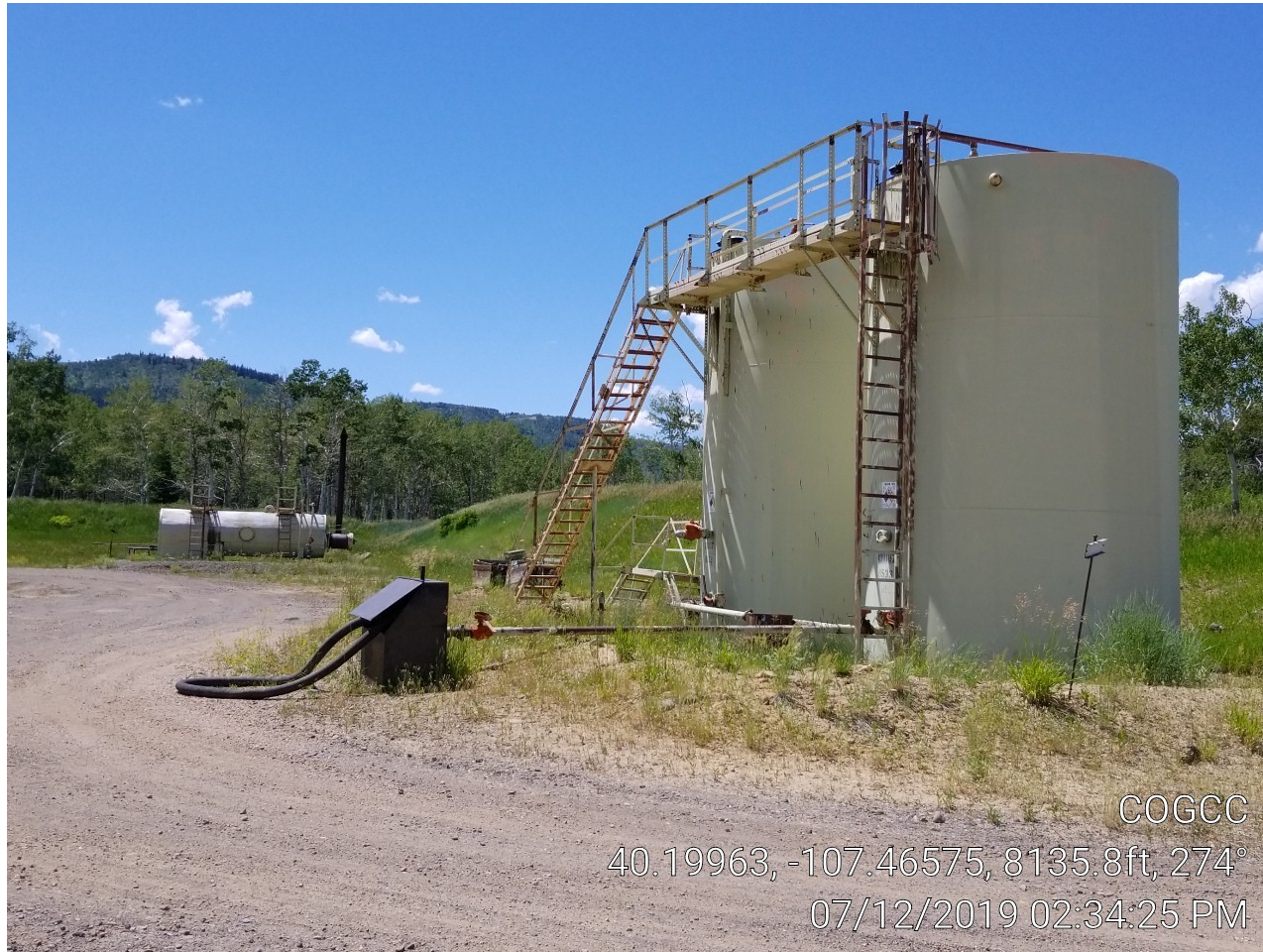
Photo 2. Tank battery & treater.