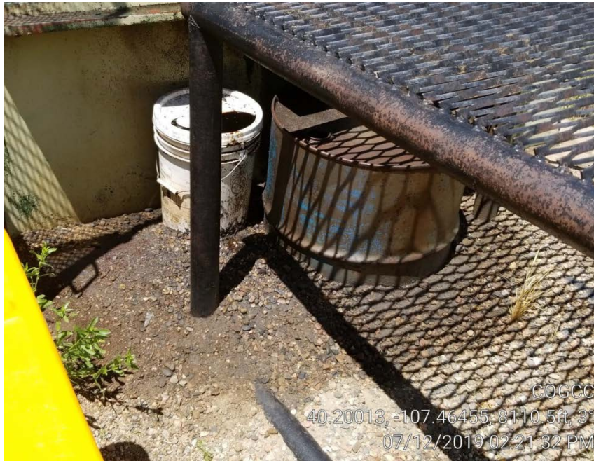
Photo 8. Stained soil.