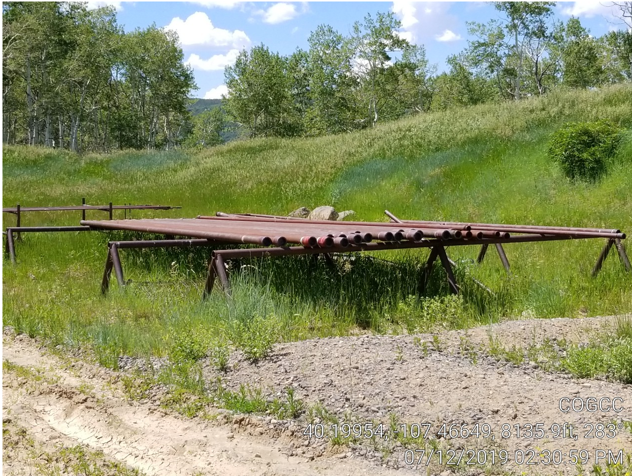
Photo 3. Tubing.