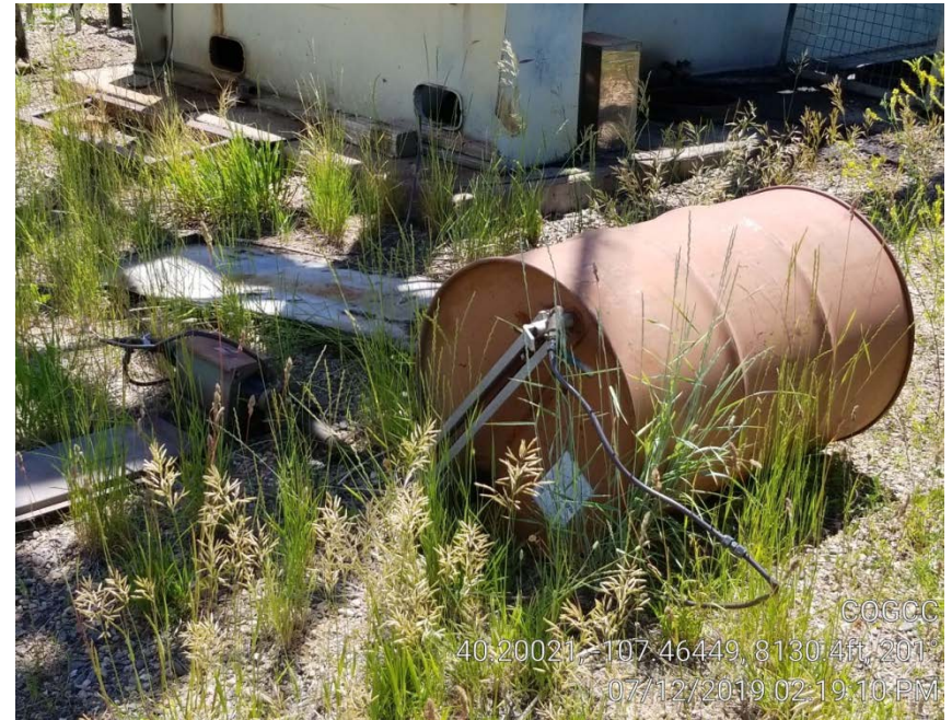
Photo 9. Barrel.