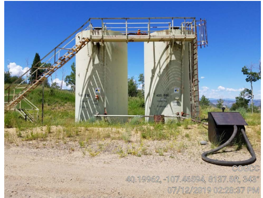
Photo 5. Tank battery.