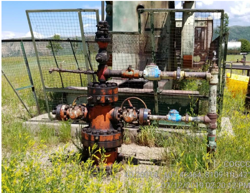
Photo 4. Well head.