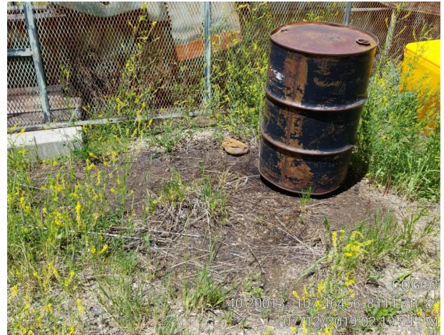
Photo 7. Stained soil and barrel.