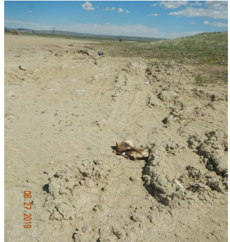
Photo#7: Sediment run-on, degradation of site still occurring behind equipment in Southeast corner.