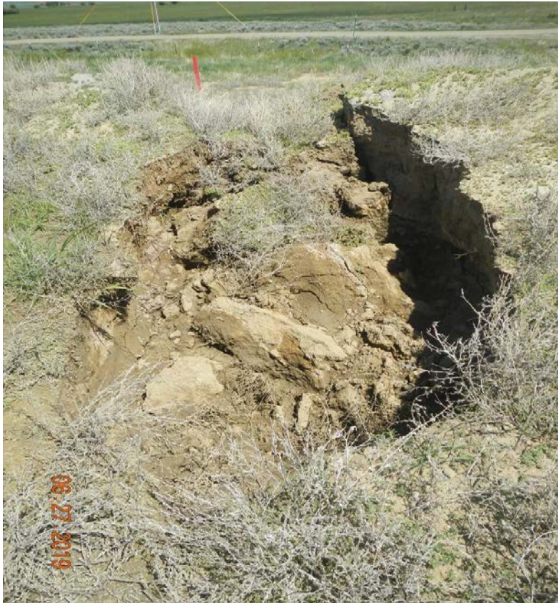
Photo#9: Washout at Northeast corner of fill slope; from top of slope.