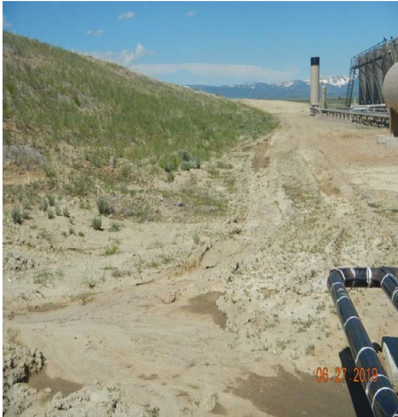
Photo#6: Sediment run-on, degradation of site still occurring behind equipment in Southeast corner.