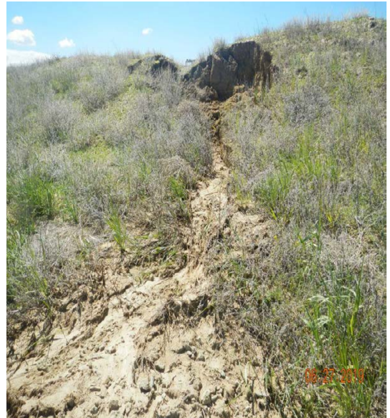
Photo#10: Washout at Northeast corner of fill slope; from base of slope to top.