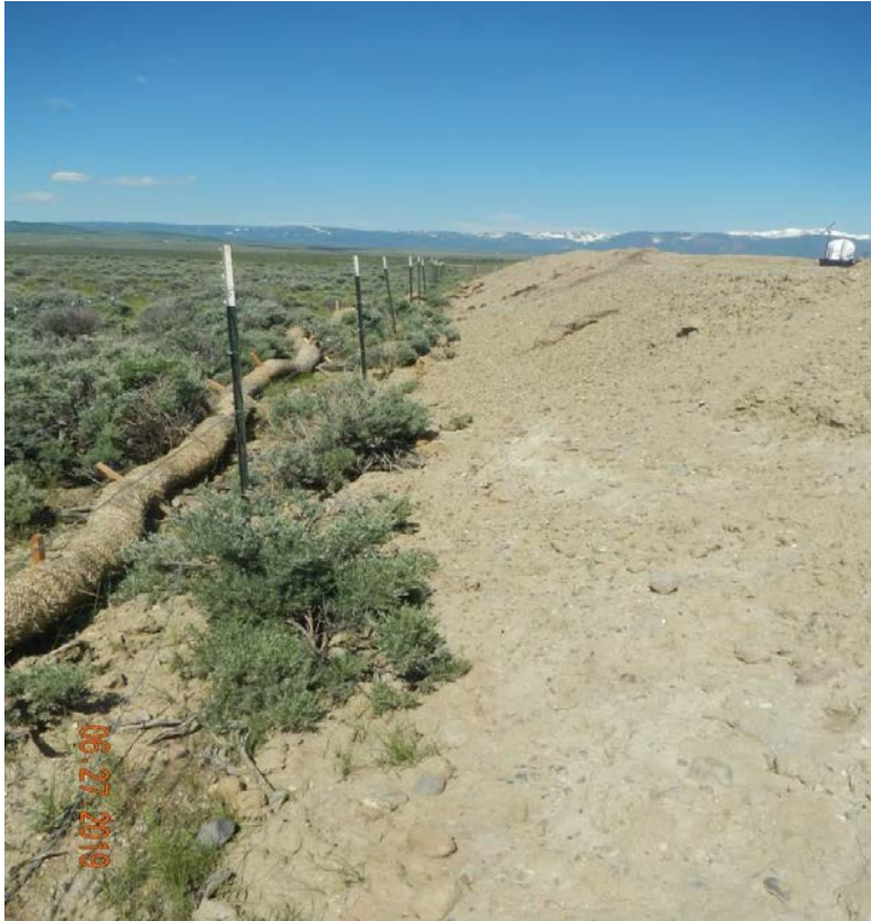
Photo#12: Wattles installed on perimeter of new construction need maintenance.