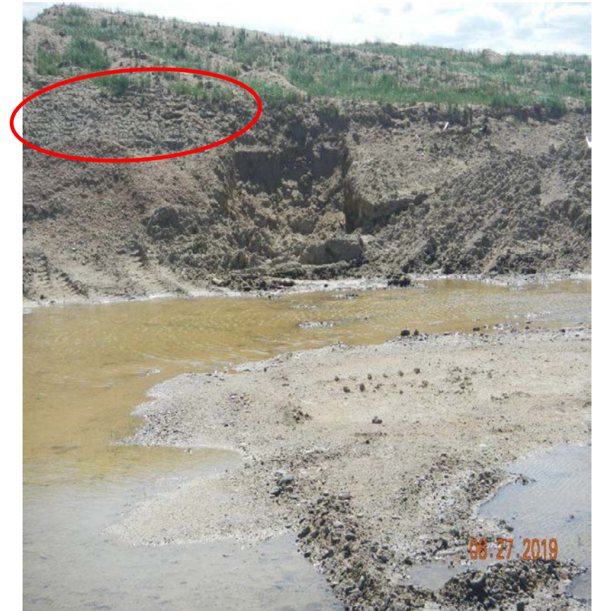
Photo#3: Excavation area in cut slope. Oval shows unknown material in photo#2.