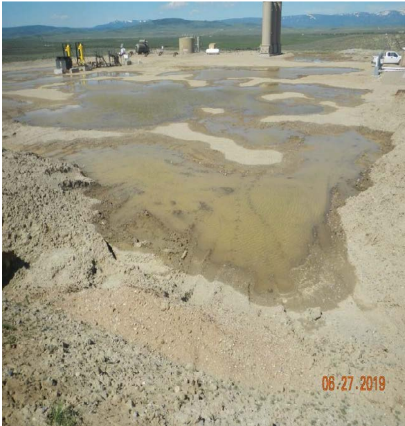
Photo#4: Ponding stormwater inundating unknown material (cuttings?).