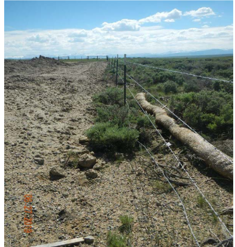
Photo#13: Wattles installed on perimeter of new construction need maintenance.