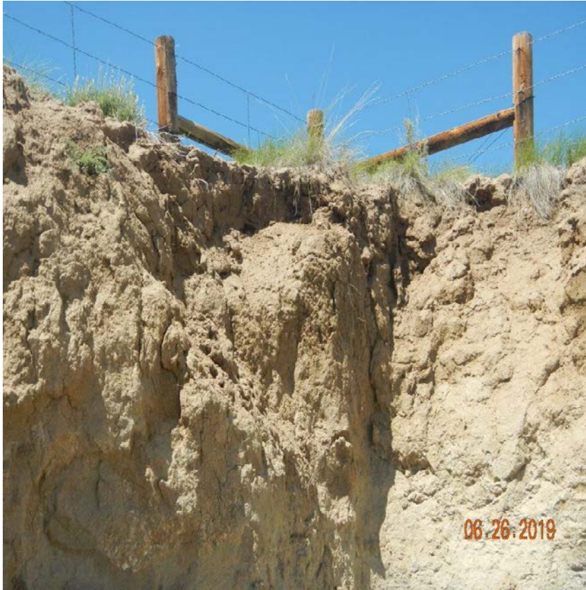
Photo#12: Cut at Southwest corner of site; sloughing/erosion evident.