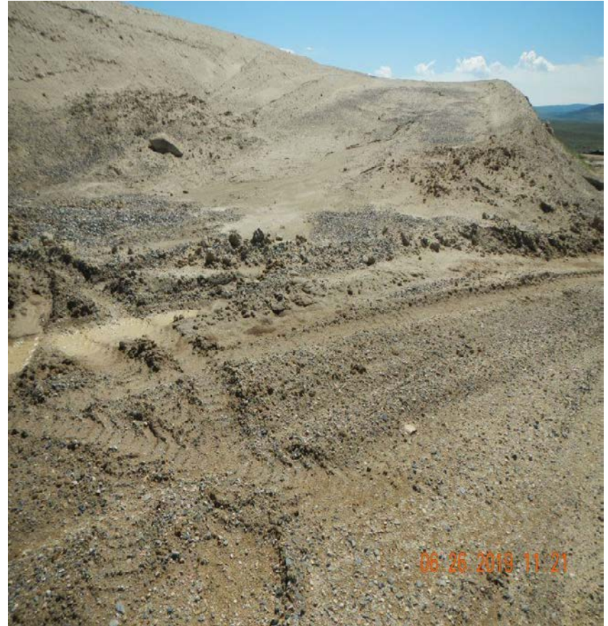
Photo#11: South or Location side of stockpile, no BMPs; run-on and degradation occurring.