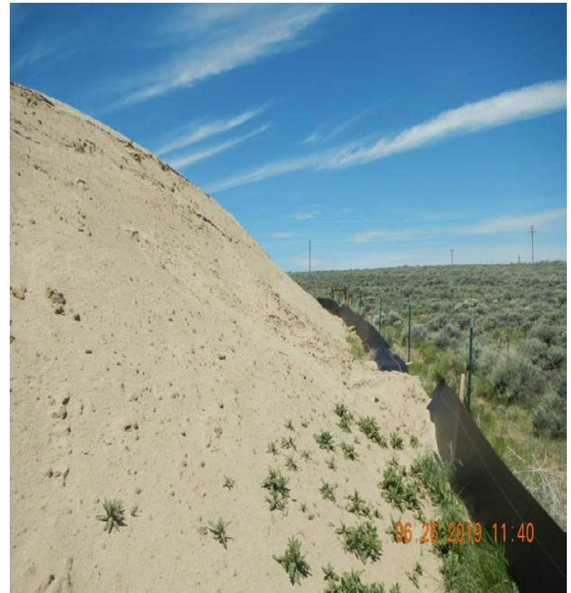
Photo#9: Point along base of stockpile where silt fence has Failed.