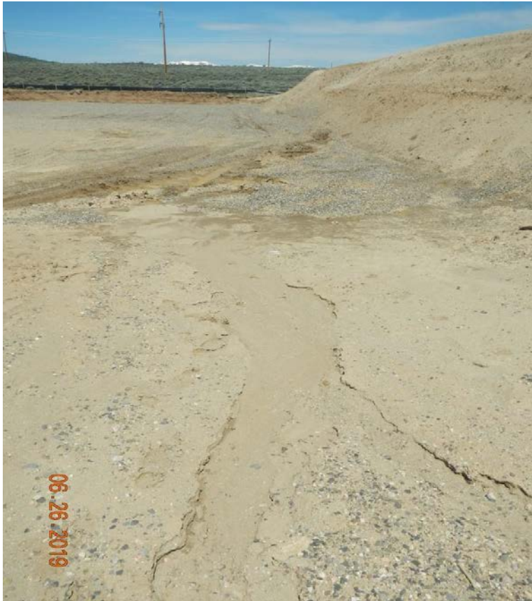
Photo#10: South or Location side of stockpile, no BMPs; run-on and degradation occurring.