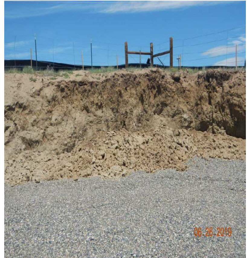
Photo#13: Cut at Southwest corner of site; sloughing/erosion evident.