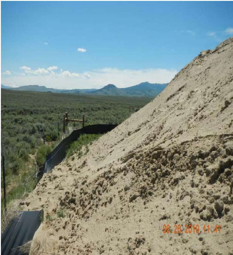
Photo#8: Point along base of stockpile where silt fence has Failed.