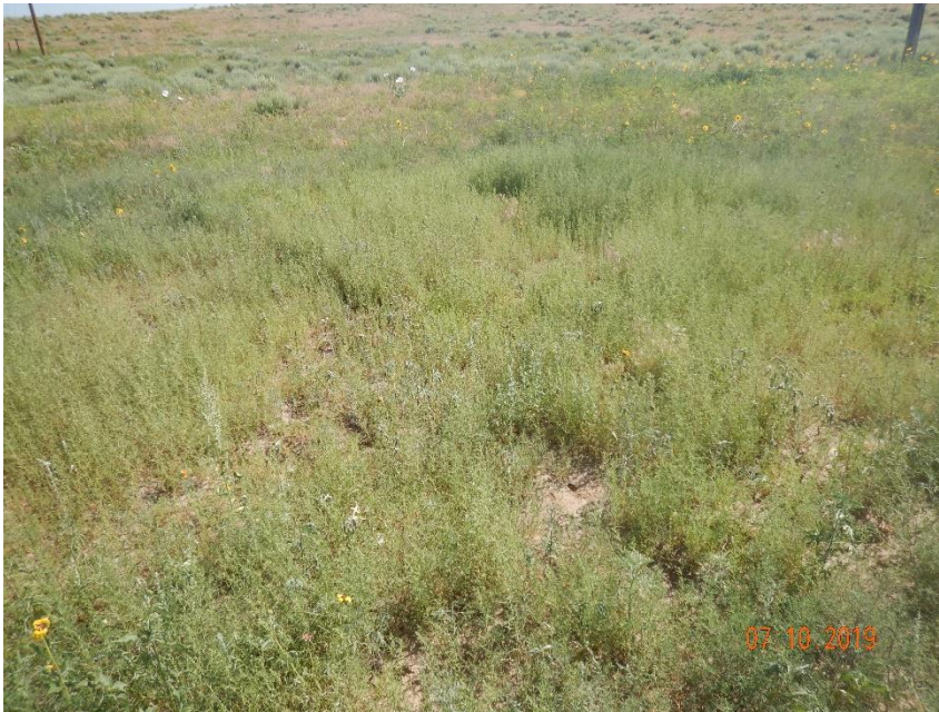
Photo 5: Photo taken from the well location. Photo shows location remains predominantly bare and exposed soil, or undesirable weedy plant species. Plants observed in photo predominantly Kochia/Russian thistle.