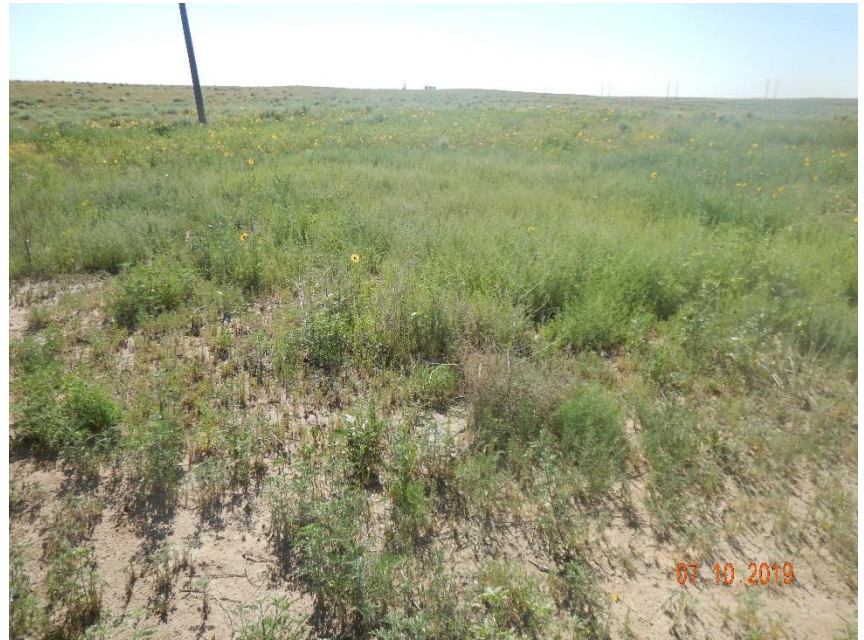
Photo 6: Photo taken from the well location. Photo shows location remains predominantly bare and exposed soil, or undesirable weedy plant species. Plants observed in photo predominantly Kochia/Russian thistle.