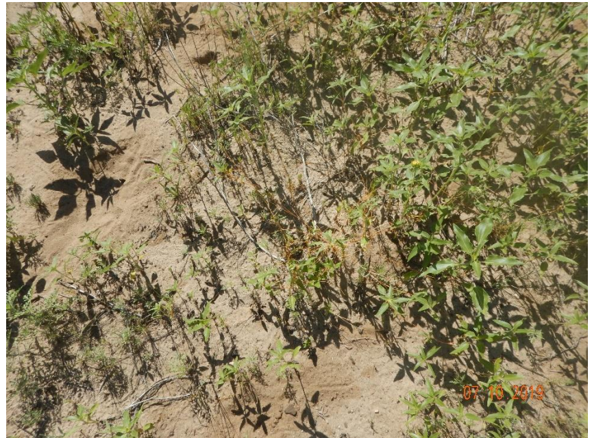
Photo 4: Photo taken from the well location. Photo shows location remains predominantly bare and exposed soil, or undesirable weedy plant species.