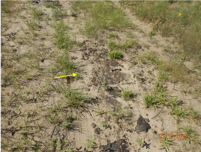
Photo 7: Photo taken from the access road. Photo shows stained soils.