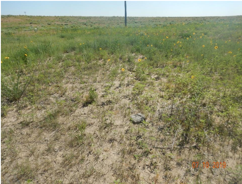
Photo 3: Photo taken from the well location, facing east. Photo shows well location remains predominantly bare and exposed soil, or composed of undesirable weedy plant species. Unable to find evidence that reclamation work has been conducted per corrective actions.