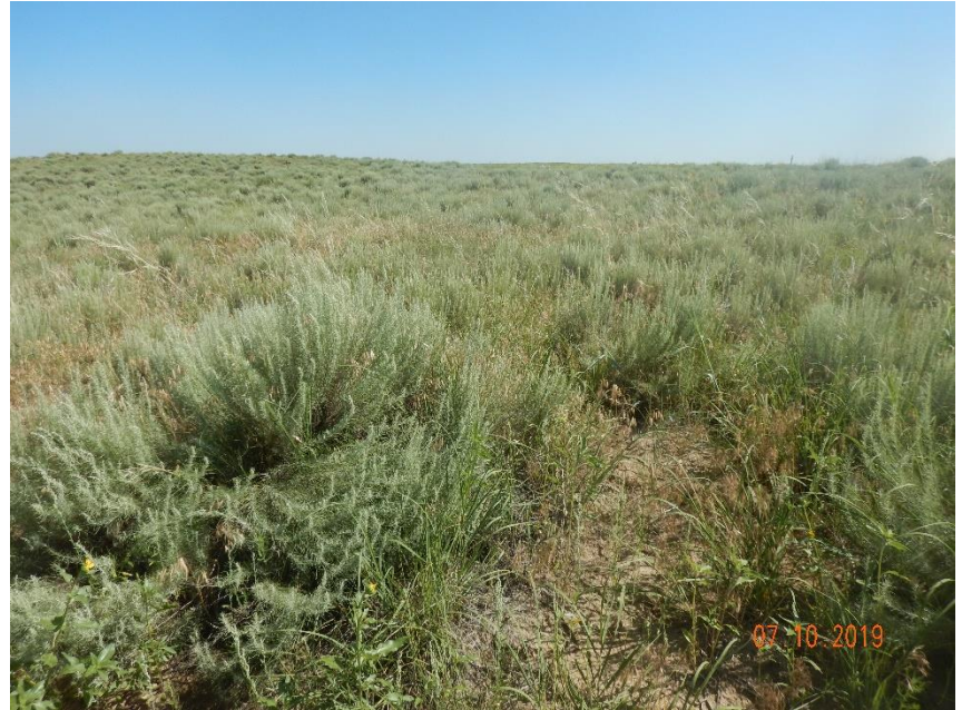
Photo 8: Photo taken from the adjacent reference area. Photo shows vegetation on reference to compare to vegetation on disturbance area.