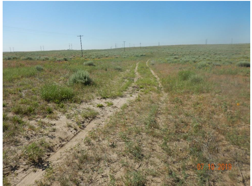
Photo 2: Photo taken from the location, facing south. Photo shows access road remains has not been reclaimed.