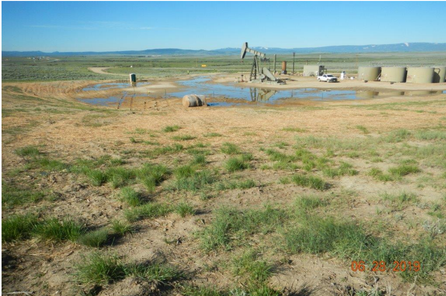
Photo#1: Overview of Location from top of cut slope to Southwest. Note ponding on pad and Interim Reclamation area.