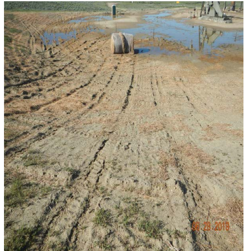
Photo#3: Newly installed Interim Reclamation; pooled water, round bales and heavy equipment impact.