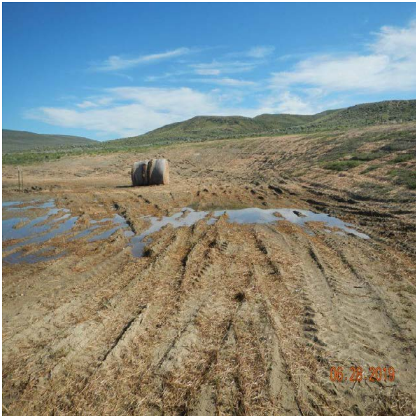
Photo#2: Newly installed Interim Reclamation; pooled water, round bales and heavy equipment impact.