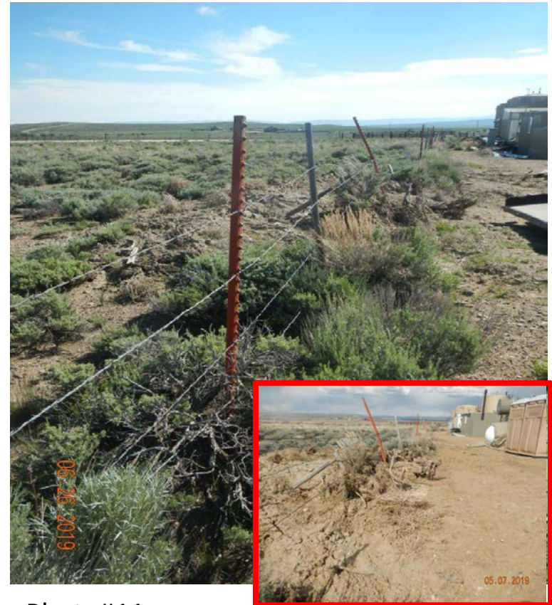
Photo#11: Stockpiles have no BMP; one pushed off Location. Inserts 5/7/19.