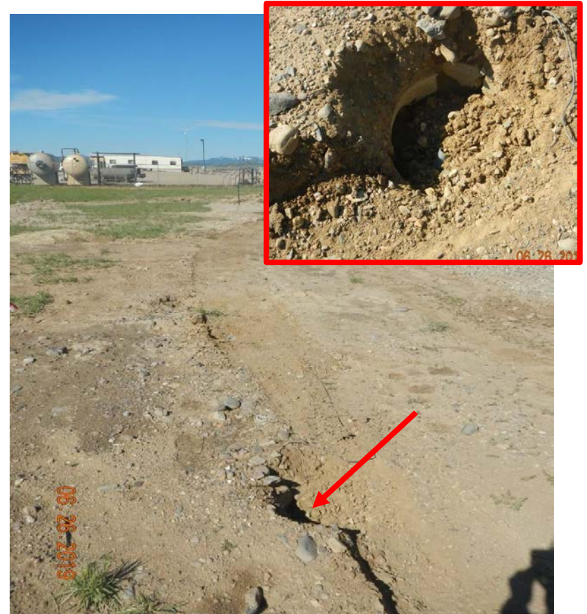
Photo#5: Showing results of lack of BMPs on Access Road. Insert is of unknown infrastructure run over by off road traffic.