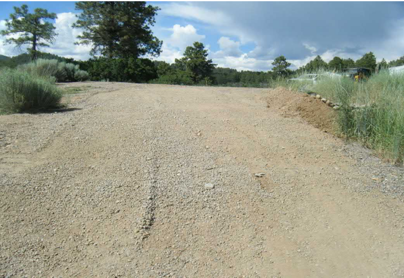
View of access road looking north.

Storm Water management controls have been established to stabilize erosion along western edge of access road. Check dams and diversions were installed to control water run off from location.