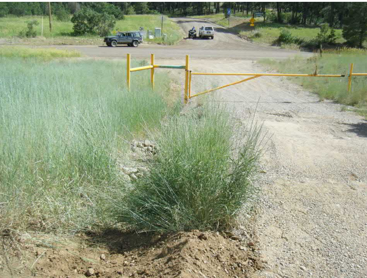
View of check dams and diversion looking south.