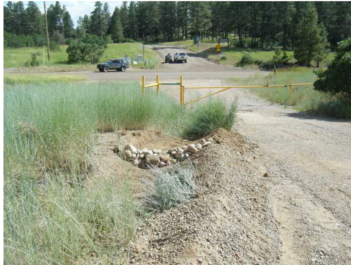
View of check dam and diversion looking south.