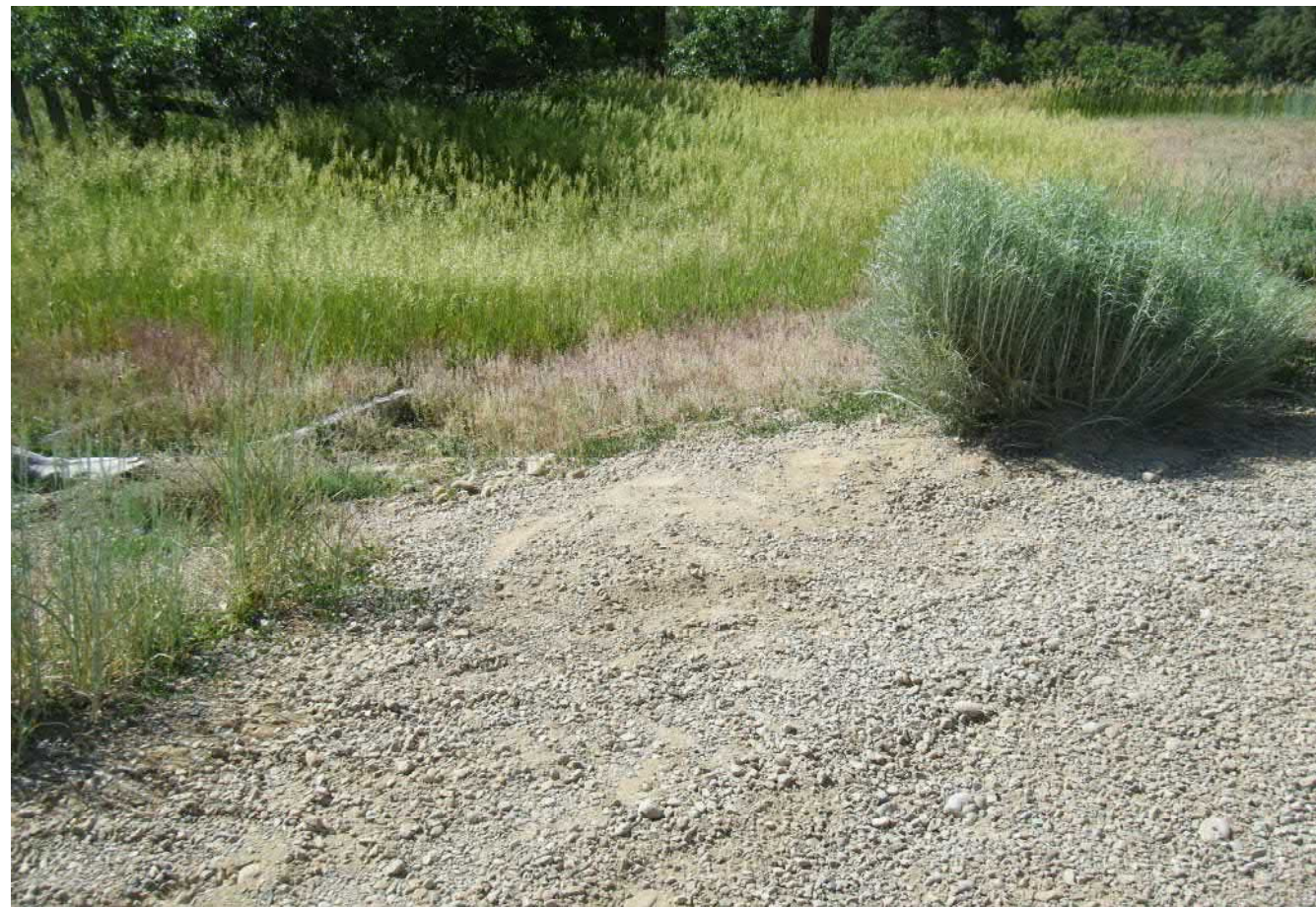
View of western edge of access road.