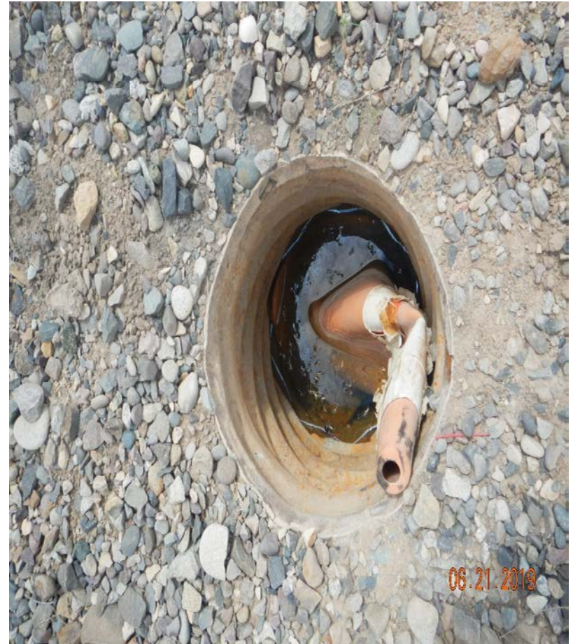
Photo#7: Open Rat Hole at Well API#077-09473.