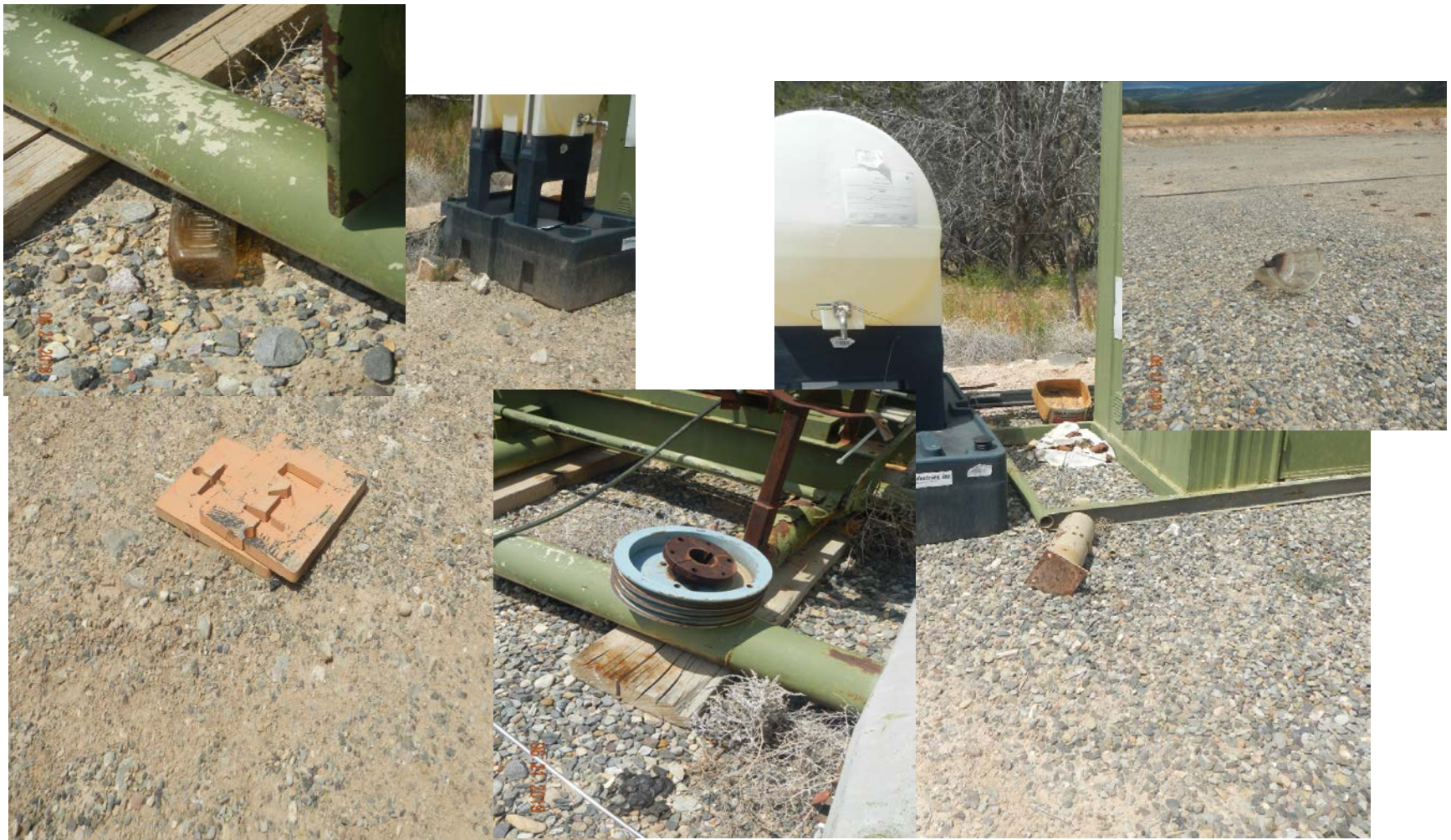
Photo#10: Various pieces of trash/debris are scattered across Location.