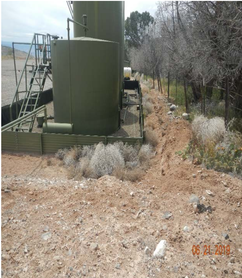
Photo#8: Weeds that have become Debris have blown in & around equipment.