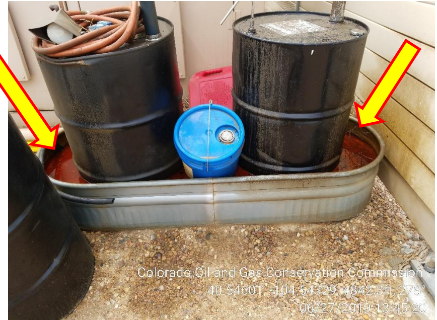
Photo 4 – Secondary containment at Hydraulic Power Unit has non-E & P waste