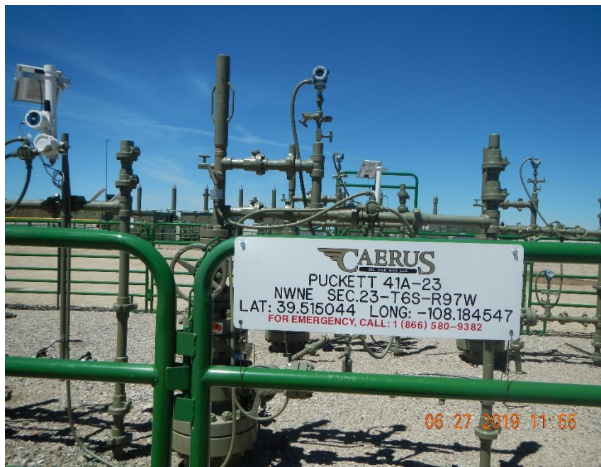
A well sign