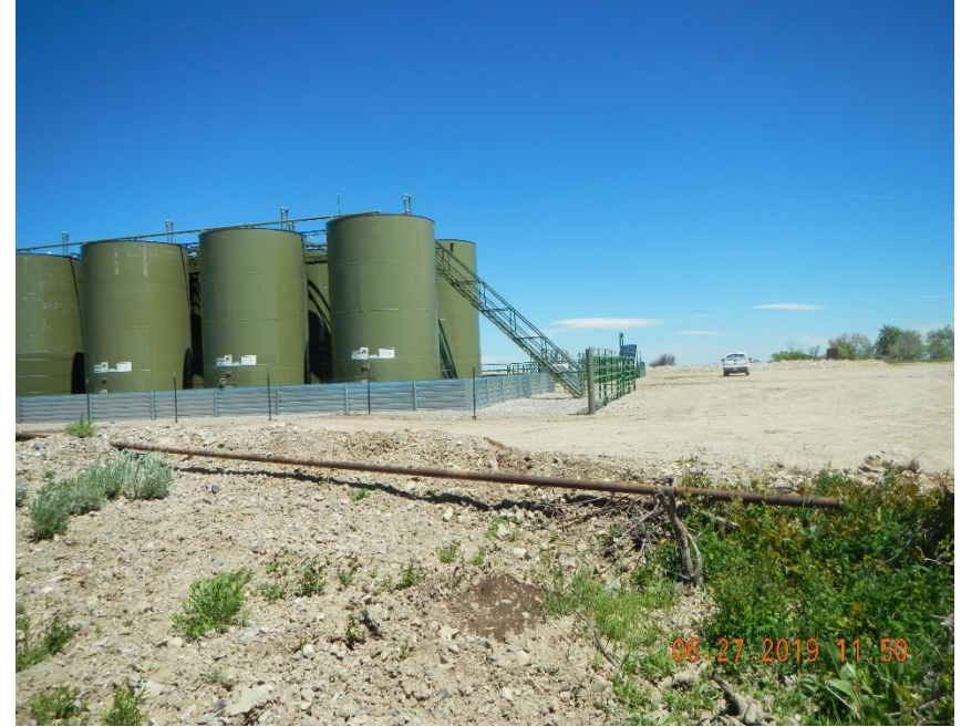
Unused stick of tubing