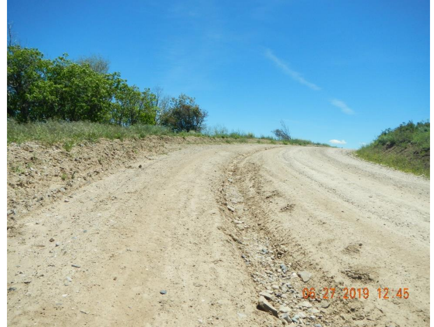
Washing rut on road near entrance.