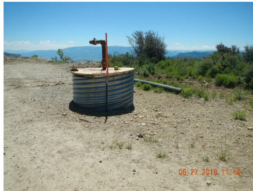
Unused poly line