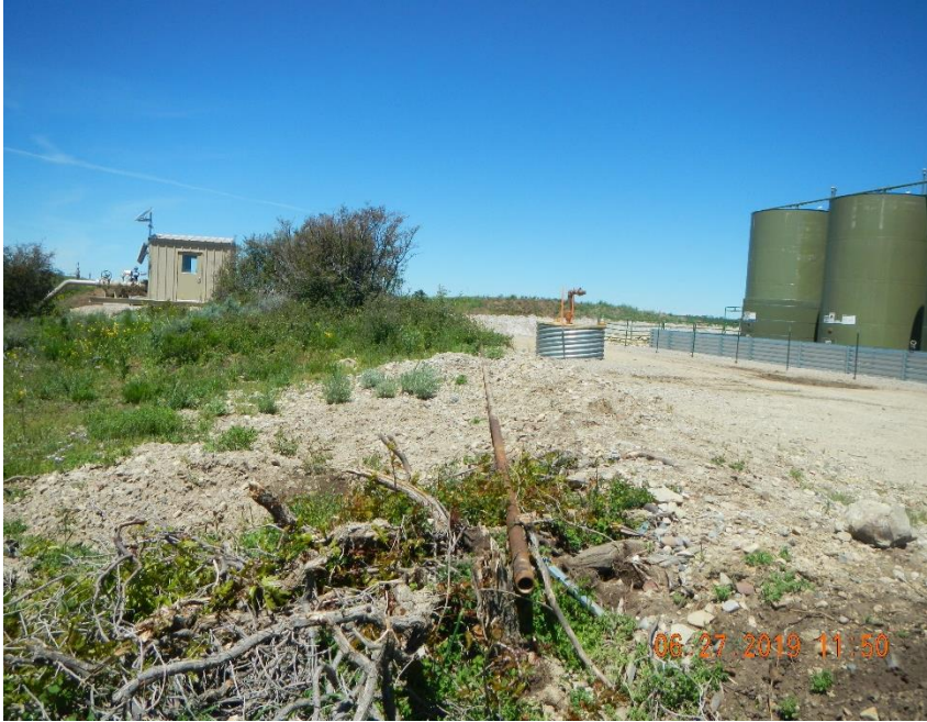
Unused stick of tubing