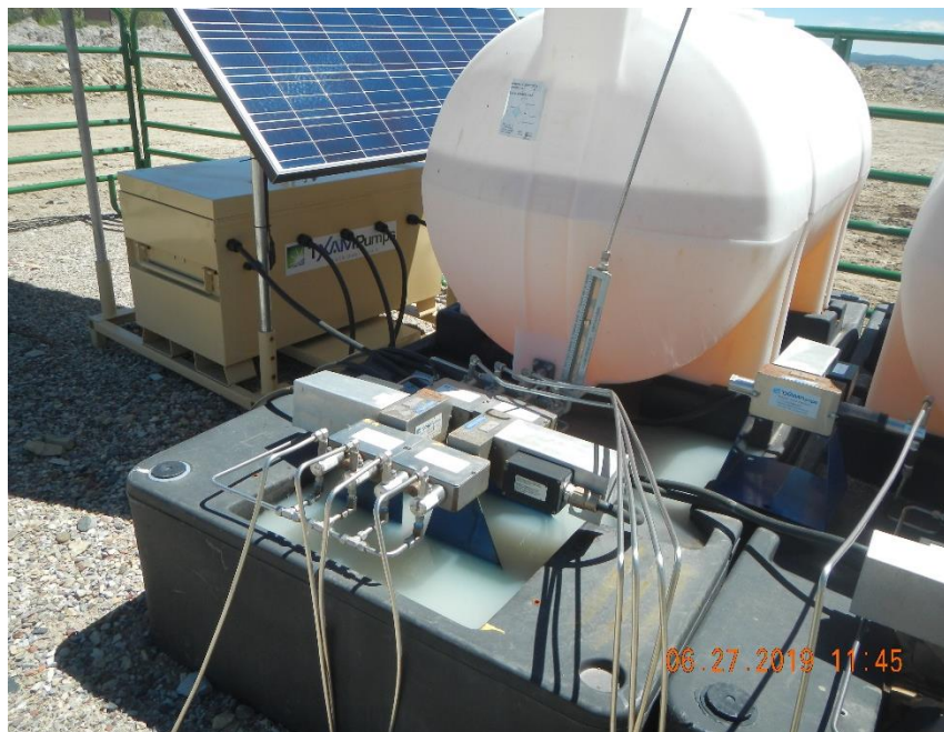
Secondary container for chemical container is full.