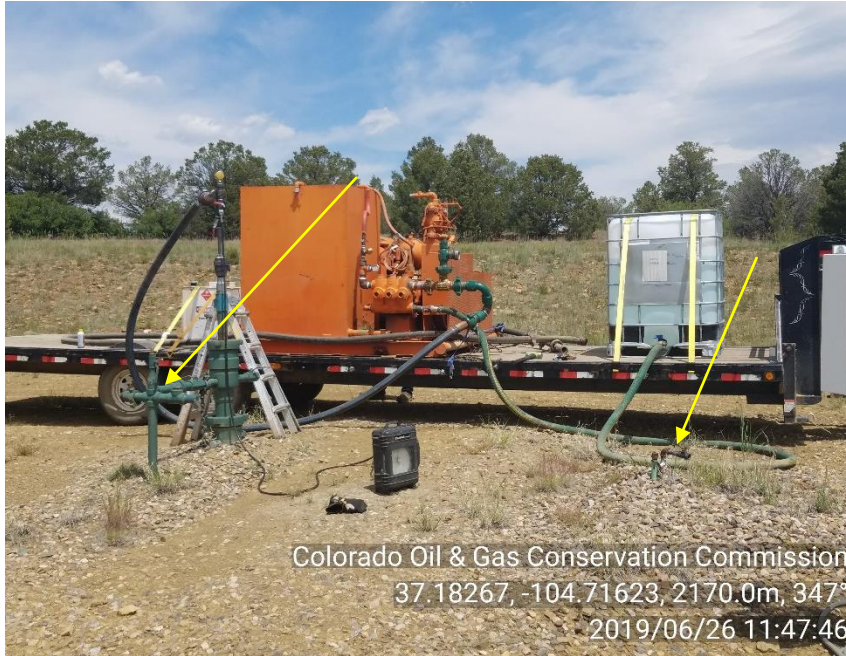
PHOTO 3: UNUSED EQUIPMENT ON LOCATION (UNUSED RISER). COMPLY WITH RULE 603.f. AND NTO REGARDING UNUSED RISERS. CA DATE 9/26/19.