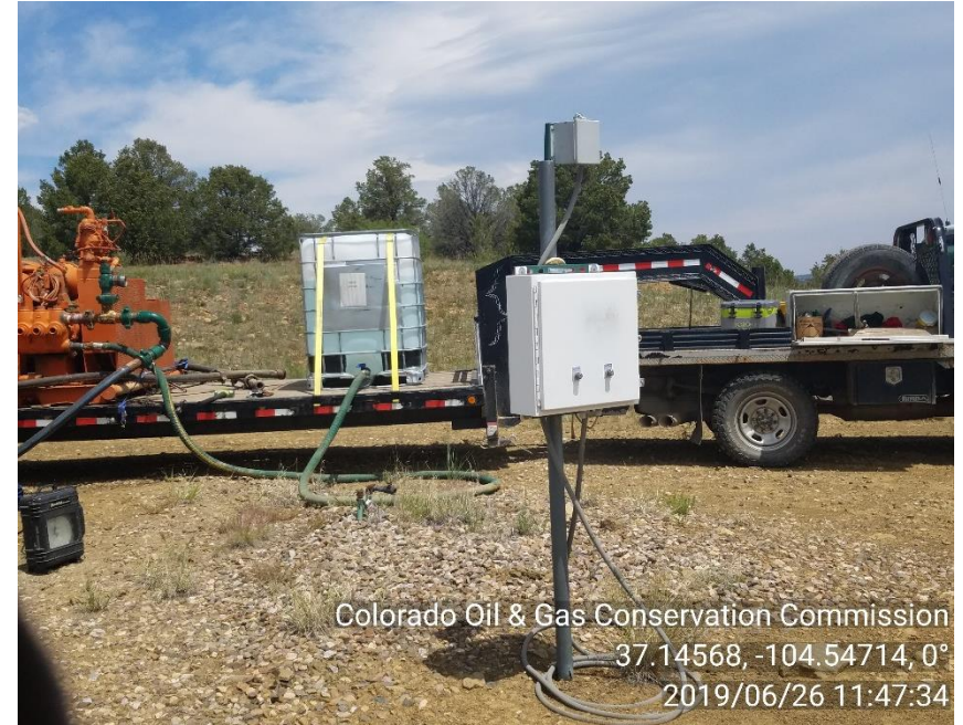
PHOTO 4: UNUSED EQUIPMENT ON LOCATION. COMPLY WITH RULE 603.f. AND NTO REGARDING UNUSED RISERS. CA DATE 9/26/19.