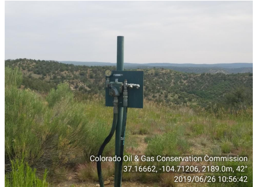
PHOTO 4: UNUSED EQUIPMENT ON LOCATION. COMPLY WITH RULE 603.f. AND NTO REGARDING UNUSED RISERS. CA DATE 9/26/19.