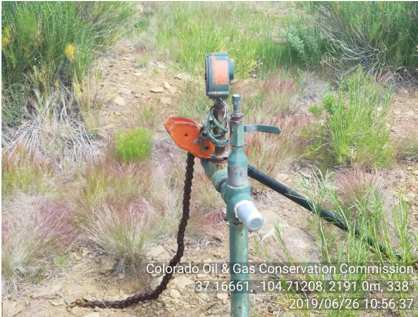
PHOTO 3: UNUSED EQUIPMENT ON LOCATION (UNUSED RISER). COMPLY WITH RULE 603.f. AND NTO REGARDING UNUSED RISERS. CA DATE 9/26/19.