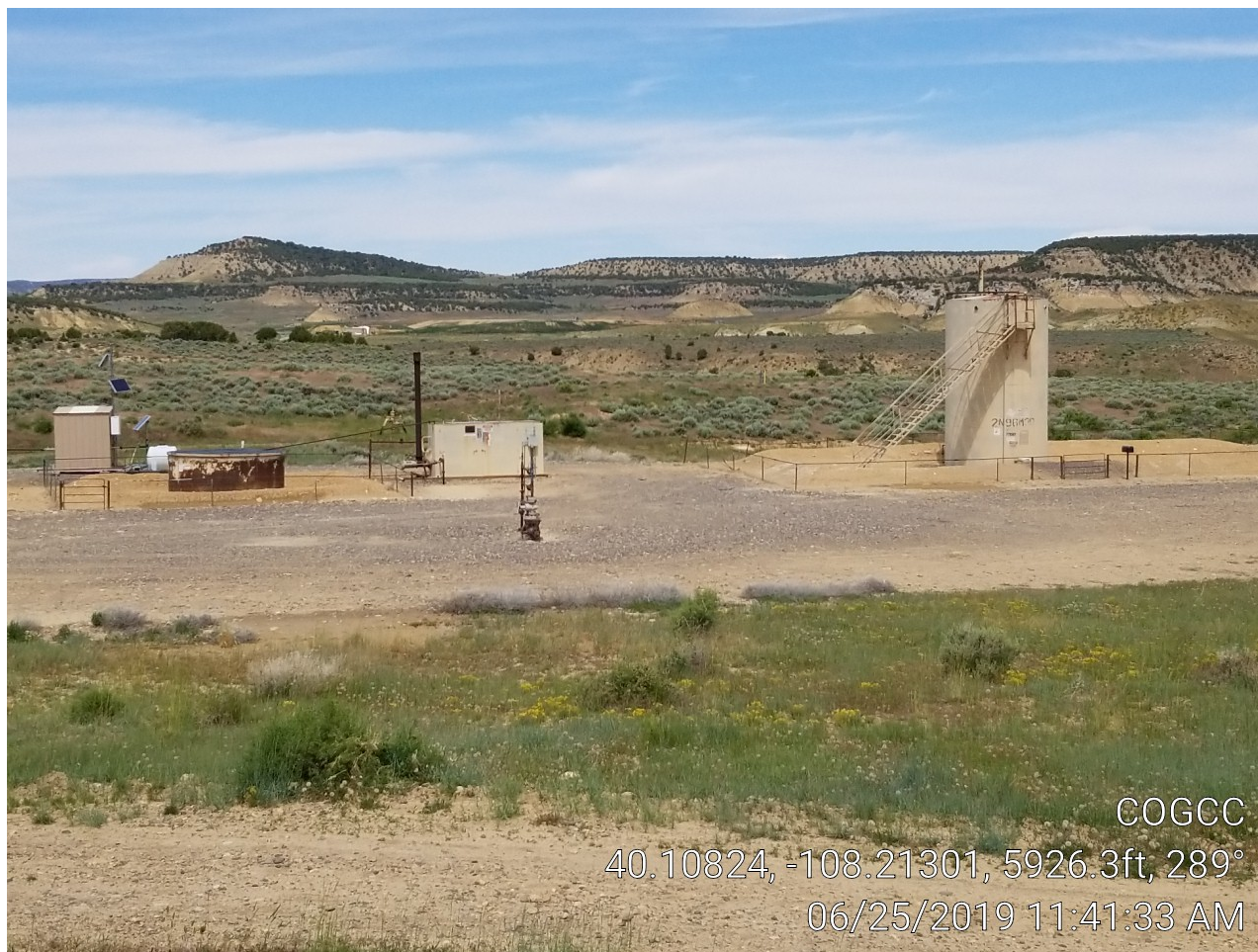
Photo 1. Location.

Federal M-30-2-96-N API: 05-103-09406 Inspection: 679704604