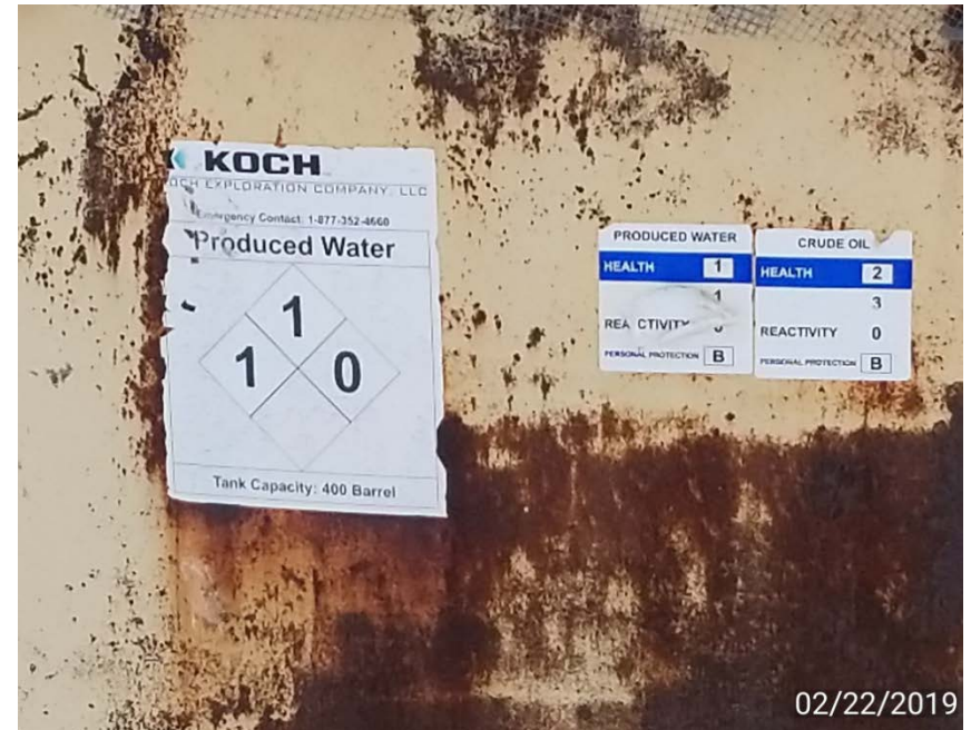
Photo 3. Blowdown tank on 2-22-2019.