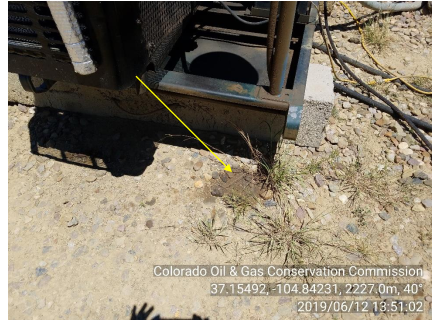
PHOTO 6: APP. 1' ROUND AREA OF IMPACTED SOIL NEAR ENGINE SKID. Remove and dispose impacted material in approved manner, service and maintain equipment and self inspect to prevent recurrence of conditions per 1002.f(2) and 907. CA DATE 7/12/19.