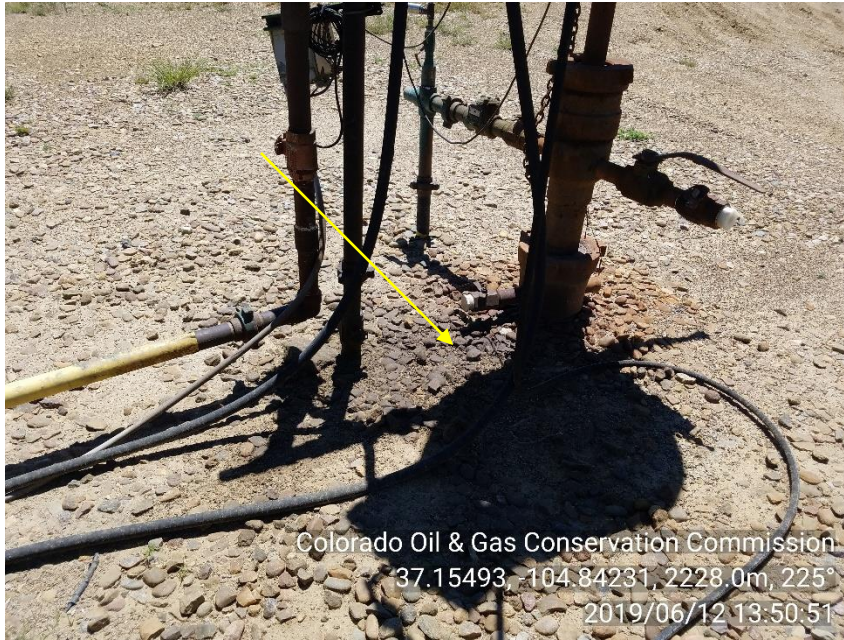
PHOTO 5: APP. 3' BY 2' AREA OF IMPACTED SOIL NEAR WELLHEAD. Remove and dispose impacted material in approved manner, service and maintain equipment and self inspect to prevent recurrence of conditions per 1002.f(2) and 907. CA DATE 7/12/19.