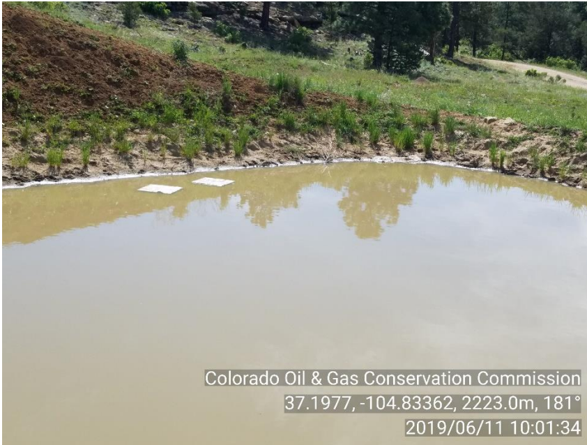
PHOTO 7: TRASH FLOATING IN ORIGINAL WELL PIT. REMOVE TRASH IN COMPLIANCE WITH 603.f. CA DATE 7/11/19.