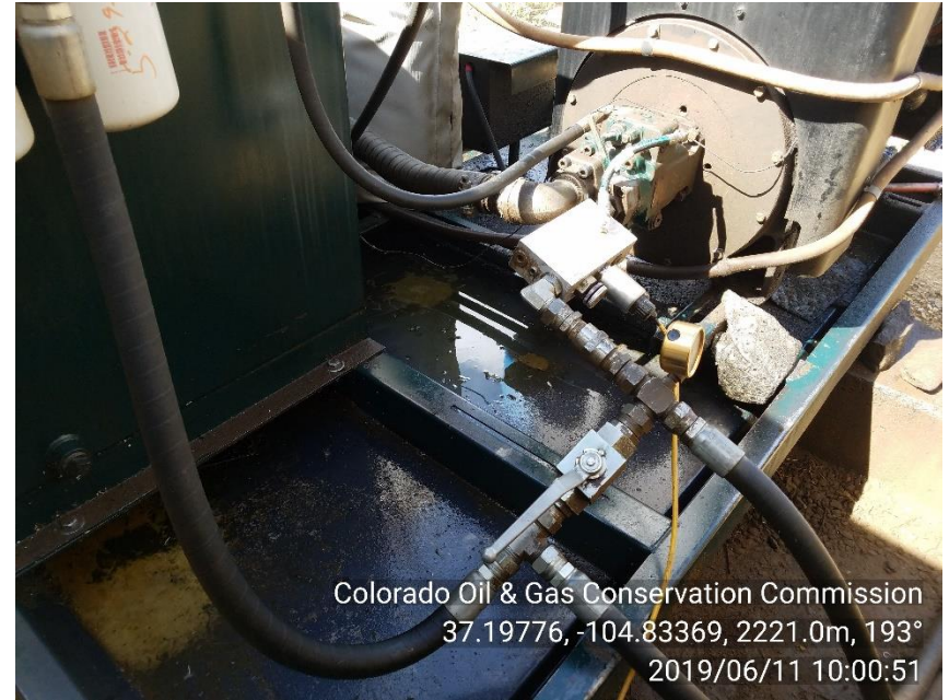
Colorado Oil & Gas Conservation Commission 37.19776, -104.83369, 2221.0m, 193° 2019/06/11 10:00:51

PHOTO 5: AREA OF IMPACTED SOIL APP. 6' BY 6' EXTENDING FROM SOUND WALL UNDER ENGINE SKID FOR ORIGINAL WELL. Remove and dispose impacted material in approved manner, service and maintain equipment and self inspect to prevent recurrence of conditions per 1002.f(2) and 907" CA DATE 7/11/19.