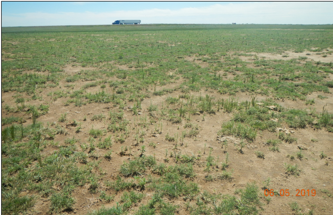
Photo 5. Facing east toward the location. There is predominately weeds growing in the northeast portion of the location.