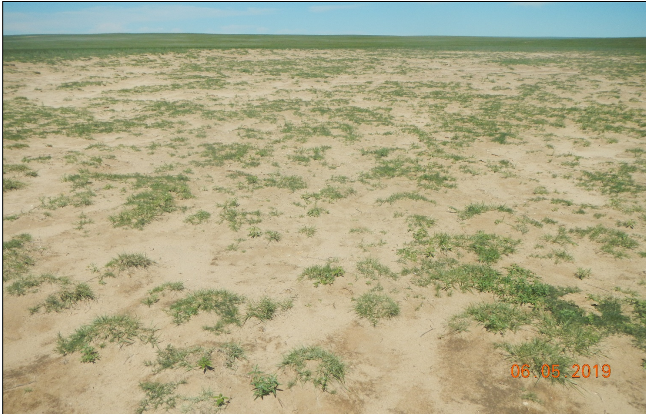
Photo 2. Facing west toward the location. Vegetation has not established and there are signs of wind erosion.