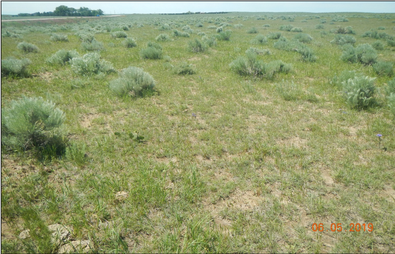
Photo 7. Facing south toward the undisturbed surrounding reference area that consist of native desirable vegetation.