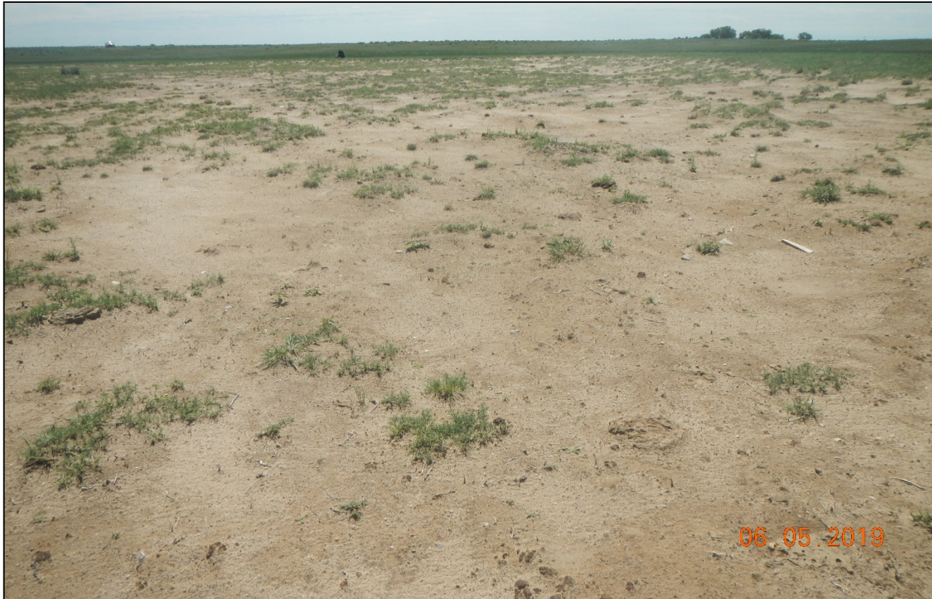
Photo 4. Facing southeast toward the location. Vegetation has not established and there are signs of wind erosion.