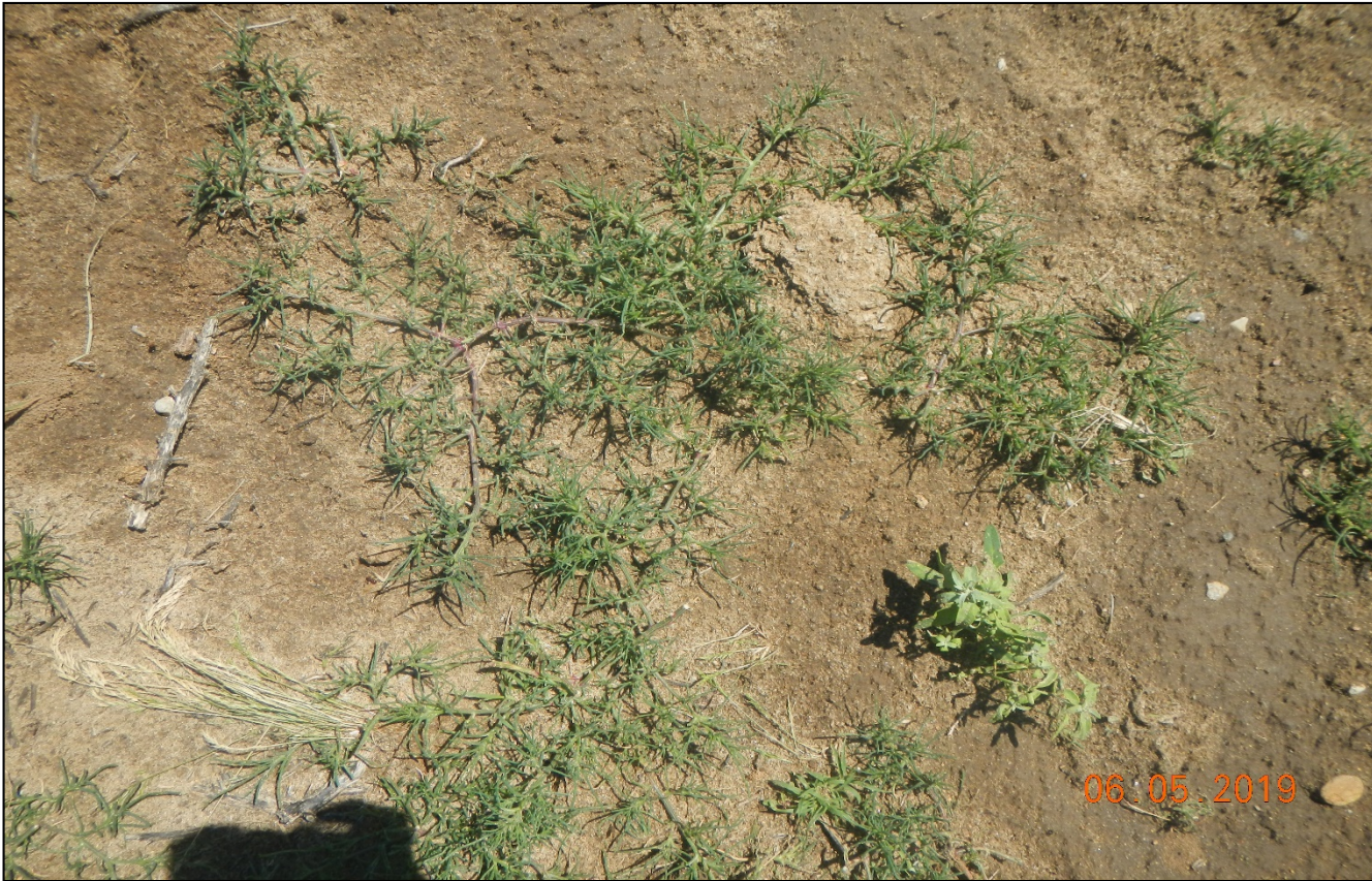
Photo 6. View of weed growth in the northeastern portion of the location. (Russian thistle)