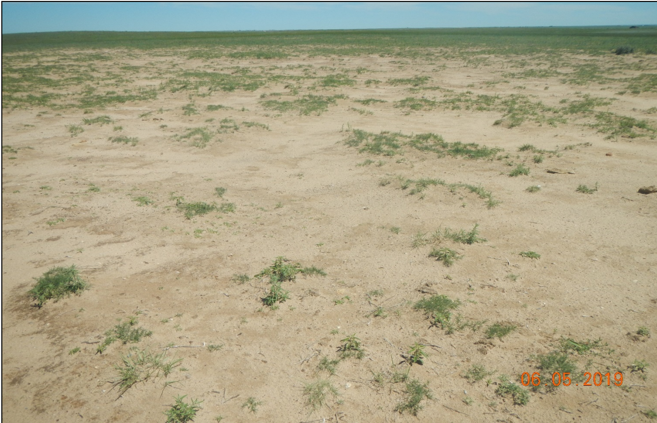
Photo 3. Facing north toward the location. Vegetation has not established and there are signs of wind erosion.