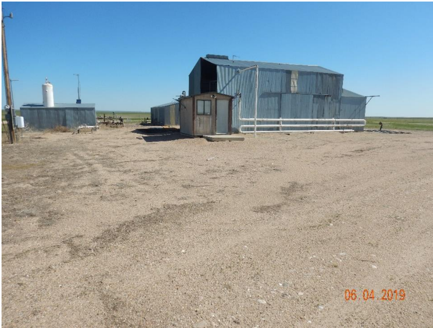
Photo 1: Photo taken from southwest end of the location, facing north. Photo shows reclamation equipment/facilities remaining on the location . Operator has failed to conduct final reclamation on the location.