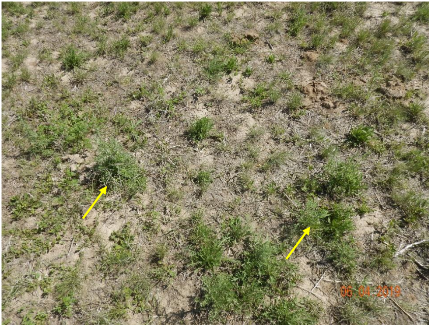
Photo 13: Photo taken from the adjacent areas of the location. Photo shows areas where Diffuse Knapweed have spread from the location remain established.