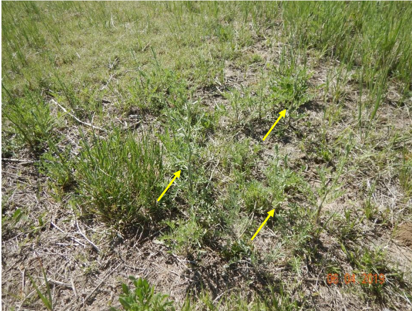
Photo 3: Photo taken from the south end of the location. Photo shows areas where Diffuse Knapweed is maturing.