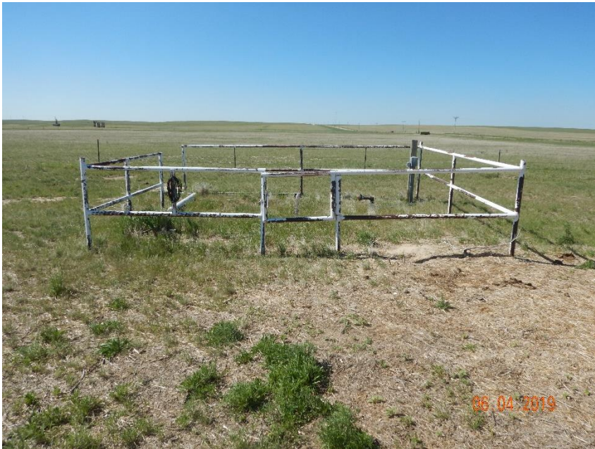
Photo 5: Photo taken from south end of the location, facing south. Photo shows reclamation equipment/facilities remaining on the location. Operator has failed to conduct final reclamation on the location.