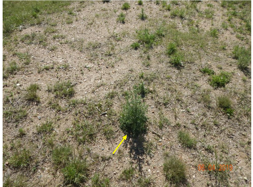
Photo 4: Photo taken from the south end of the location. Photo shows areas where Diffuse Knapweed is maturing.