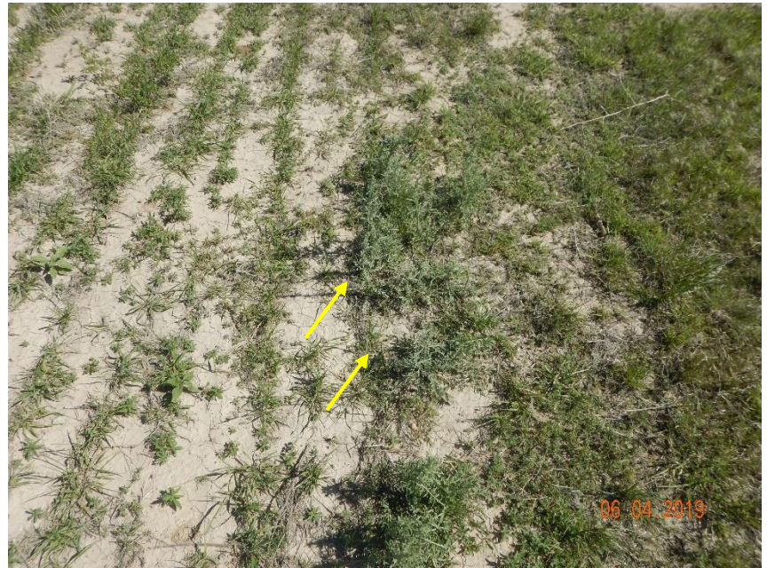
Photo 8: Photo taken from the east end of the location. Photo shows areas where Diffuse Knapweed is maturing