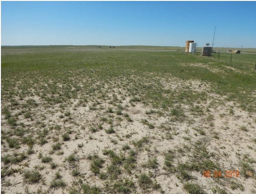
Photo 11: Photo taken from the adjacent areas, east of the location.