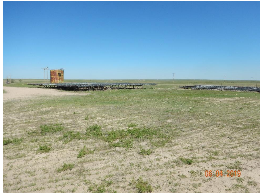
Photo 10: Photo taken from east end of the location, facing northwest. Photo shows reclamation equipment/facilities remaining on the location. Operator has failed to conduct final reclamation on the location.