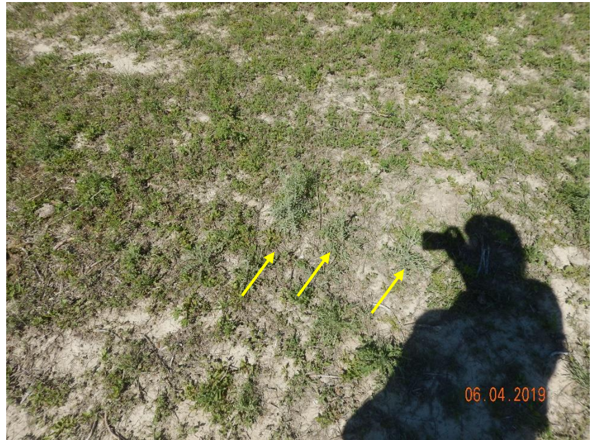
Photo 12: Photo taken from the adjacent areas of the location. Photo shows areas where Diffuse Knapweed have spread from the location remain established.