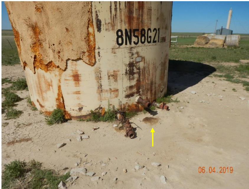
Photo 7: Photo shows stained/contaminated soils at tank on the southeast end of the location.