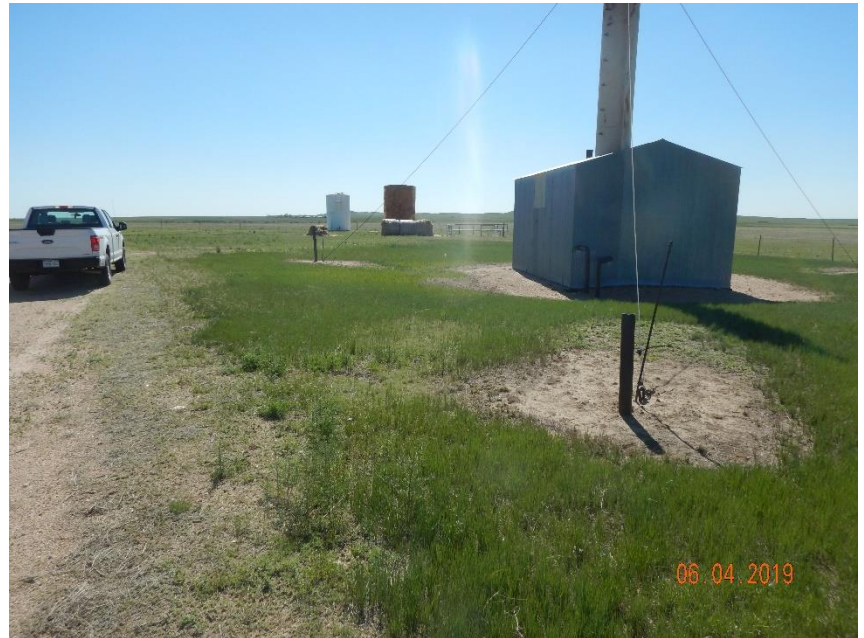
Photo 2: Photo taken from southwest end of the location, facing east. Photo shows reclamation equipment/facilities remaining on the location . Operator has failed to conduct final reclamation on the location.