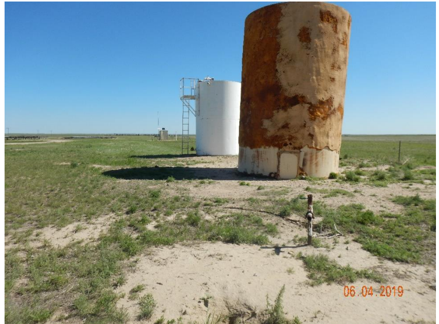
Photo 6: Photo taken from south end of the location, facing north. Photo shows reclamation equipment/facilities remaining on the location. Operator has failed to conduct final reclamation on the location.