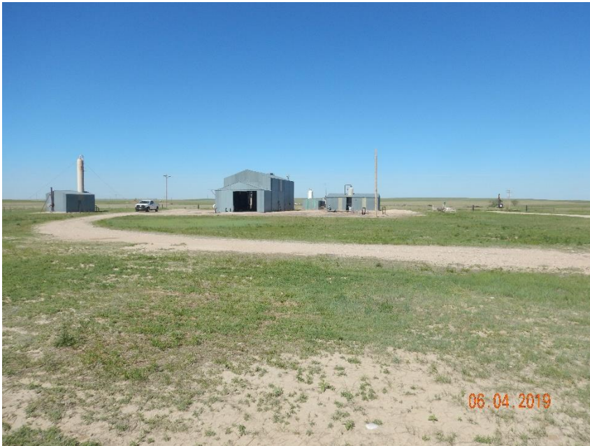
Photo 9: Photo taken from east end of the location, facing west. Photo shows reclamation equipment/facilities remaining on the location. Operator has failed to conduct final reclamation on the location.