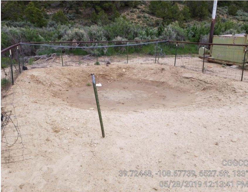
Photo 2. Pit without fence on one side.