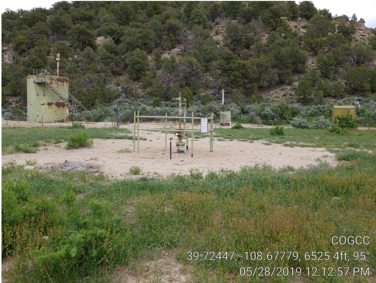
Photo 1. Location look east.