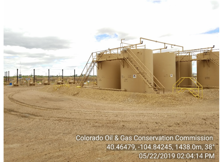
Photo #8 Battery HCW 23-43, 23-54 HCW 24-24, 24-13, 24-14, 24-23, 24-53 HCW FD 24-20D, 24-35D, 24-36D Shut-down Temporary tank NOW removed