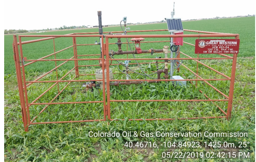
Photo #4 HCW 23-54 Wellsite Shut-In | SI Emergency number NOW posted Weeds appear mitigated