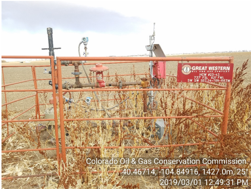
Photo #1 HCW 23-43 (05-123-32577) Wellsite Shut-In | SI Emergency number NOT posted Weeds from prior insp.