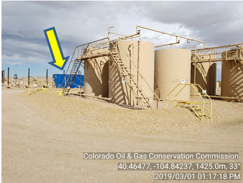
Photo #7 Battery HCW 23-43, 23-54 HCW 24-24, 24-13, 24-14, 24-23, 24-53 HCW FD 24-20D, 24-35D, 24-36D Shut-down Temporary tank – from prior insp.