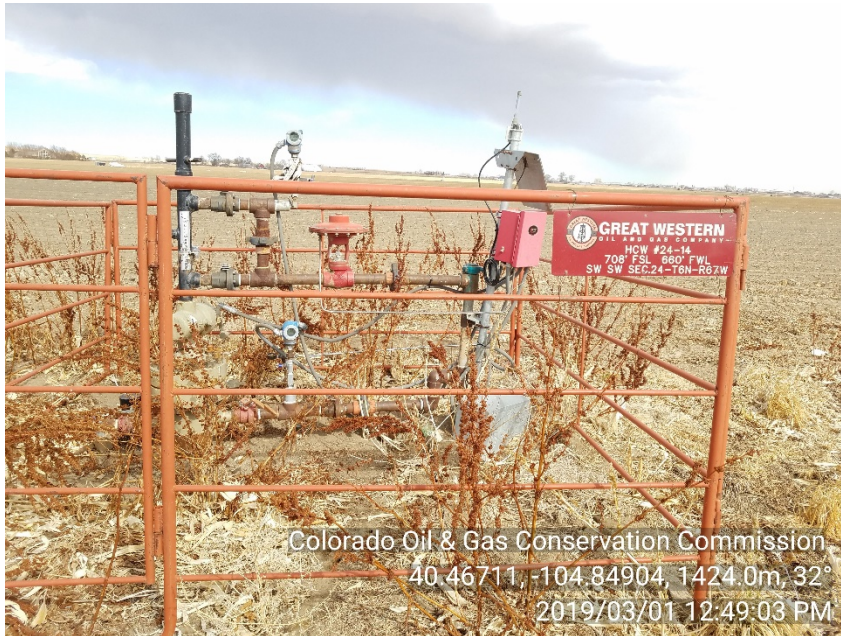
Photo #5 HCW 24-14 (05-123-31498) Wellsite Shut-In | SI Emergency number NOT posted Weeds from prior insp.