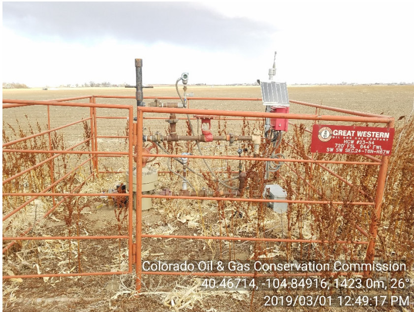
Photo #3 HCW 23-54 (05-123-32572) Wellsite Shut-In | SI Emergency number NOT posted Weeds from prior insp.