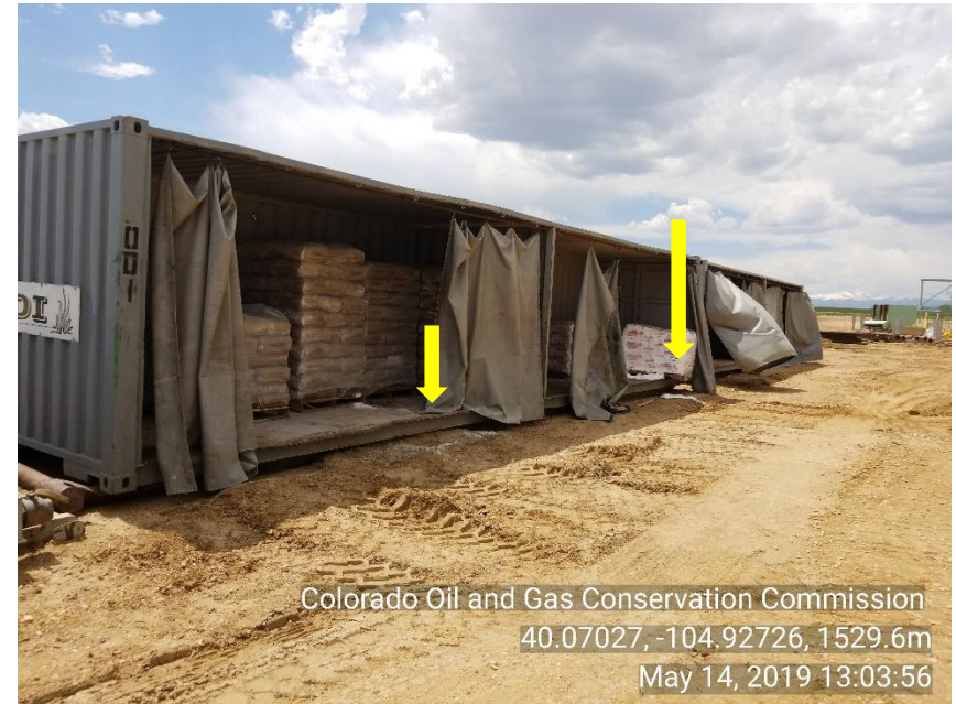
Photo 9 Improper chemical Handling

Colorado Oil and Gas Conservation Commission 40.07027, -104.92726, 1529.6m May 14, 2019 13:03:56