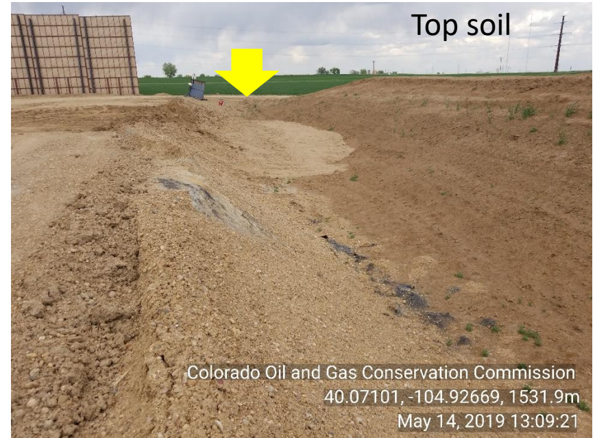
Photo 18 Protection of soils: Mud appears to be being pushed off location on top soil pile