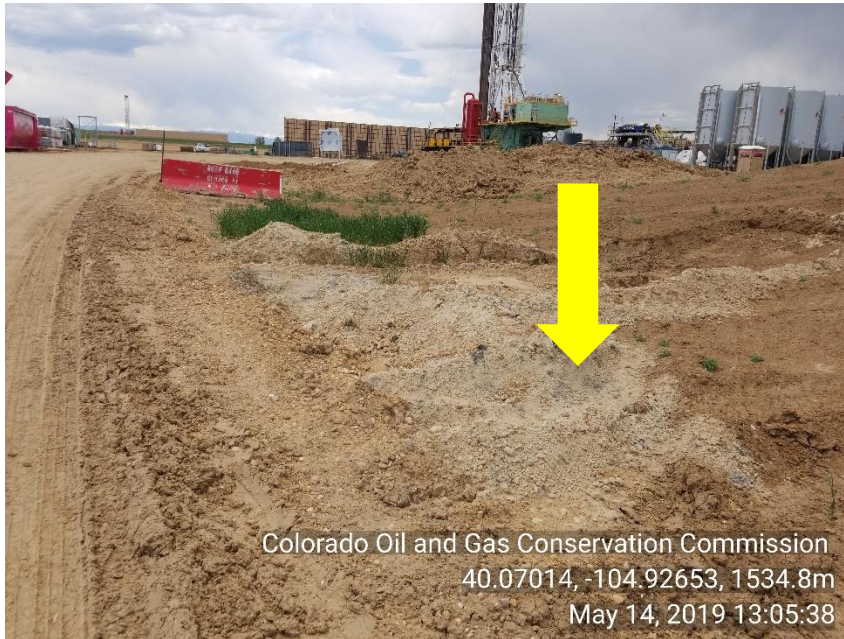
Photo 13 stained soil pushed in drainage ditch for location drainage.