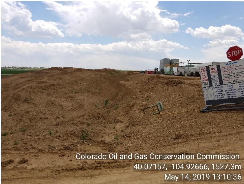
Photo 19 drainage ditch between location and top soil pile.