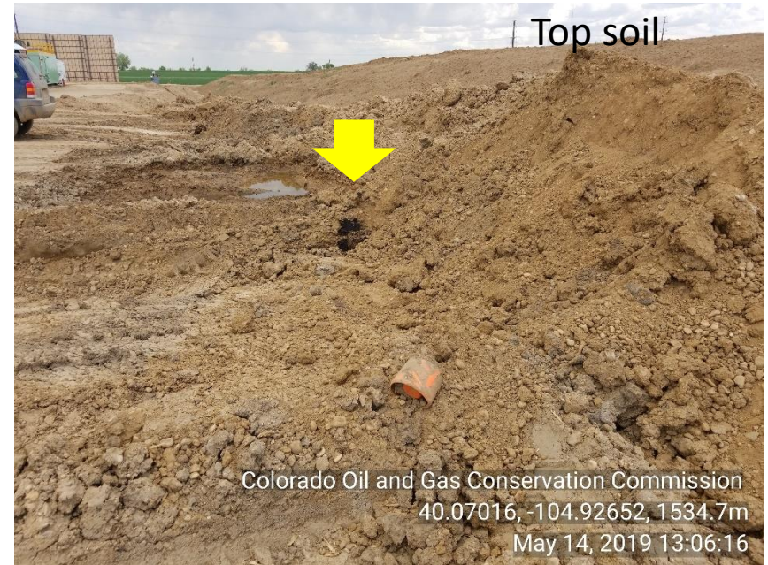
Photo 14 Protection of soils: appears crew is pushing up mud and gravel from location onto top soil pile. Stained soil and debris also being pushed on top soil.