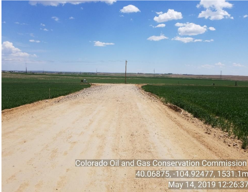
Photo 1 Tracking pad