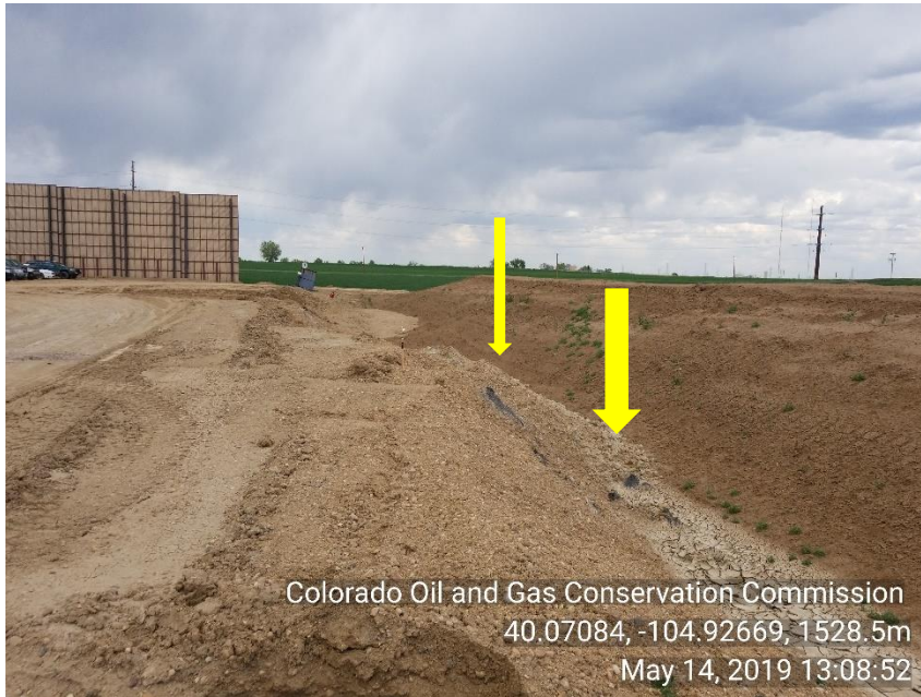
Photo 17 stained soil pushed in drainage ditch between location and top soil pile.