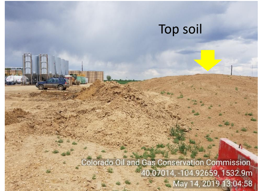
Photo 12 Protection of soils: appears crew is pushing up mud and gravel from location onto top soil pile.