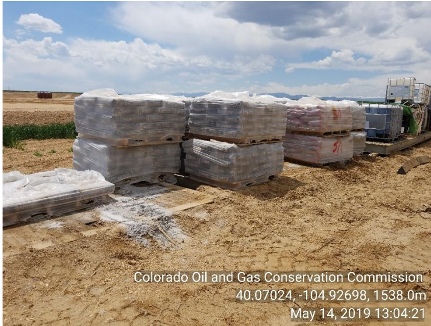
Photo 11 Improper chemical storage not on secondary containment. Stained soil from what appears to be torn bag.