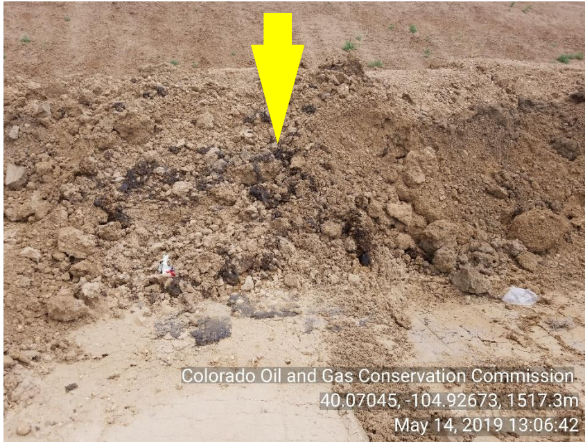
Photo 15 stained soil pushed in drainage ditch between location and top soil pile.