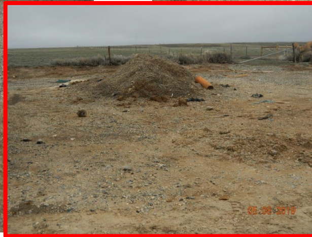
Photo#10: Various piles of unidentified soil & soil mixed with gravel were noted stockpiled in different areas of Location.