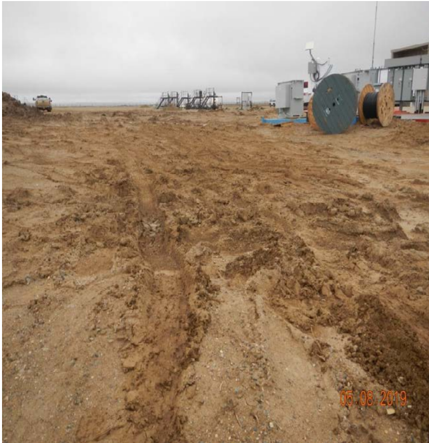
Photo#6: View to East to pad from lower level where supplies are stored.