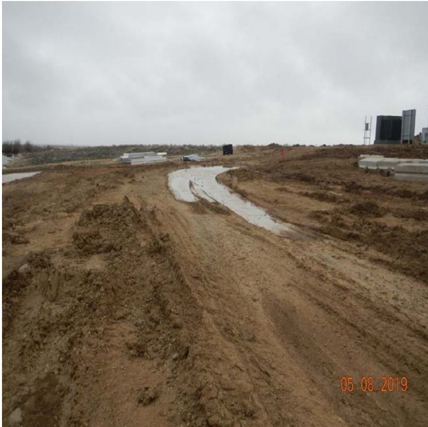
Photo#8: Lower auxiliary road and BMPs do not appear to have been maintained