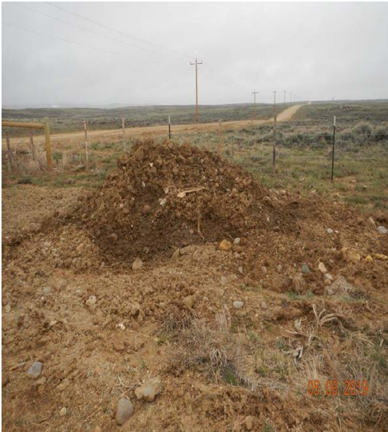
Photo#12: Various piles of unidentified soil & soil mixed with gravel were noted stockpiled in different areas of Location.