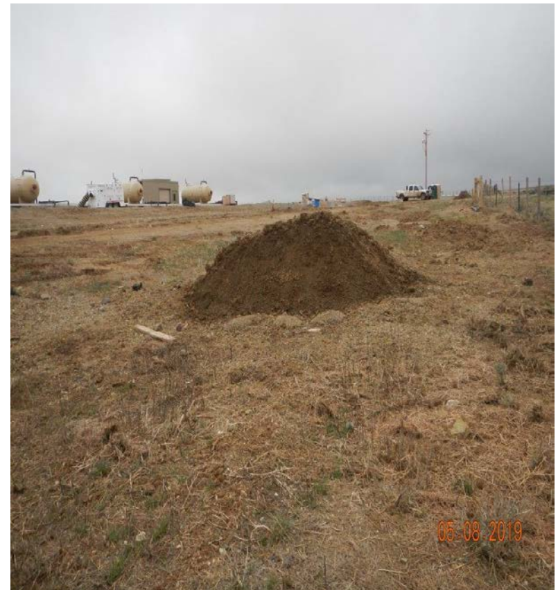
Photo#13: Various piles of unidentified soil & soil mixed with gravel were noted stockpiled in different areas of Location.