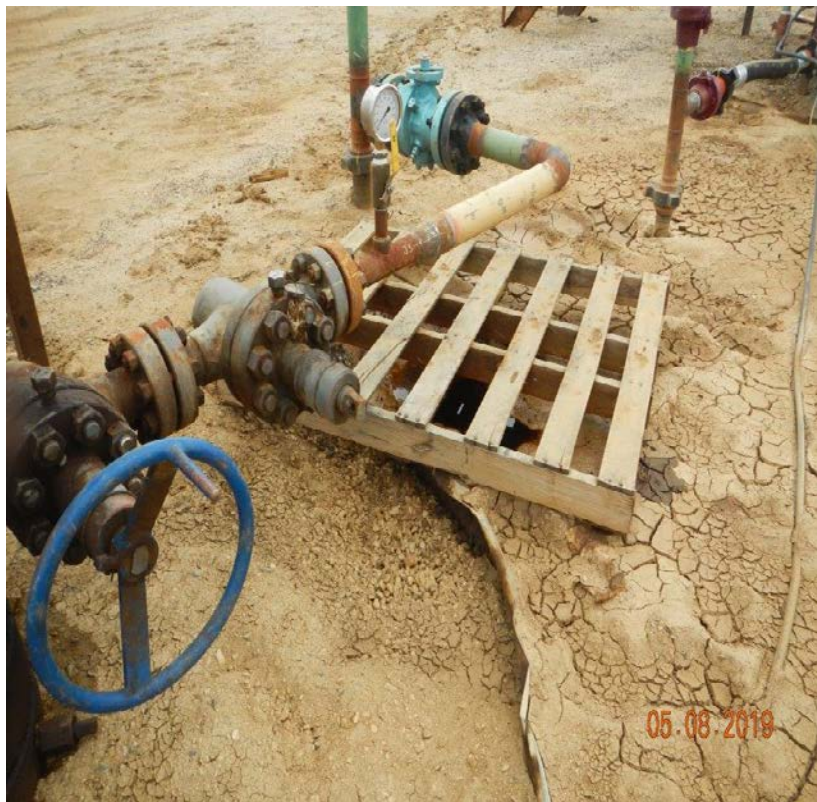
Photo#2: Peters 0781 9-13H12 API# 057-06584. Pallet covering what Operator identified as mouse hole.