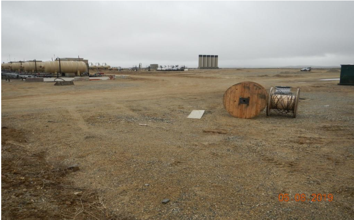
Photo#1: Overview of Location to Northeast. Note Debris in foreground.