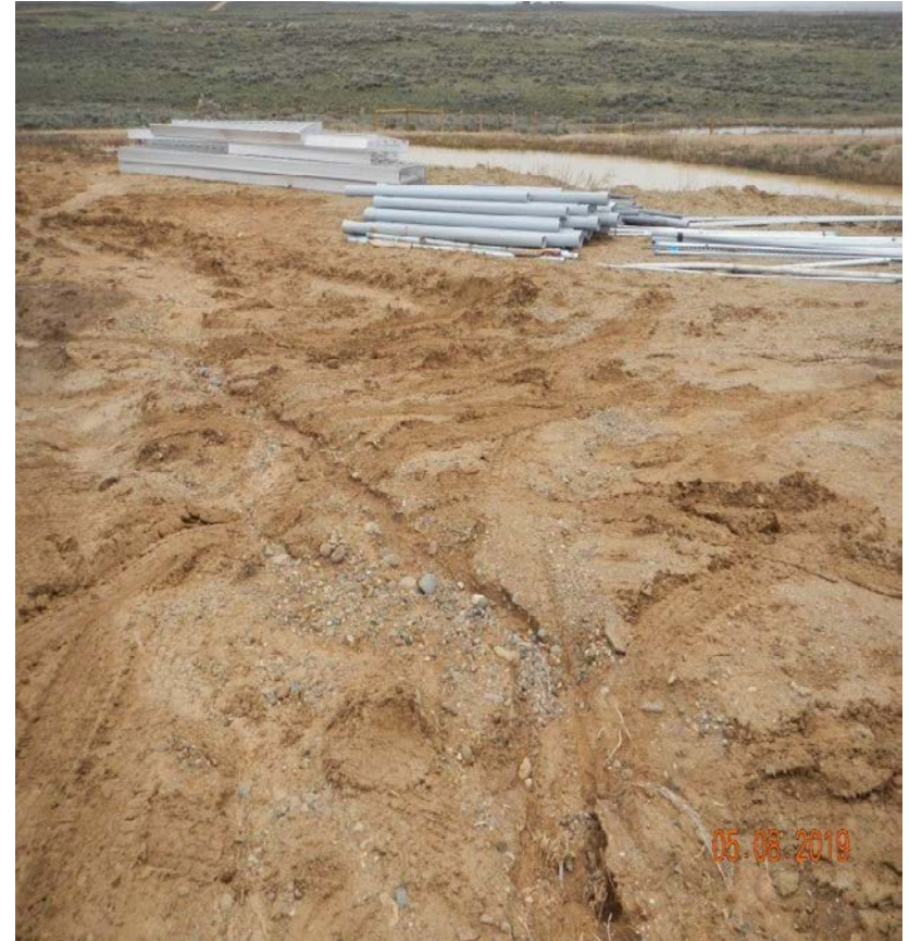
Photo#7: Supplies are being stored off of the compacted pad area. Retention pond in background. View to NW.