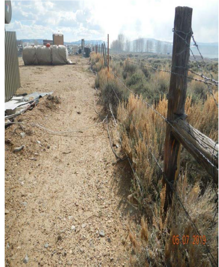
Photo#4: Lines are draped at limits of disturbance along sagebrush and fence line.