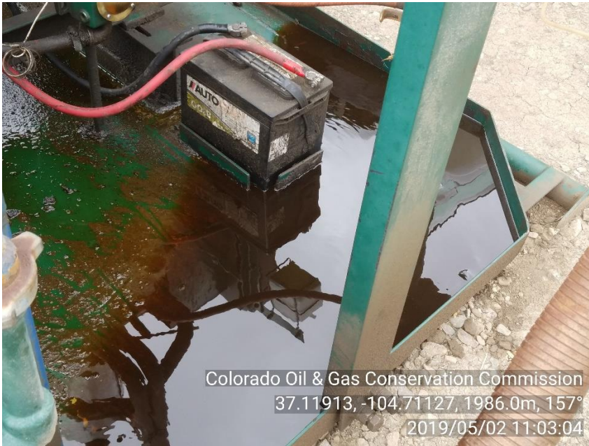
PHOTO 3: APPROXIMATELY 1.5" OF STANDING OIL IN PRIME MOVER ENGINE SKID.