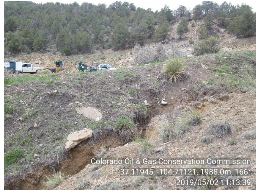
PHOTO 6: STORMWATER DRAINAGE DITCH NORTH OF LOCATION SHOWING SIGNS OF EROSION AND SEDIMENT MIGRATION.