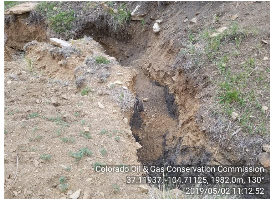
PHOTO 8: CLOSER LOOK AT EROSION FROM PREVIOUS PHOTOS (PHOTO #6 & #7)