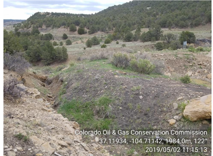
PHOTO 10: IMAGE SHOWING STORMWATER DRAINAGE. PHOTO TAKEN FROM THE WEST LOOKING EAST