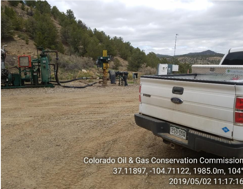
Colorado Oil & Gas Conservation Commission 37.11897, -104.71122, 1985.0m, 104° 2019/05/02 11:17:16