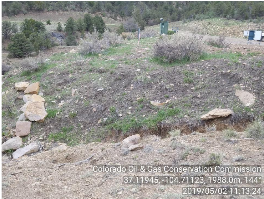
PHOTO 9: ANOTHER IMAGE SHOWING PROXIMITY OF STORMWATER DRAINAGE TO LOCATION PHOTO TAKEN FROM THE NORTH LOOKING SOUTH