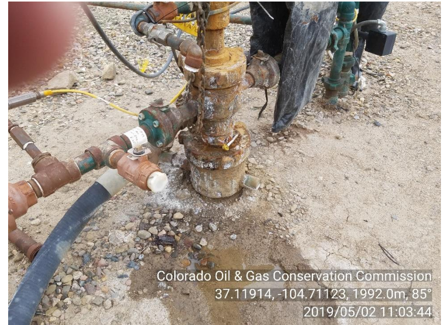
PHOTO 4: 1" PIPE IS DRIPPING PRODUCED WATER AND PUDDLING NEXT TO WELLHEAD. 1" VALVE IS CLOSED AND PIPE HAS A PLACTIC PLUG.