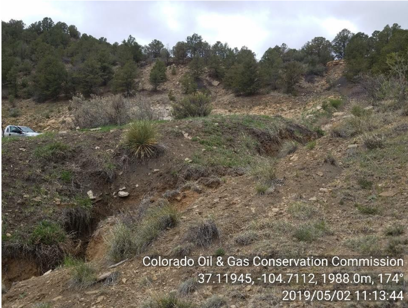
PHOTO 11: ANOTHER IMAGE SHOWING STORMWATER DRAINAGE THE ENTIRE LENGTH OF LOCATION TAKEN FROM THE NORTHEAST LOOKING SOUTHWEST