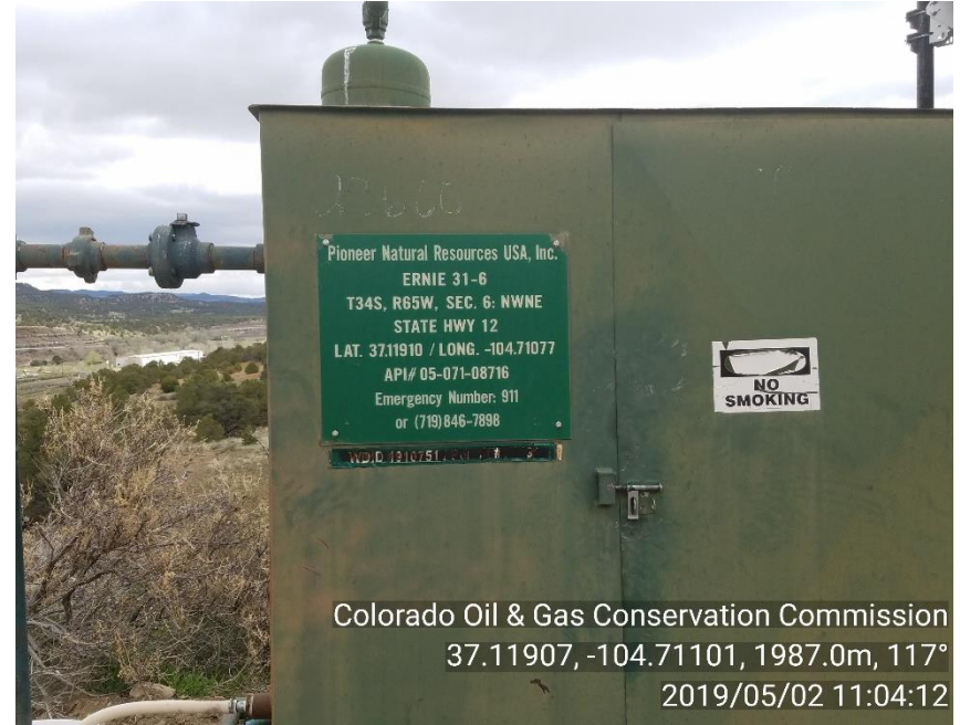
Colorado Oil & Gas Conservation Commission 37.11907, -104.71101, 1987.0m, 117° 2019/05/02 11:04:12