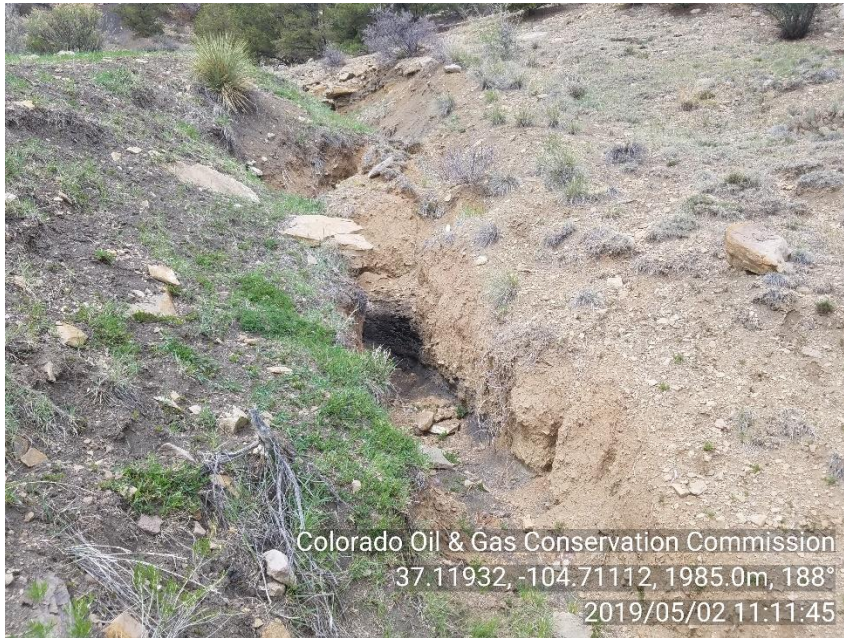
PHOTO 7: ANOTHER ANGLE OF STORMWATER DRAINAGE NORTH OF LOCATION SHOWING SIGNS OF EROSION AND SEDIMENT MIGRATION.