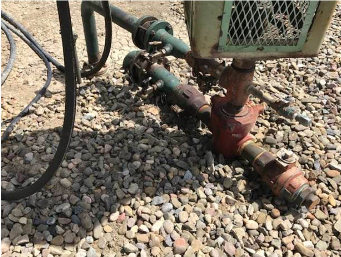
PHOTO 1: THE STAINED SOIL AROUND THE WELL HEAD HAS BEEN REMOVED FROM LOCATION.

GOLDEN EAGLE 19-06 API# 05-071-08698 – TIMBER CREEK OGCC OPERATOR NUMBER 10672 - DATE: APRIL 22, 2019 CORRECTIVE ACTIONS COMPLETED REGARDING COGCC FIR DOCUMENT # 688401795