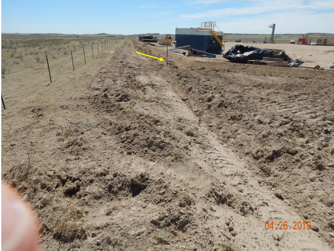
Photo 1: Photo taken from the northeast corner of the location, facing south. Photo shows survey stakes. Operator states within FIRR 401983658 that location was re-surveyed, and that the location has been constructed within the stakes. Photo shows that there area areas of the location's disturbance beyond the survey stakes on the north end of the photo.