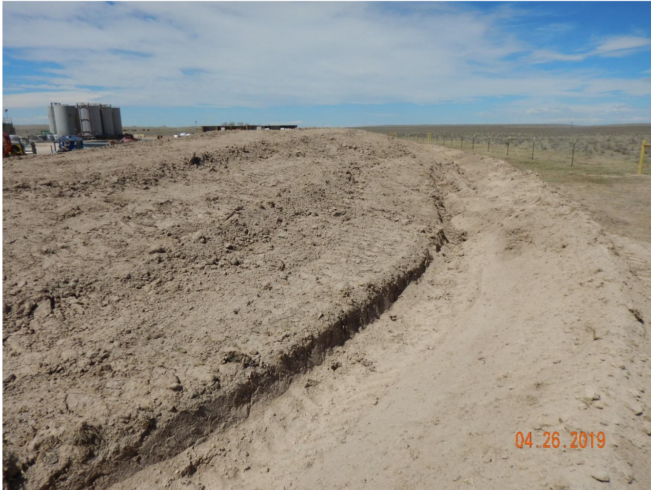
Photo 2: Photo taken from the northeast corner of the location, facing west. Operator states within FIRR 401983658 that location was re-surveyed, and that the location has been constructed within the stakes. Photo shows that there area areas of the location's disturbance beyond the survey stakes on the north end of the location.