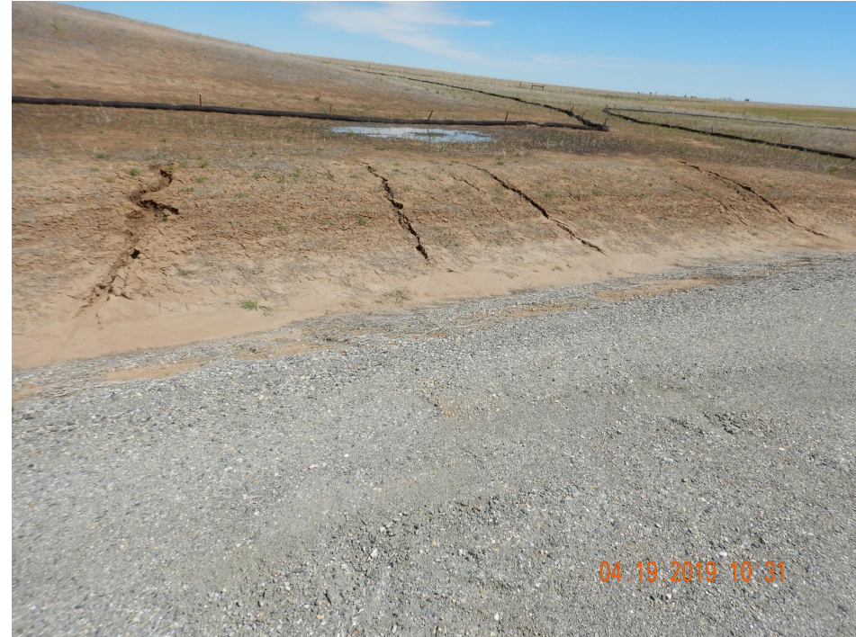
Photo 4. Photo taken from the southeastern well location, facing North. Photo illustrates the ditch BMP with no check dams.