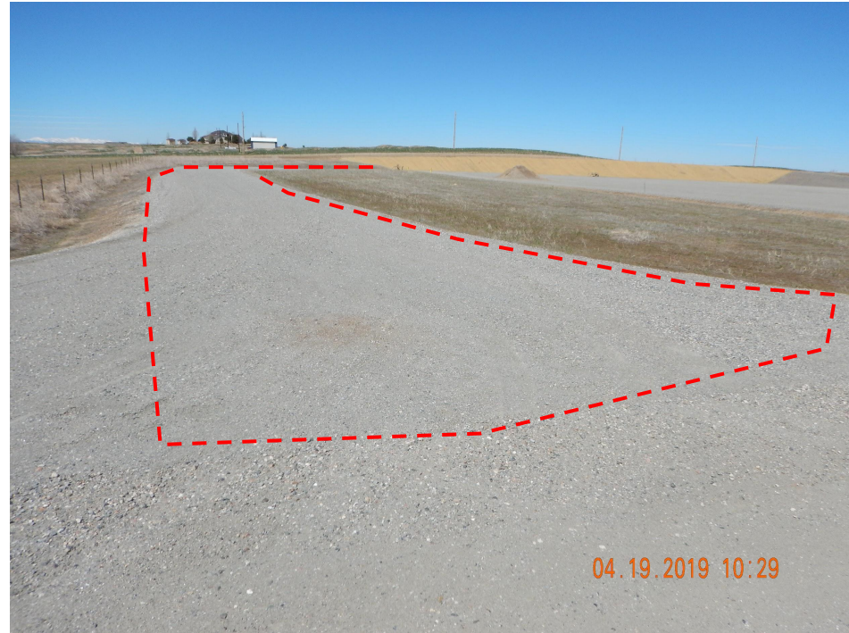
Photo 2. Photo taken from the entrance of the location, facing West. After Operations are completed, this appears to be the only area that will be reclaimed for Interim Reclamation.