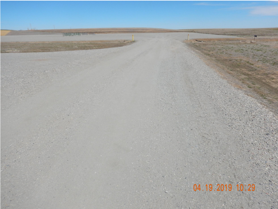
Photo 1. Photo taken from the entrance of the location, facing North. Operator has constructed the location and set conductors, but has not started drilling operations.