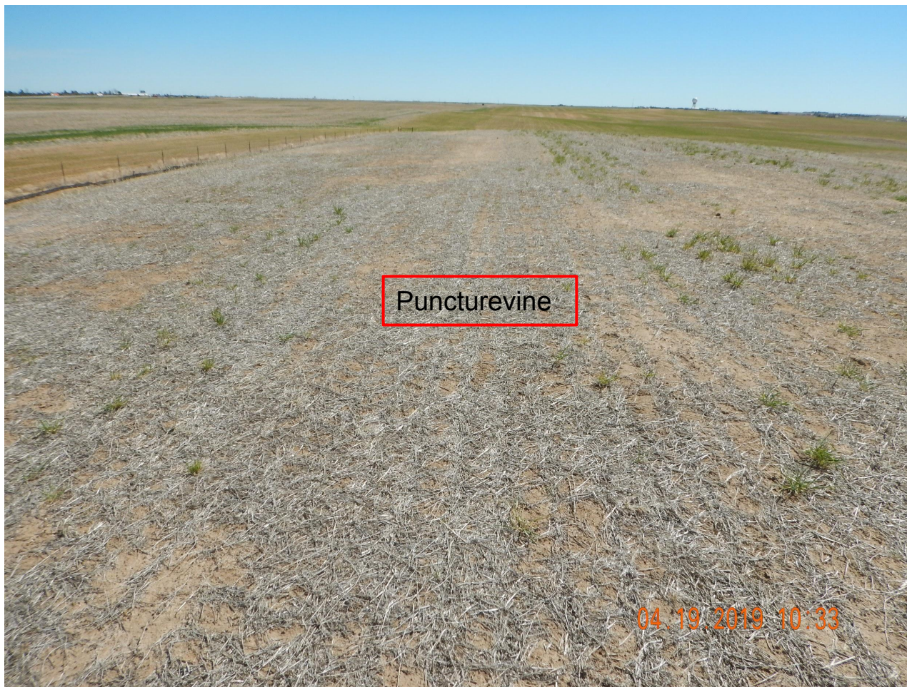
Photo 7. Photo taken from the northern topsoil stockpile, facing East. Photo illustrates Puncturevine which has established throughout the entire topsoil stockpile. Operator has attempted to seed the topsoil stockpile; however, there is not sufficient establishment to protect from wind and water erosion, and to prevent weed establishment.