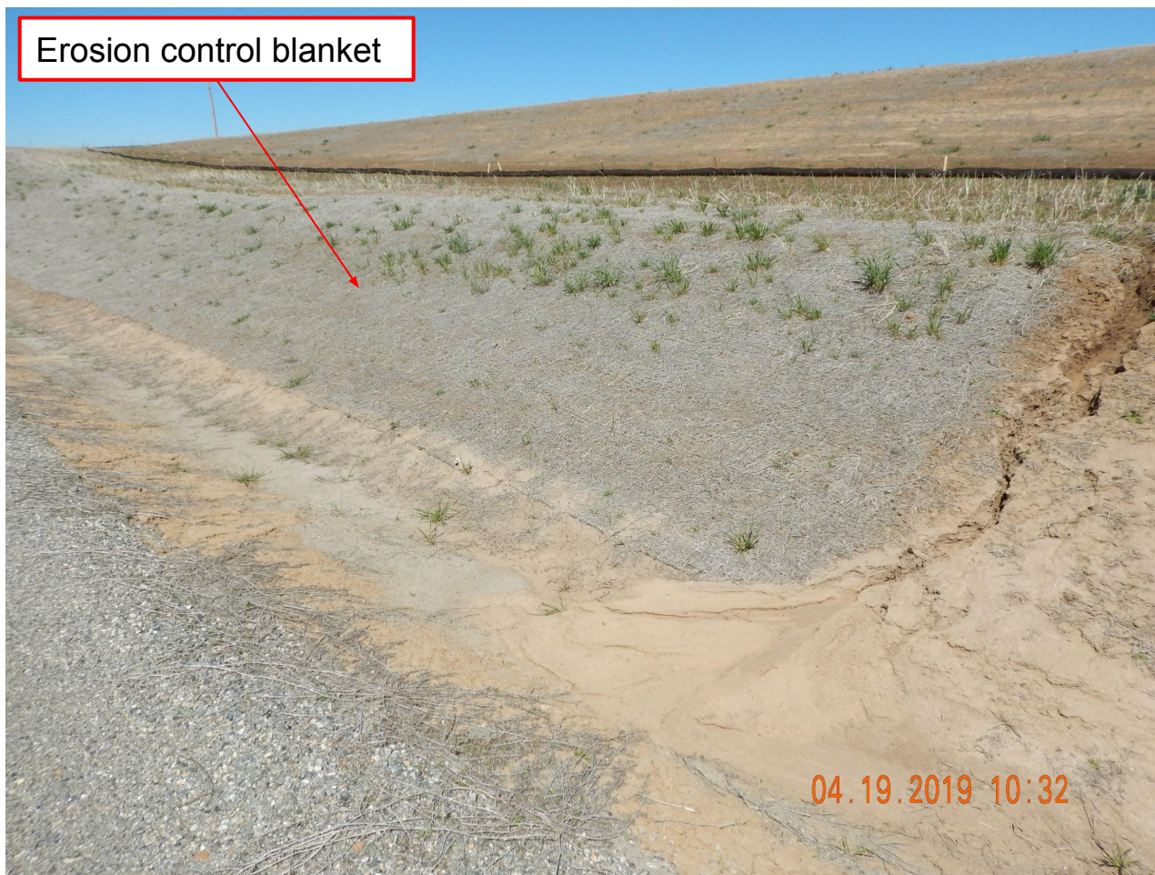
Photo 6. Photo taken from the northern cut slope, facing West. Operator has installed erosion control blankets along portions of the cut slope. Operator has not sufficiently stabilized all cut slope areas.