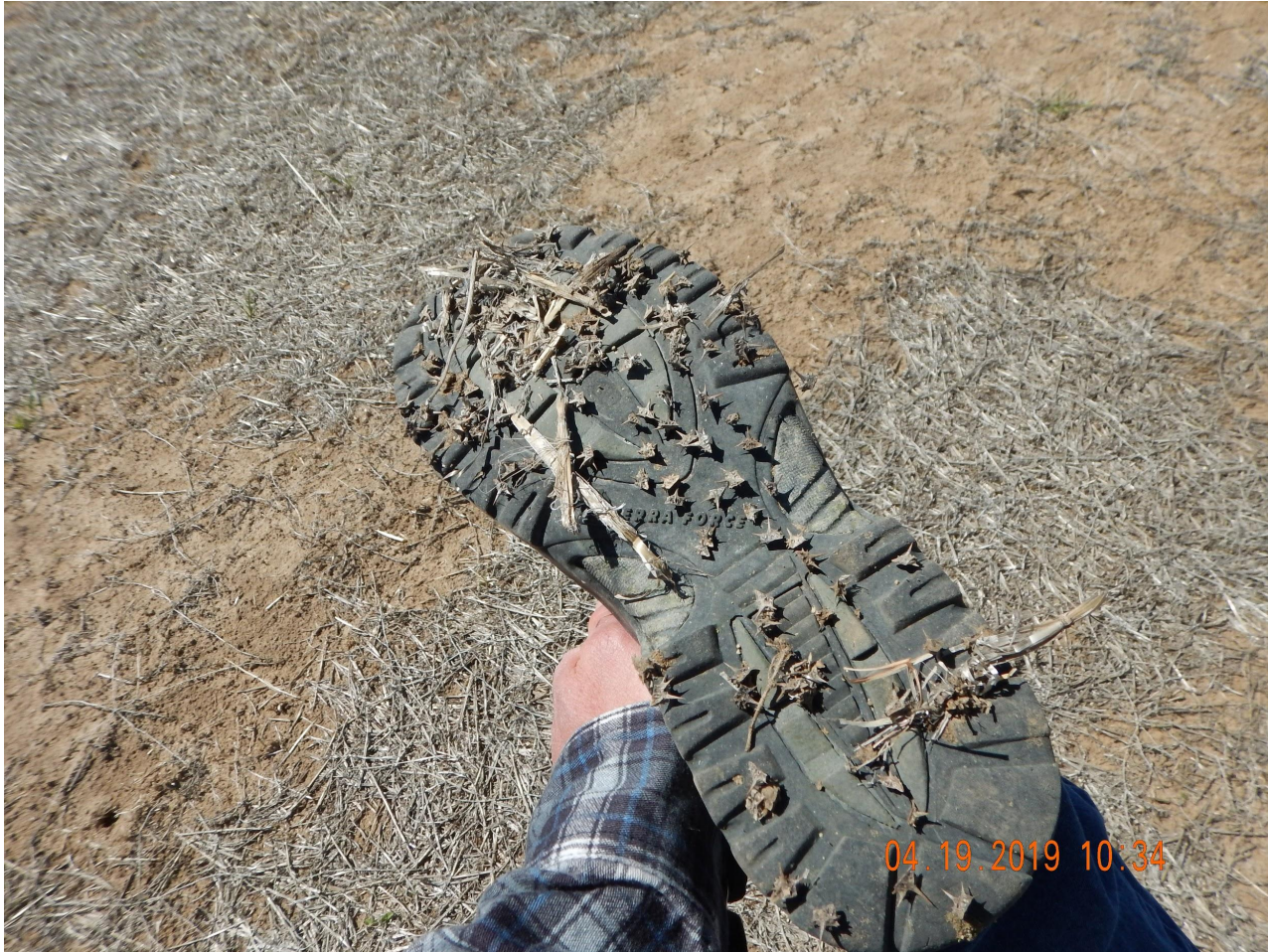
Photo 8. Photo taken from the northern topsoil stockpile. Photo illustrates Puncturevine seed heads on the bottom of the boot sole.