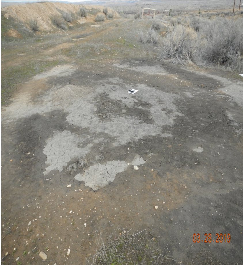
Photo#:3 Area approx. 24'X20' of what appears to be black stained soil which retains smell of petroleum.