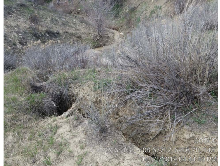
Photo 9. Storm water channel from location going into the Gillam Draw flowing water.