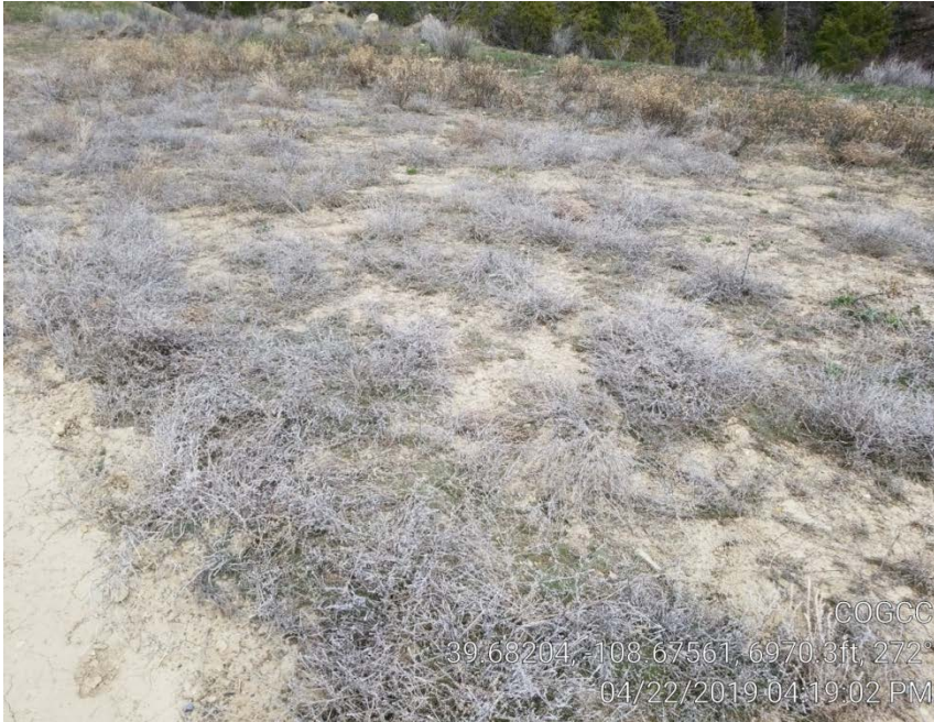
Photo 7. Weed debris on location.