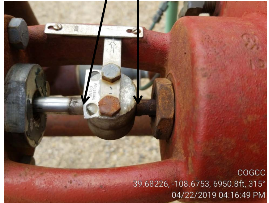
Photo 6. Gas leaking adjacent to separator building.