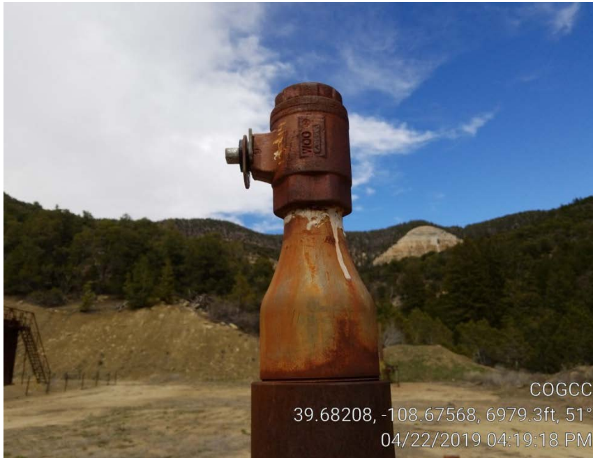
Photo 3. Gas leaking through valve.