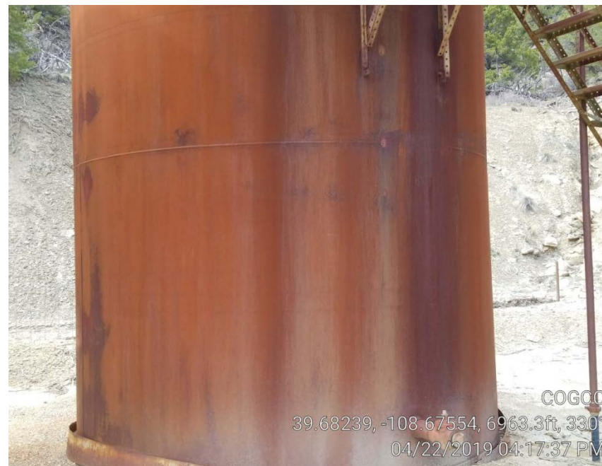
Photo 2. Tank without label.