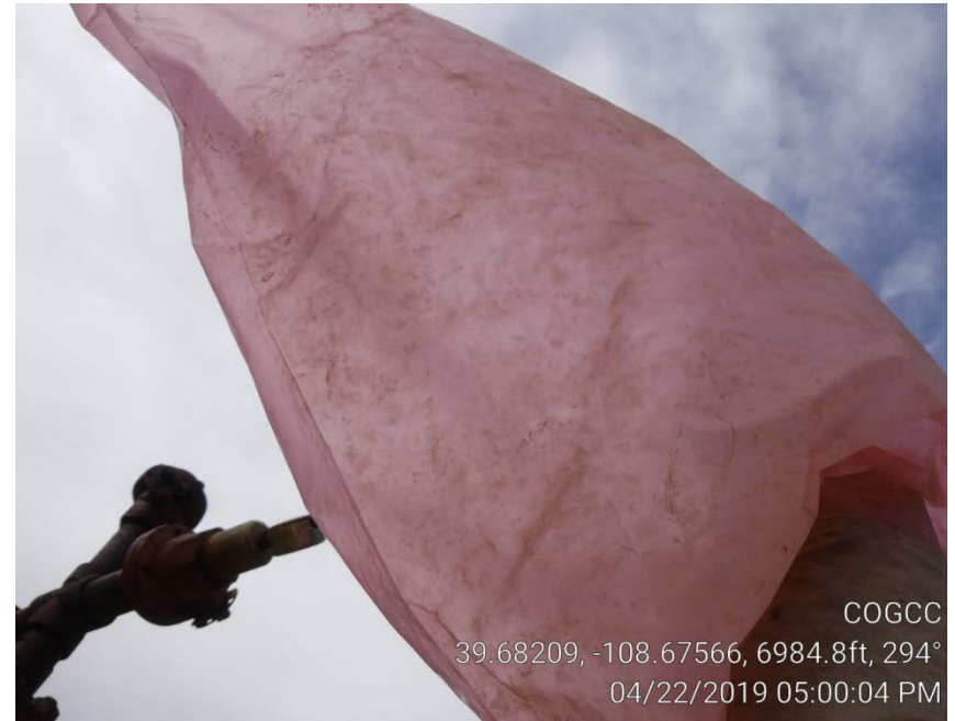
Photo 4. Gas rate measured with 3 cubic ft bag.