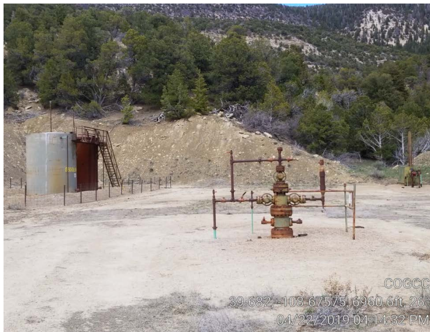
Photo 1. Location looking northeast.