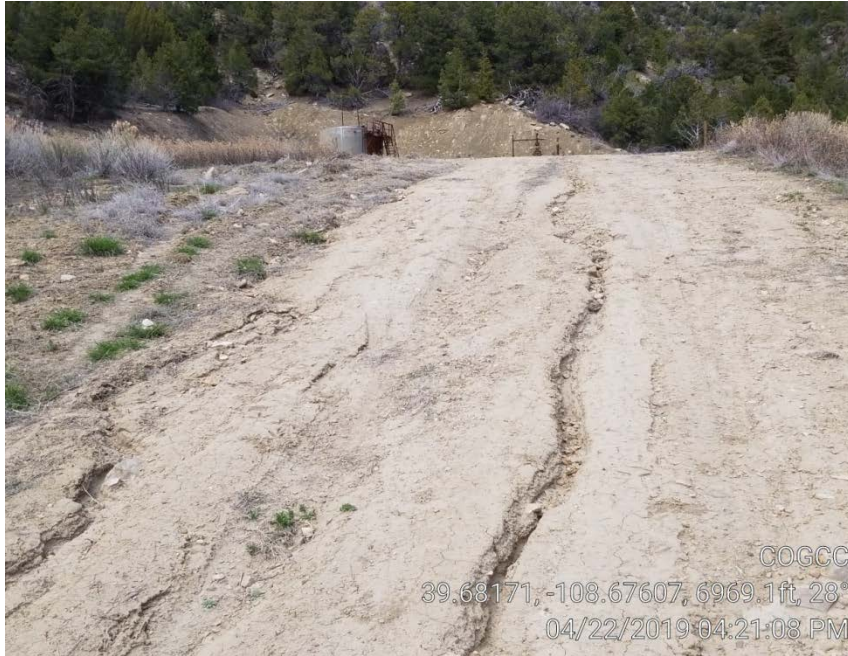
Photo 8. Storm water channels coming from location down the lease road.