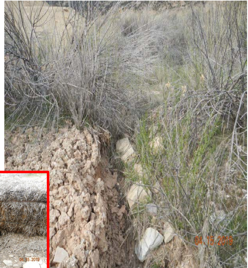
Photo#9: BMPs at South corner of undisturbed (for construction expansion) area of site need maintenance.