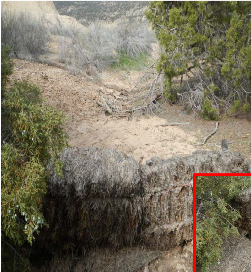
Photo#8: BMPs at South corner of undisturbed (for construction expansion) area of site need maintenance.