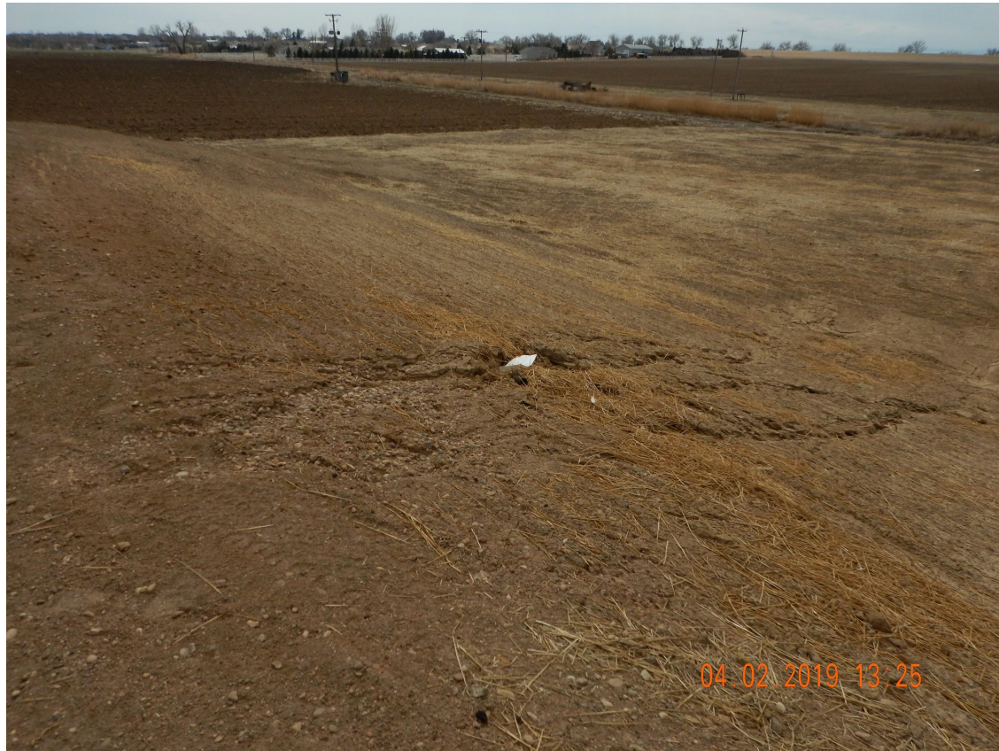
Photo 7. Photo taken from the southwestern location, facing Southwest. See comments under Photo 5.