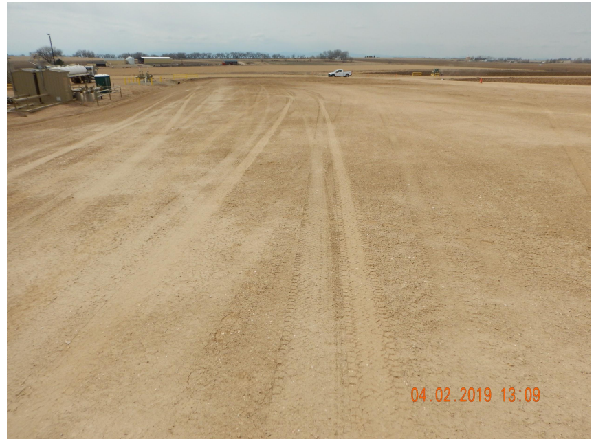
Photo 2. Photo taken from the northeastern interim area, facing West. See comments under Photo 1.