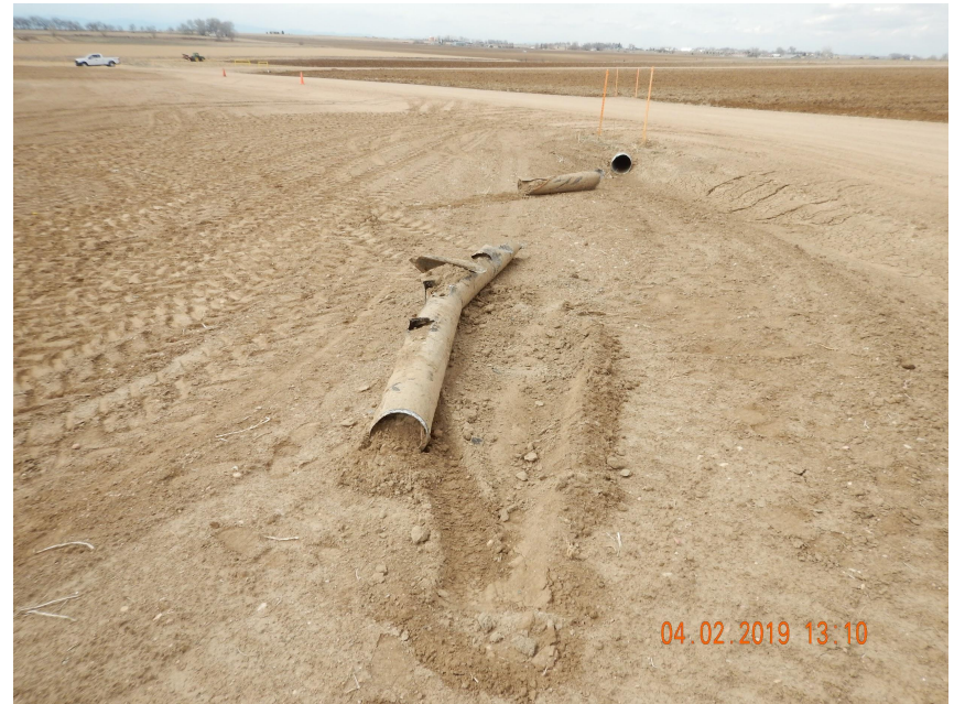
Photo 4. Photo taken from the northeastern interim area, facing Northwest. Operator needs to remove trash/debris from the location.