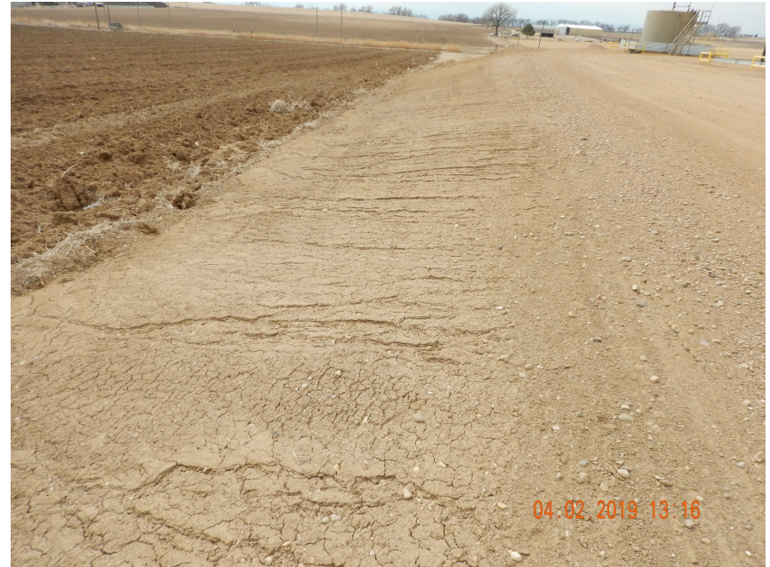
Photo 6. Photo taken from the southern interim area, facing West. See comments under Photo 5.