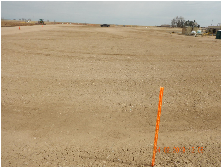
Photo 1. Photo taken from the northern interim area, facing East. Portions of this area were used during the drilling operations for the Hergert 35-D Facility. Also, there was a tank battery located along this eastern area used for well that have been plugged and abandoned.