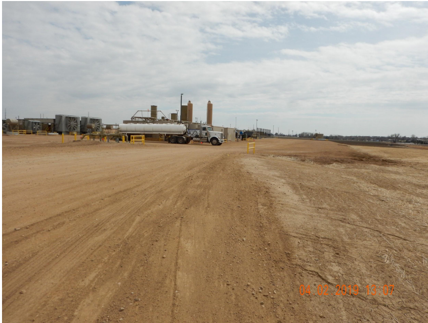
Photo 5. Photo taken from the entrance of the location, facing South. Rill erosion observed along the western portion of the access road. Operator does not have sufficient long-term stormwater BMP to prevent sediment laden stormwater erosion from leaving location.