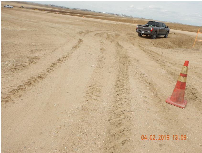
Photo 3. Photo taken from the northeastern interim area, facing North. See comments under Photo 1.